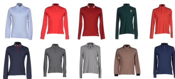
Figure 1: Example of a text and nearest images from the test set. Our embedding produces low distances between texts and images referring to similar objects.