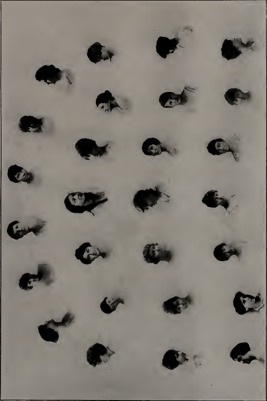
MU PHI EPSILON