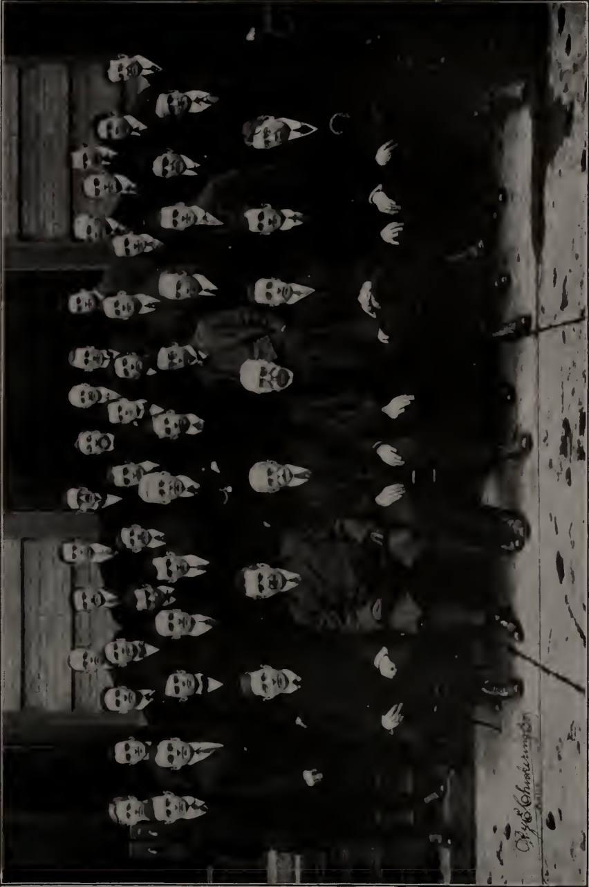
SINFONIA — ALPHA CHAPTER