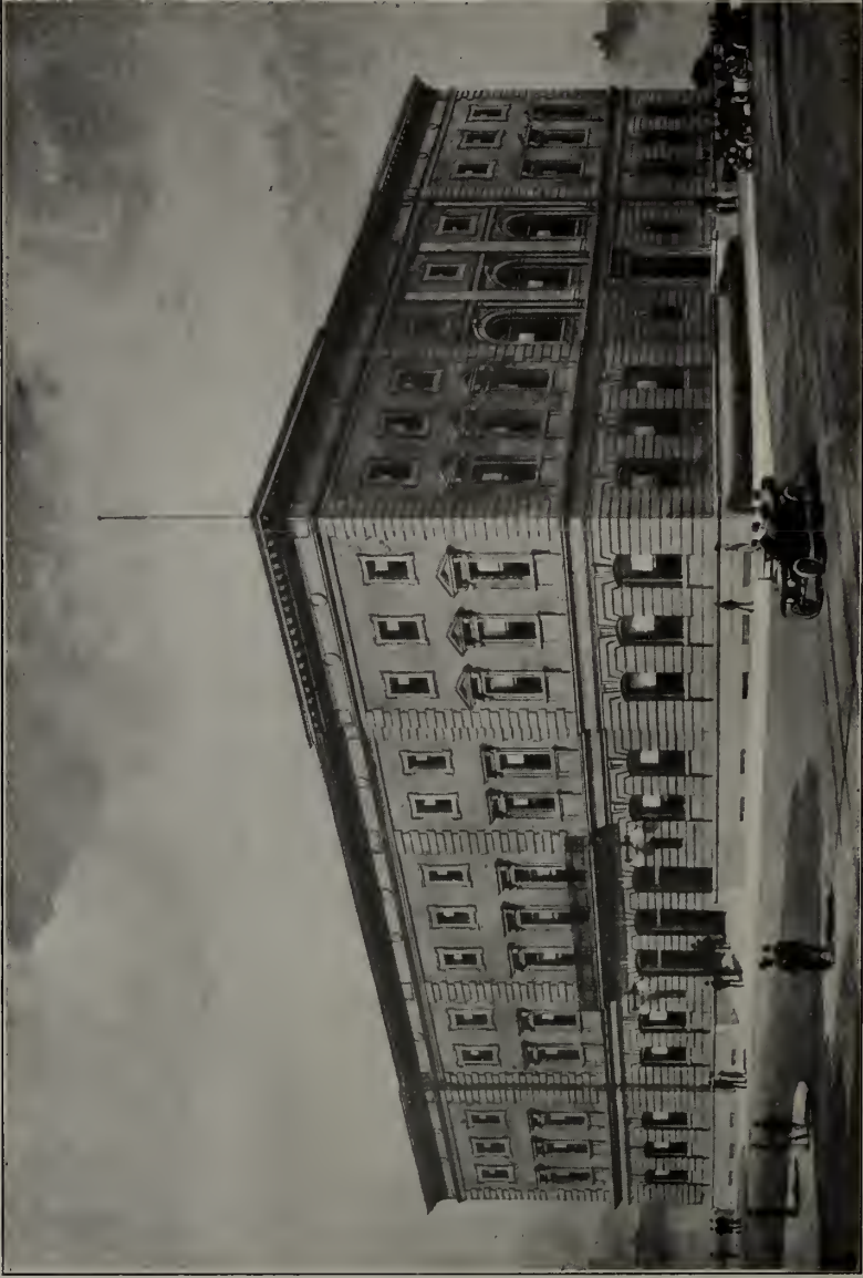
NEW ENGLAND CONSERVATORY OF MUSIC