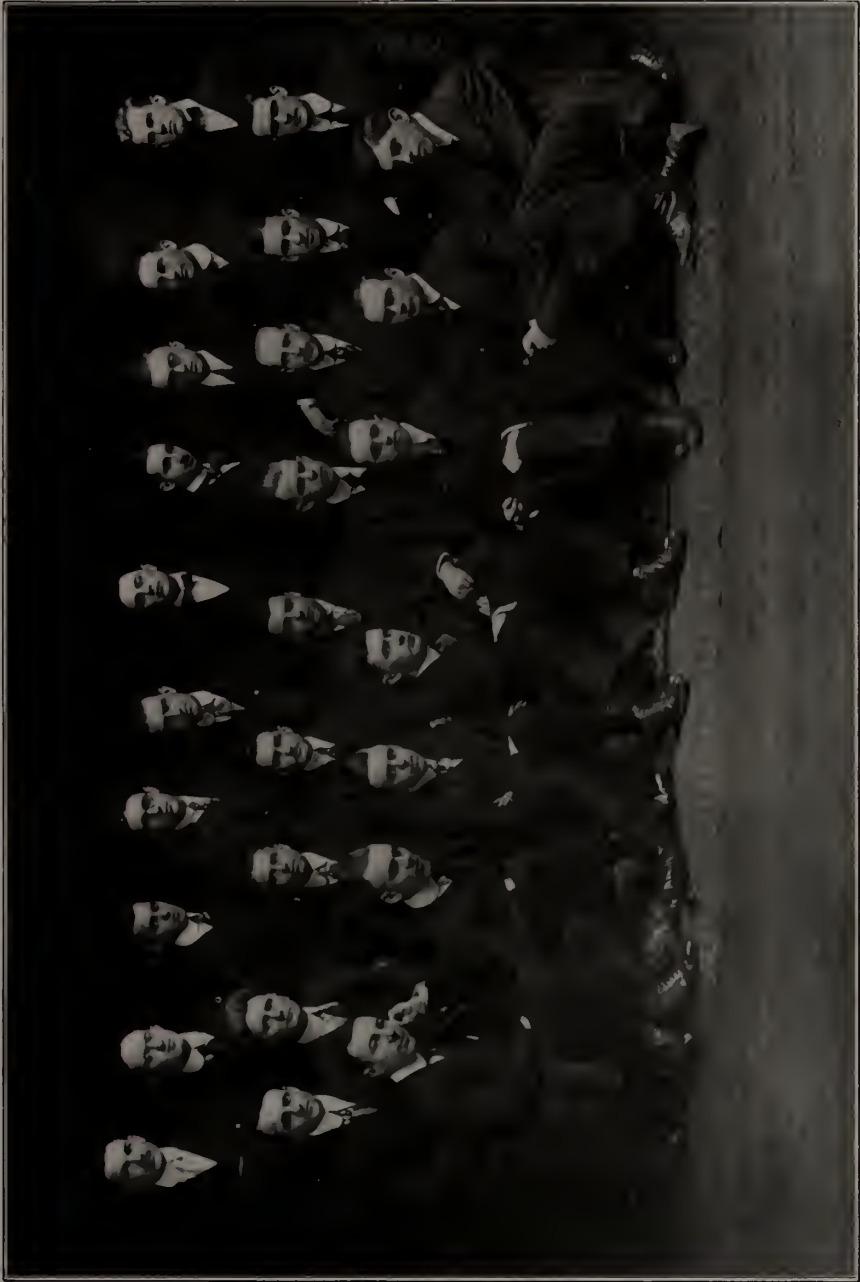
KAPPA GAMMA PSI