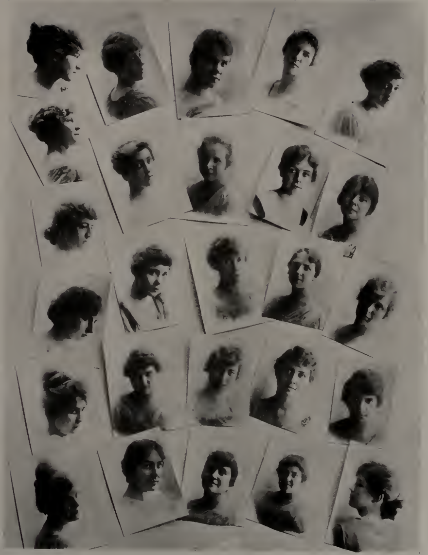
ALPHA CHI OMEGA