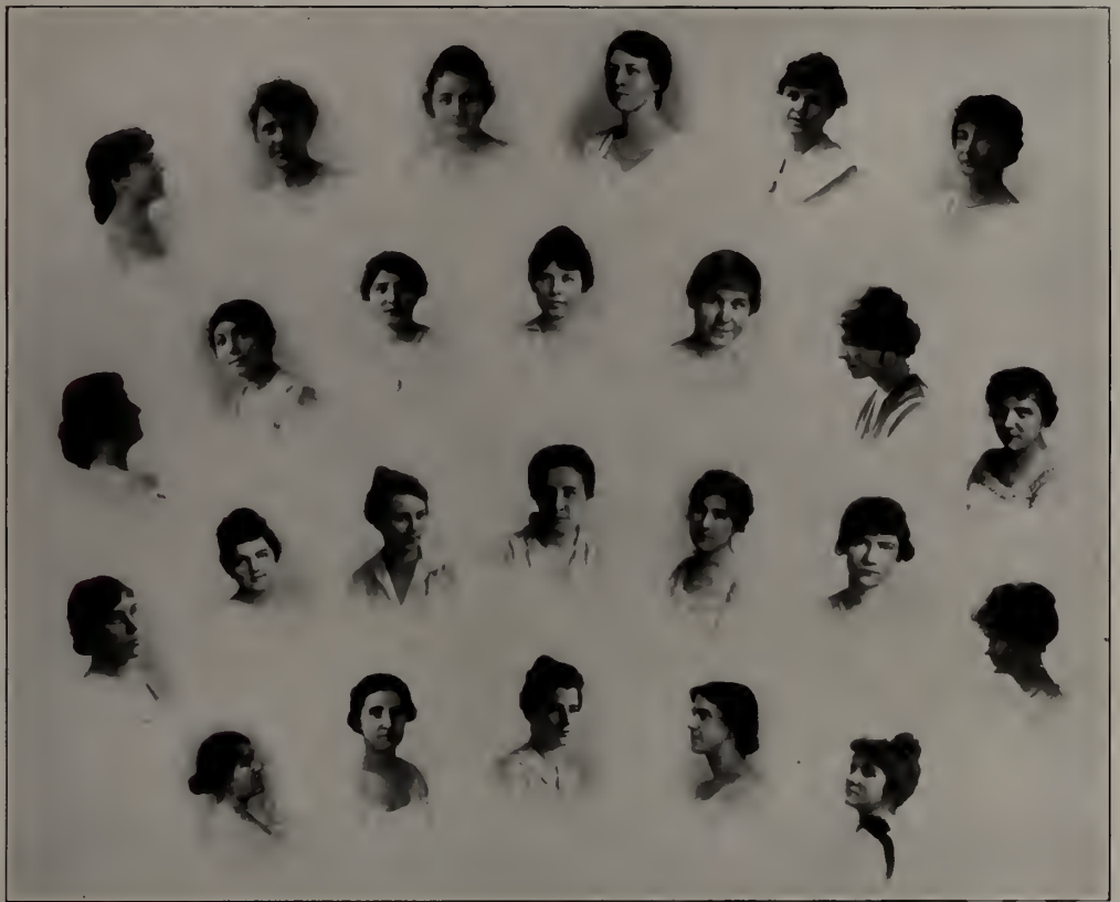
SIGMA ALPHA IOTA