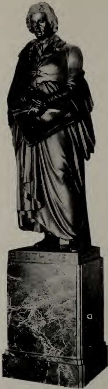
The first to greet us, The last to bid adieu.