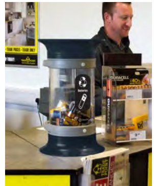
C-Thru™ 5Q Battery Recycling Bin