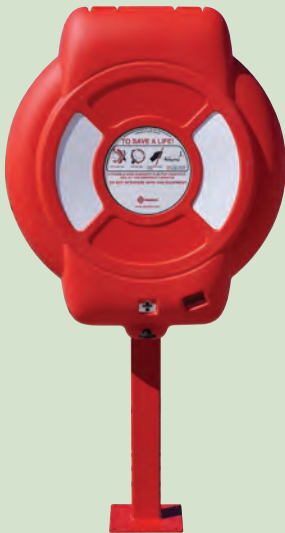
GUARDIAN 30 Holds one 30" Life Ring