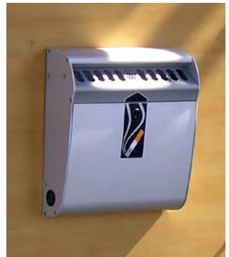
Ashmount™ Cigarette Unit