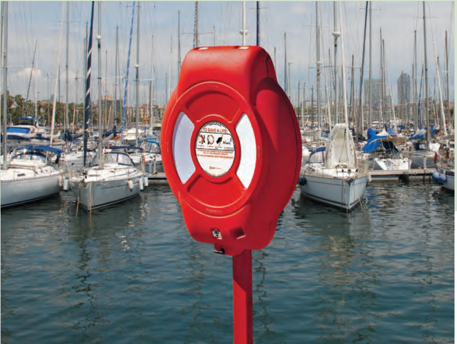
Guardian™ Life Ring Cabinet

Help keep your environment safe and well-protected with water safety equipment from Glasdon. Highly visible and resilient for a long service life, Glasdon ring buoy stations prevent theft and vandalism and are easy to position in any area where open water poses a danger. Our versatile life jacket boxes are designed and constructed with aesthetics, practicality and durability in mind to keep your vital life-saving equipment well protected.