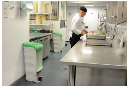
Nexus® Shuttle Food Waste Bin