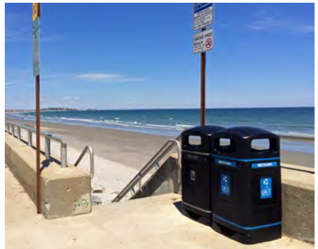
Glasdon Jubilee™ 29G Recycling Bin