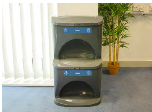
Nexus® Stack 16G Recycling Bin