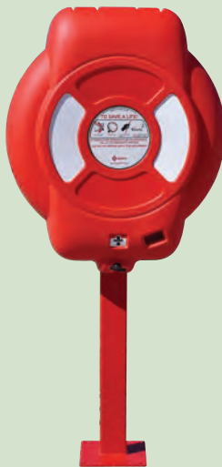
GUARDIAN 24 Holds one 24" Life Ring