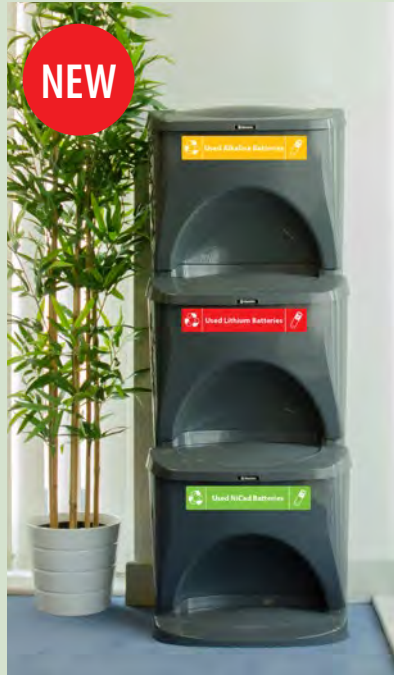
NEW Nexus® Stack 24G Recycling Bin

Discover our range of recycling containers for batteries and start doing your part to create a sustainable environment with just one small battery at a time!