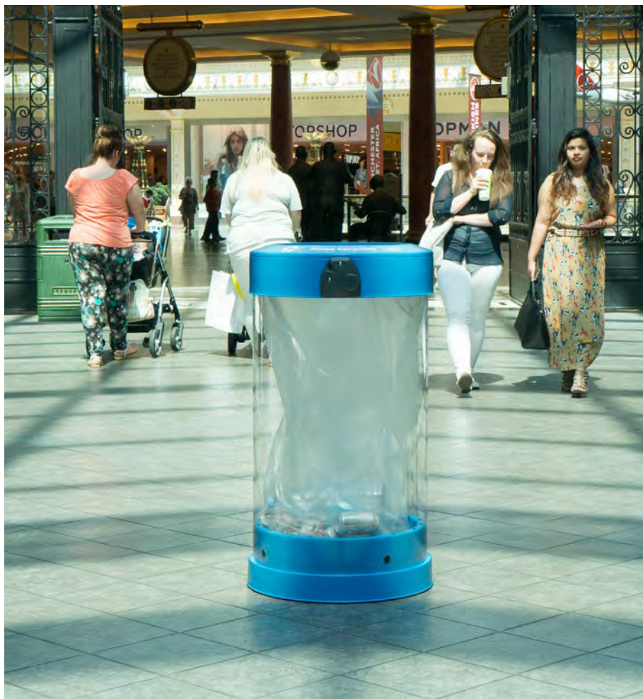
C-Thru™ 50G Trash Can