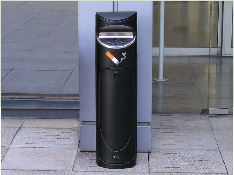
Ashguard SG™ Cigarette Unit

Glasdon designs and produces a range of cigarette units which can be situated in outdoor smoking areas, outside buildings, in parks and on sidewalks. Within our range of cigarette waste containers, there are units that can be wall mounted as well as free standing. Having a cigarette unit mounted to a wall takes up very little space, making it perfect for narrow-footed areas. Help to reduce the cost of cleaning up cigarette butt litter for your organization by installing a cigarette ash receptacle.