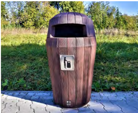
Sherwood™ Trash Can