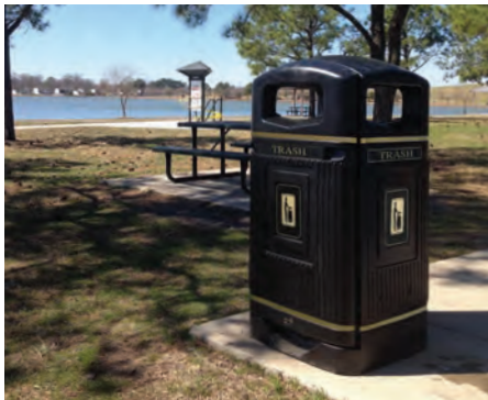
Glasdon Jubilee™ 29G Trash Can