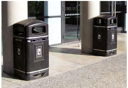
Glasdon Jubilee™ 29G Trash Can