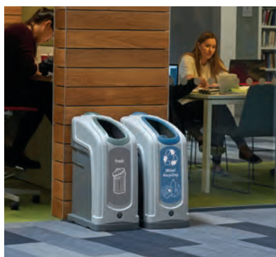
Nexus® 13G Recycling Bin