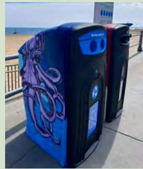
Nexus® City 96G Recycling Bin