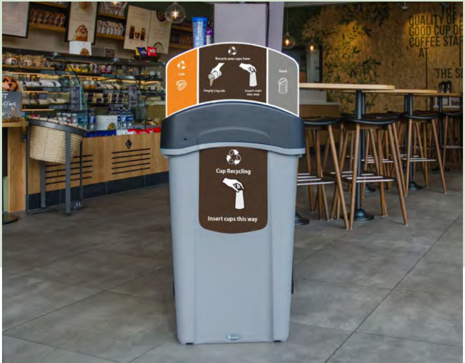
Eco Nexus® Cup Recycling Station

Increase your disposable cup recycling rate with cup recycling stations by Glasdon. We offer purpose-designed cup recycling stations to help you implement an effective and successful cup recycling program.