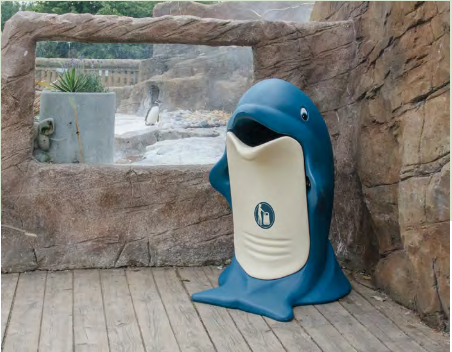
Splash™ Trash Can

An animal-shaped trash can is an ideal solution to help encourage young children to dispose of their trash correctly in both indoor and outdoor environments. The fun and colorful nature of the trash cans means that they are able to complement all areas for children. You can also personalize our animal-shaped trash cans to feature your company logo, color and message.