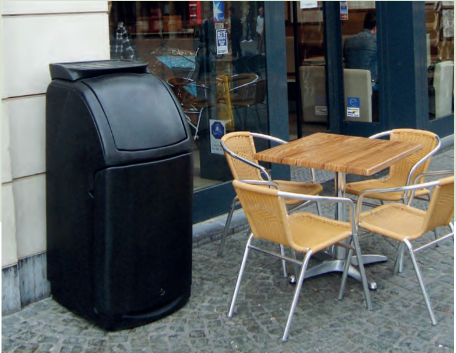
Nexus® 36G Trash Can

Purposely designed for the catering industry, Glasdon restaurant trash cans are ideal for fast-food diners, cafeterias, commercial kitchens and any areas where food is prepared or consumed. The easy-to-use foot pedals, tray holders and large apertures make food waste disposal effortless and hygienic.