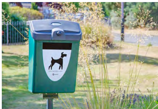
Fido™ Pet Waste Station