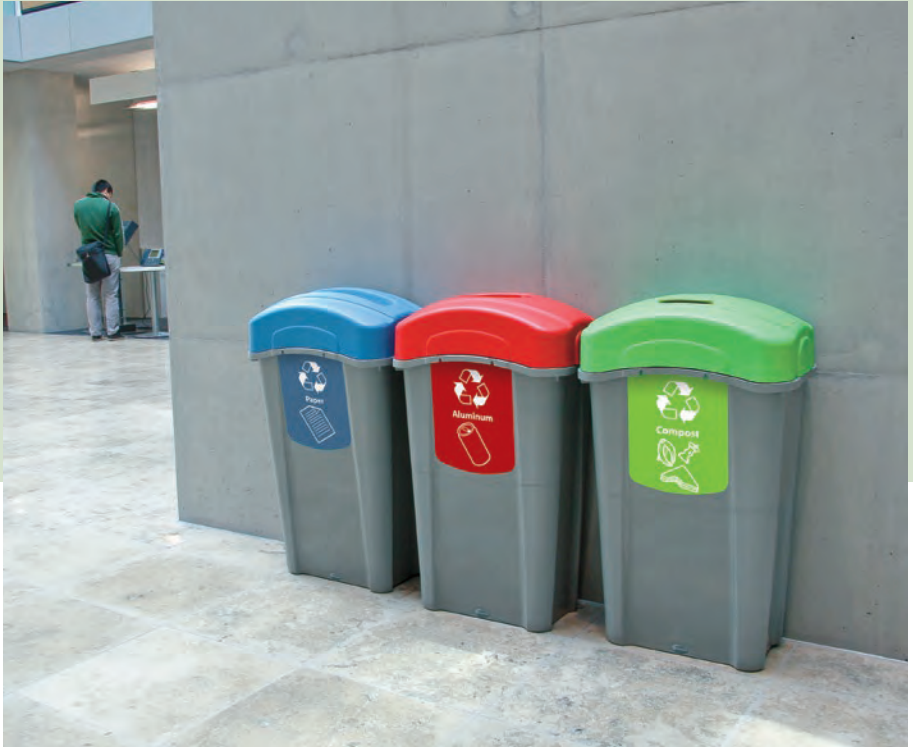
Eco Nexus® 23G Recycling Bin

We design and manufacture a wide range of indoor recycling bins. Our recycling containers are available in a large selection of styles, materials and capacities to suit your requirements. Apertures and decals are available for various waste streams, which allow you to manage recycling waste more effectively.