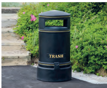
Topsy Jubilee™ Trash Can