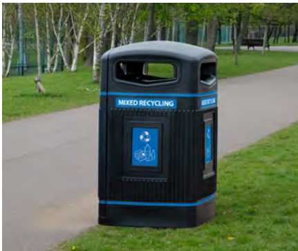
Glasdon Jubilee™ 80G Recycling Bin