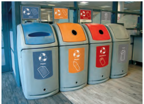
Nexus® 36G Recycling Bin