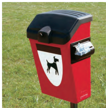
Fido™ Pet Waste Station with dog waste bags dispenser