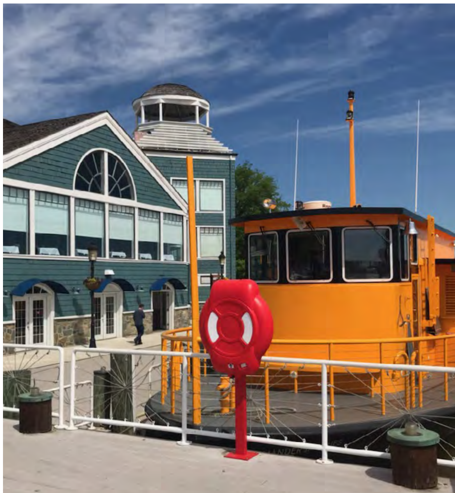
Guardian™ Life Ring Cabinet