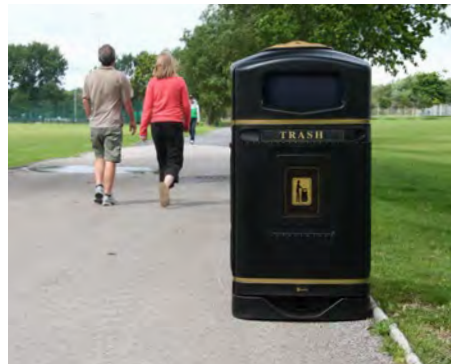
Glasdon Jubilee™ 29G Trash Can