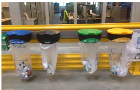
Glasdon Orbit™ Recycling Bag Holder