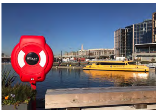
Guardian™ Life Ring Cabinet