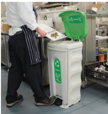
Nexus® Shuttle Food Waste Bin