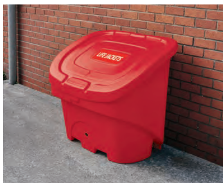
Nestor™ 106G Life Jacket Storage Box