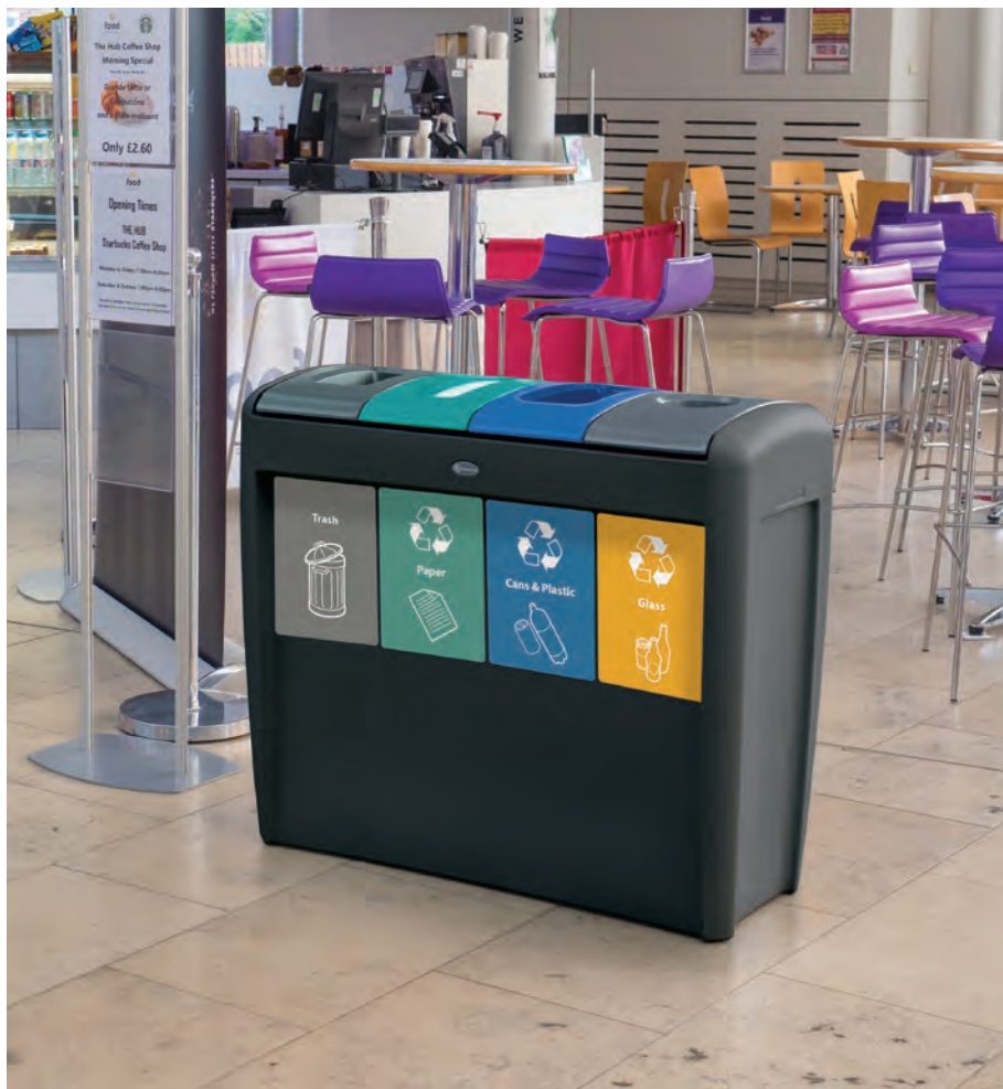
Nexus® Transform Quad Recycling Station