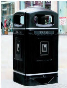
Glasdon Jubilee™ Trash Can with Ashtray Option