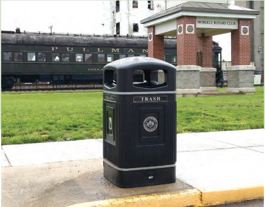
Glasdon Jubilee™ 29G Trash Can

Glasdon outdoor trash cans are designed in a choice of sizes, colors and styles, providing waste management solutions that will complement any landscape. Constructed from durable materials, these trash cans are low-maintenance, and designed to resist the effects of adverse weather conditions, corrosion and vandalism.