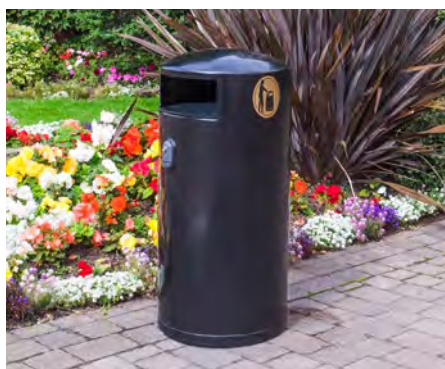
Community™ Trash Can