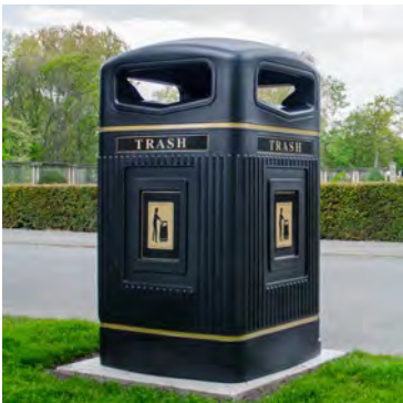
Glasdon Jubilee™ 80G Trash Can