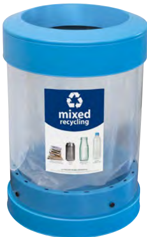
C-Thru™ 36G Recycling Bin