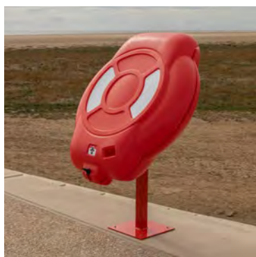
Guardian Short Angled Post Kit