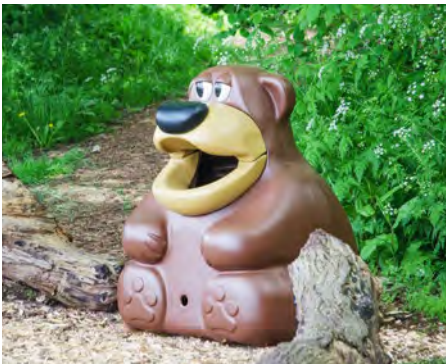
TidyBear™ Trash Can