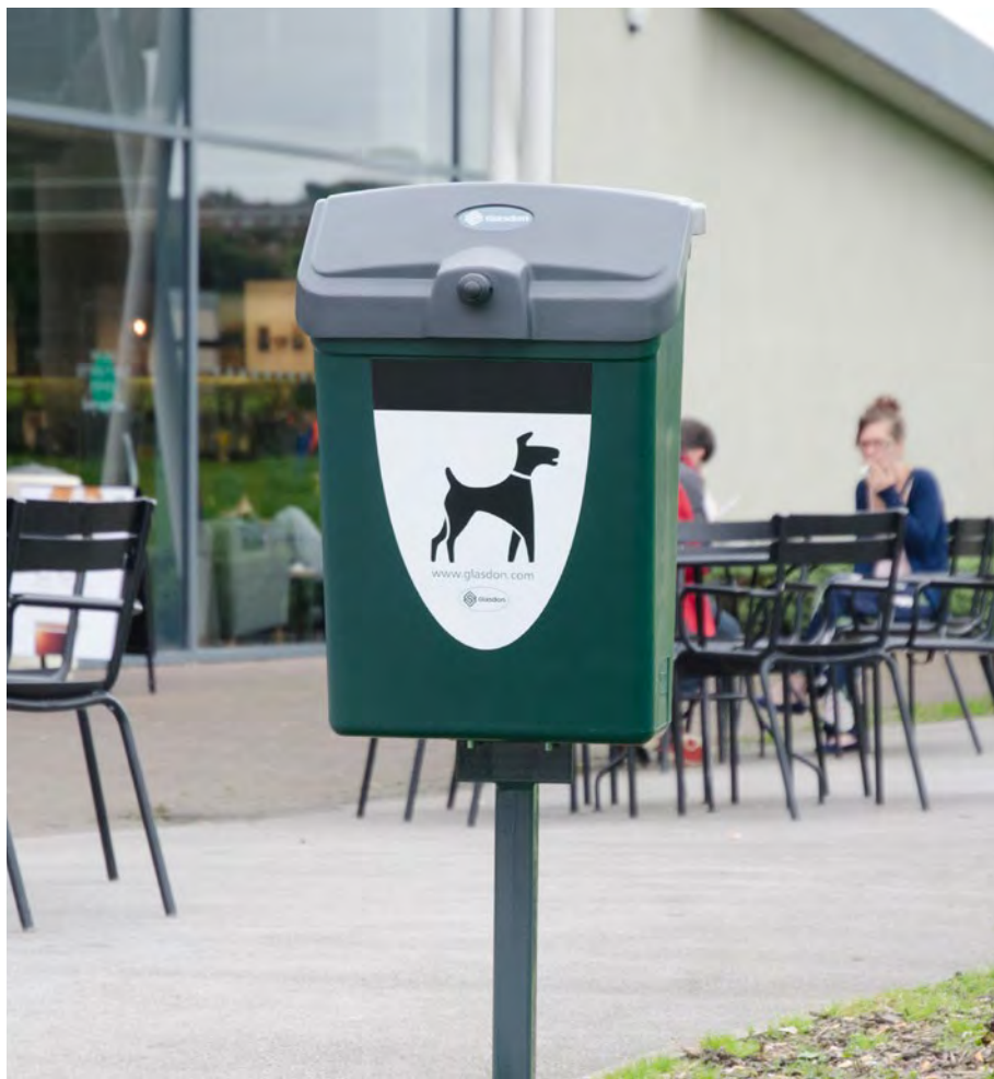
Fido™ Pet Waste Station