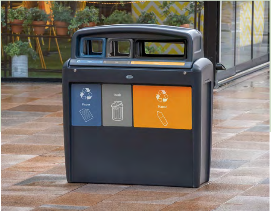
Nexus® Transform City Trio Recycling Station

We produce an extensive range of outdoor recycling containers of the highest quality in both traditional and contemporary designs. All of our recycling containers are designed to be hard-wearing and long-lasting and feature easily identifiable decals to make recycling easy.