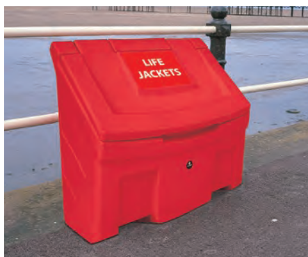
Slimline™ 42G Life Jacket Storage Box