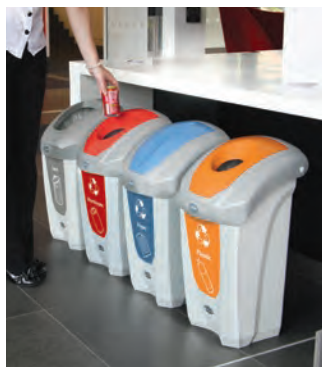
Nexus® 8G Recycling Bin