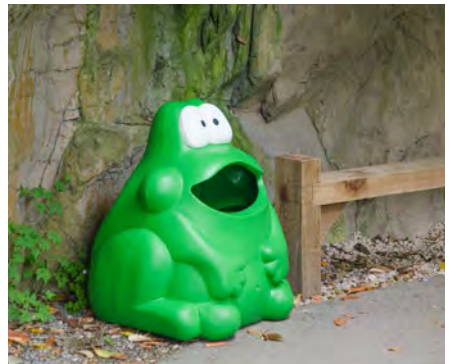
Froggo™ Trash Can