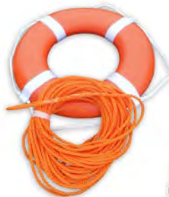
24" USCG Approved Life Ring with 100' Rope