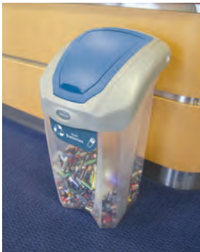
Nexus® 8G Battery Recycling Bin