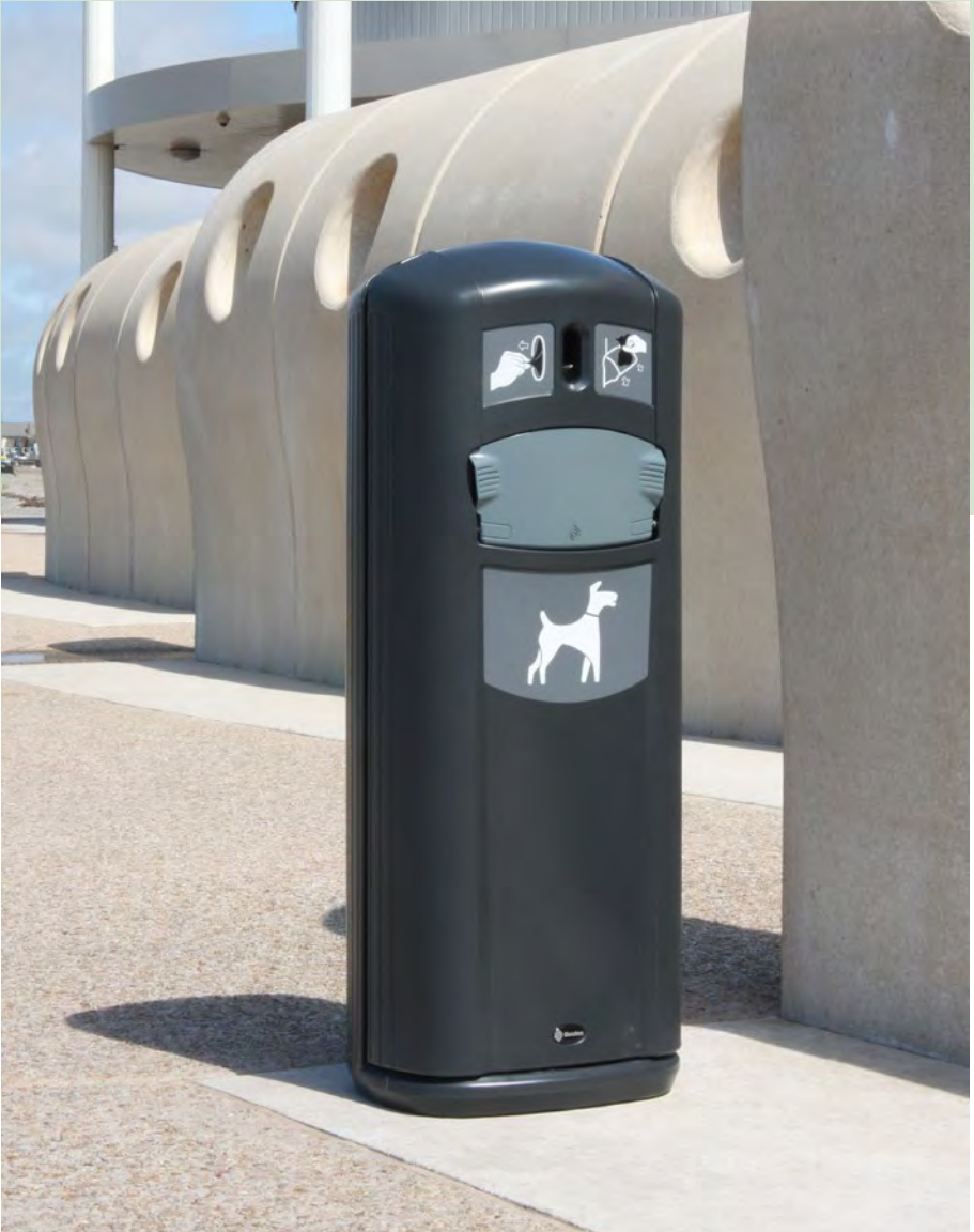
Retriever City™ Pet Waste Station

Our selection of pet waste stations is popular for use in parks, on sidewalks and in bark parks. The clear decals help to encourage people to dispose of their dog poop correctly and the contemporary design of our dog waste units means that they complement existing landscapes easily.