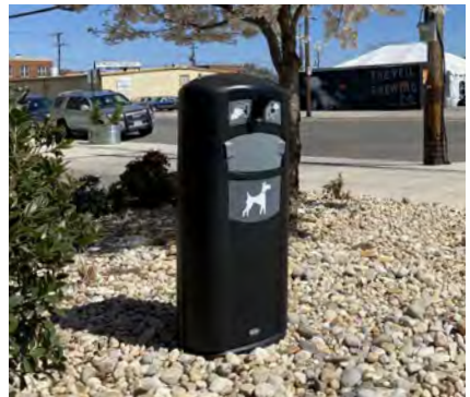
Retriever City™ Pet Waste Station