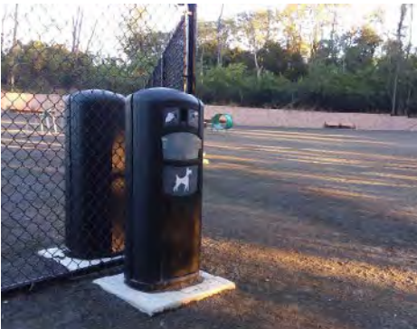
Retriever City™ Pet Waste Station

Available in a choice of black, anthracite gray and deep green, and with optional fixing kits and a dog leash hook accessory, Retriever City is ideal for modern urban areas, parks and bark parks.