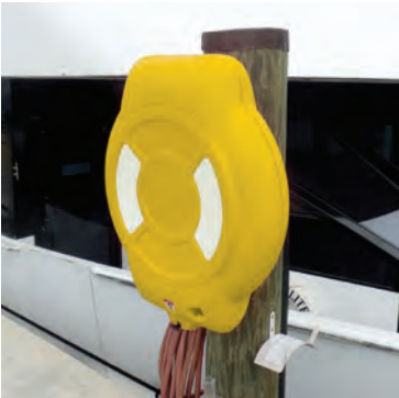
Guardian™ Life Ring Cabinet