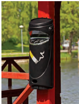
Ashmount SG™ Cigarette Unit