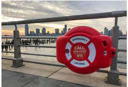
Guardian™ Life Ring Cabinet