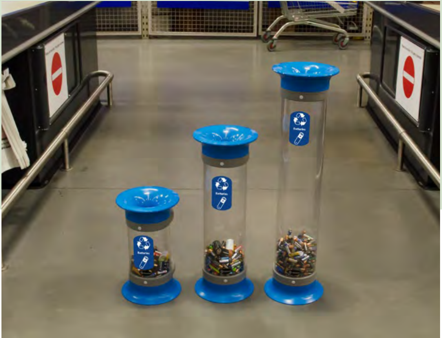
C-Thru™ 5Q, 10Q and 15Q Battery Recycling Bin

Help to recover the valuable materials found within batteries and improve waste diversion rates with Glasdon battery recycling containers. These battery collection tubes are a popular addition to recycling programs within schools, offices, convenience stores and industrial environments.