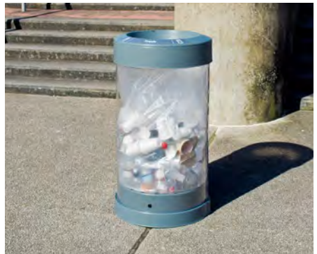
C-Thru™ 50G Trash Can