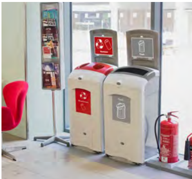
Nexus® 26G Recycling Bin