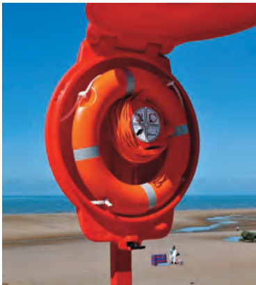
Guardian 24" with 24" Life Ring

USCG Type IV approved Glasdon life rings are an ideal buoyancy aid for use around any location where there is a drop to the water. The life rings are available in a 24" or 30" size and can be stored in the protective Guardian life ring cabinets.