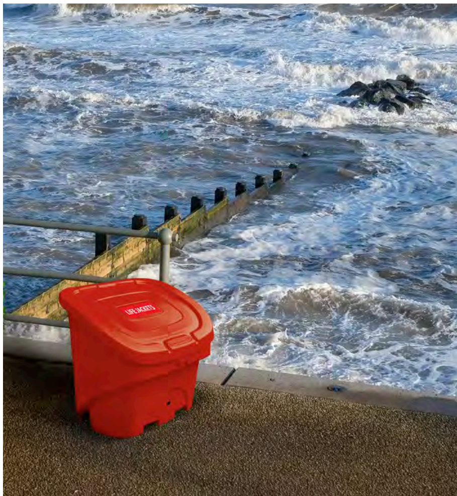
Nestor™ 106G Life Jacket Storage Box