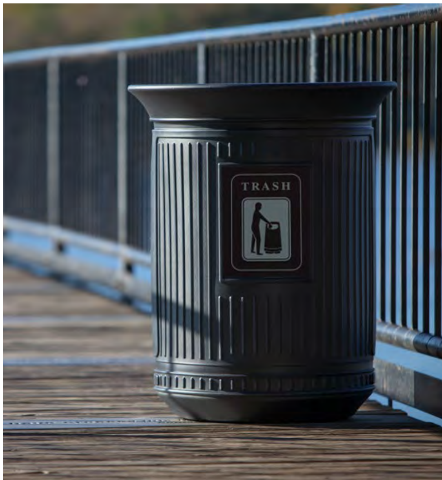
Canyon™ Trash Can