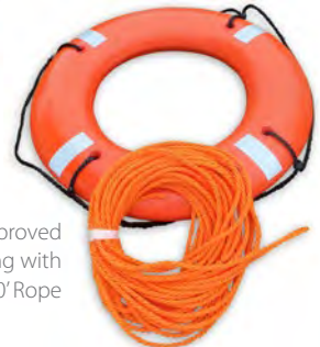
30" USCG Approved Life Ring with 100' Rope