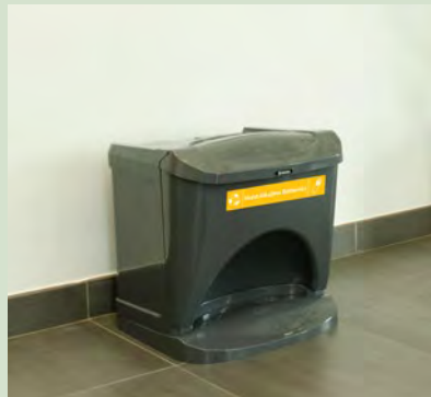
NEW Nexus® Stack 8G Recycling Bin