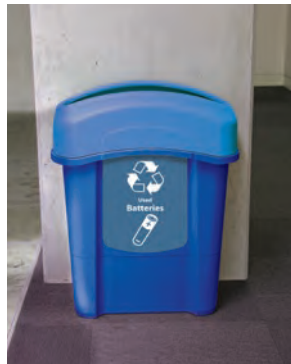
Eco Nexus® 16G Battery Recycle Bin