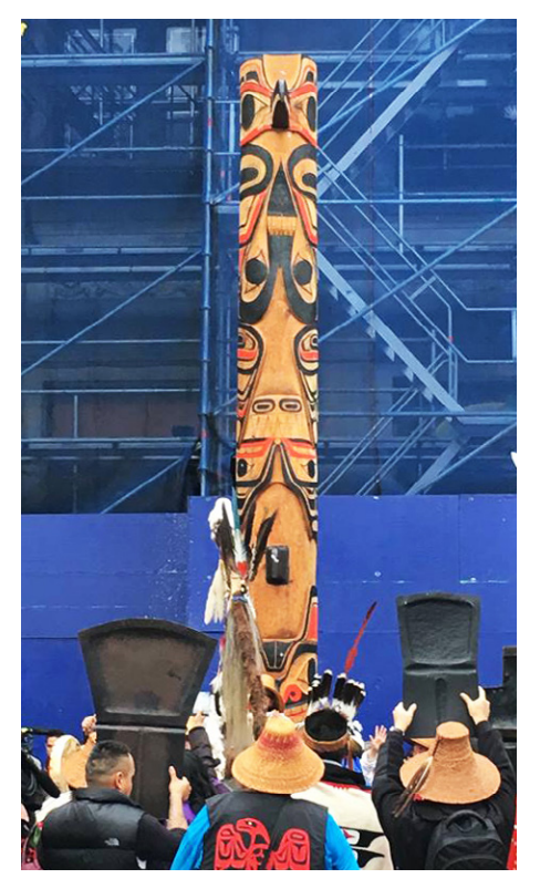
Survivor's Pole in Victory Square