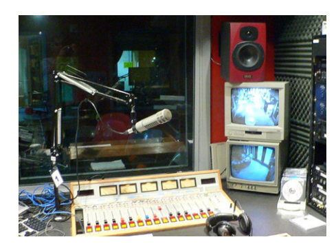
Renovated space for Co-op Radio