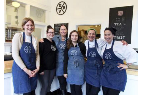
East Van Roasters space and equipment