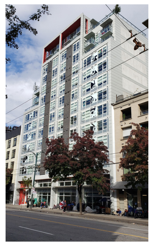
Olivia Skye - 41 East Hastings, a mix of social housing and market rental