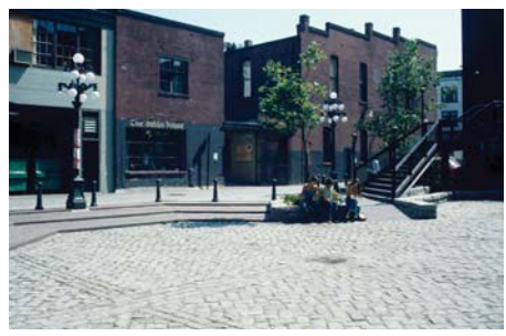
Blood Alley Square/Trounce Alley, 1975 Archives COV-S511---:CVA 780-667

neighbourhood gatherings; conserve its important heritage characteristics; propose new ways to manage commercial dumpsters and waste in the alley; and create a stewardship plan that involves local residents and communities.