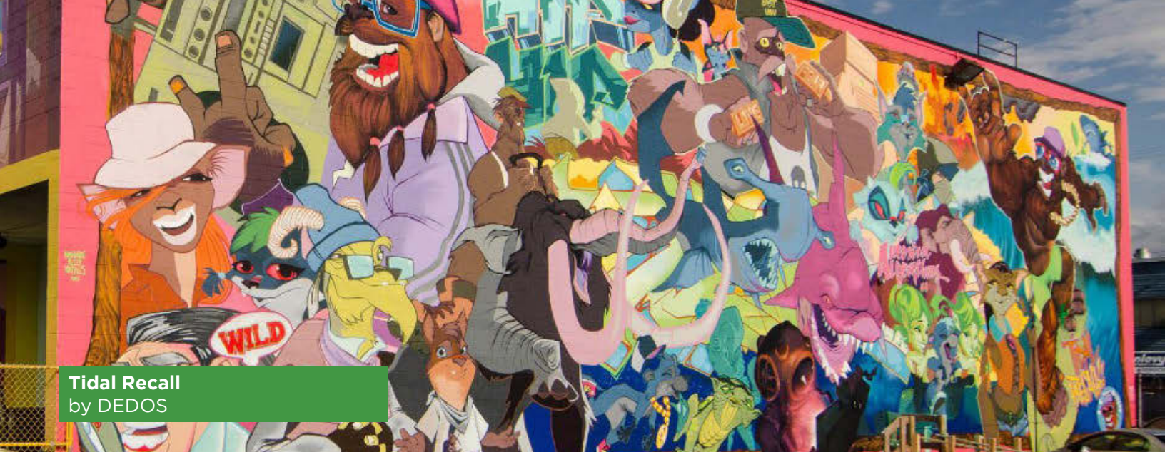
Tidal Recall by DEDOS