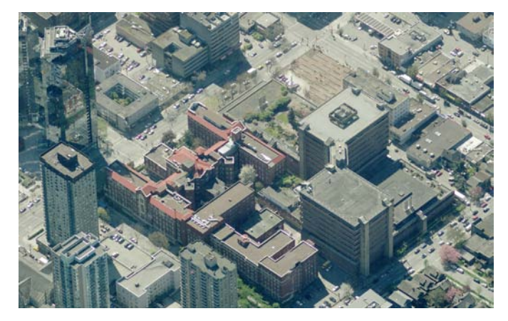
Assumes the site remains a hospital with 4,700 jobs.