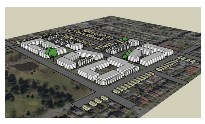
Assumes no rezoning as the Little Mountain policy is not taken into account. Illustration represents development at existing zoning which allows approximately 970 units.