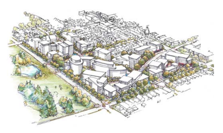
Assumes build-out based on recently adopted policy which allows rezoning and redevelopment to create 1,475 to 1,625 units.