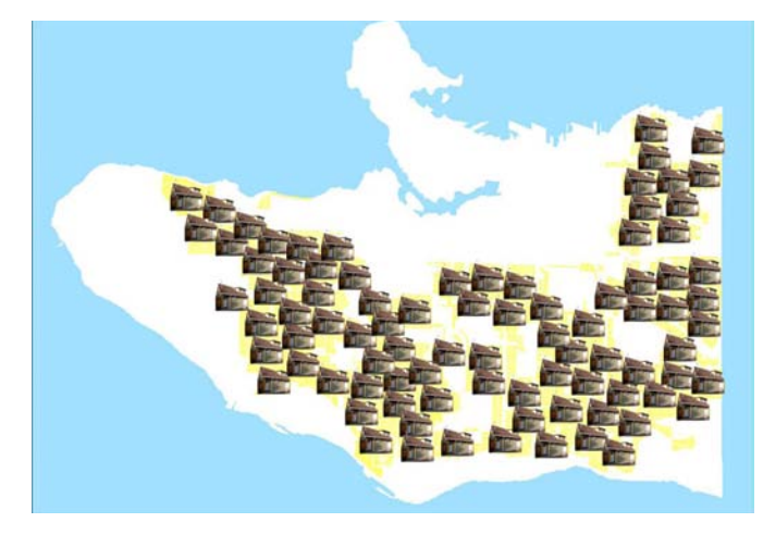
Assumes all laneway houses would be redeveloped, adding 88,000 people but it could take 300 years to build out.