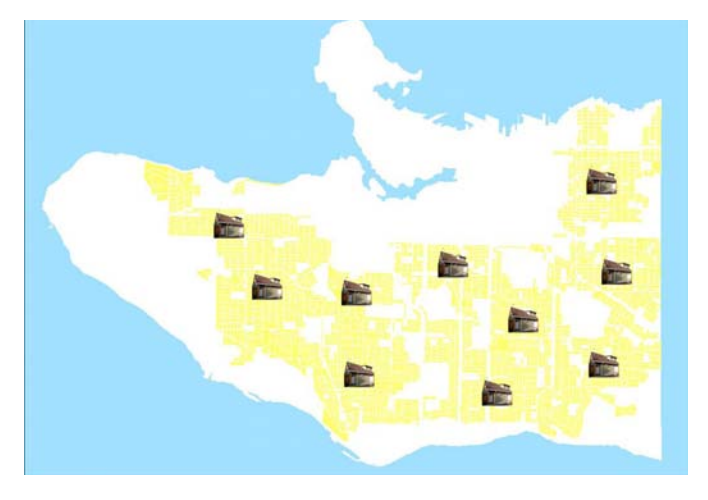
Assumes growth of 10,000 people by 2041 based on actual rate of development of 230 units per year.