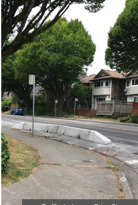
Traffic bulge on Prior St

The City is making safety modifications to the Raymur Ave railway crossing (north of Hastings St) to meet Transport Canada's new "Grade Crossing Standards", which include closing the crossing and removing the rail crossing warning system. Public engagement with stakeholders occurred in June 2021 and the City is now reviewing community feedback in conjunction with the design requirements. The date of installation is postponed until further notice, pending detailed analysis results.