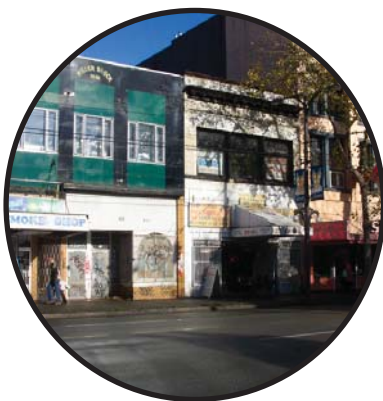
East Hastings Street

Conditions in the DTES have changed considerably since the retail continuity policies were first introduced in 1982 including social health challenges, high vacancies, reduced retail interest, and increased need for community-serving uses. While the retail continuity policies in Victory Square achieves active pedestrian-oriented retail and commercial streets, updates are needed to the Downtown Eastside Oppenheimer District policies to address changing needs. The DTES Plan requires a review of retail continuity policies with the goal of increasing pedestrian activity, commercial and service uses, and general vitality to Hastings, Main, and Powell Streets as well as removing barriers to new enterprises, development, and creativity (Policies 6.5.9 and 10.3.1).