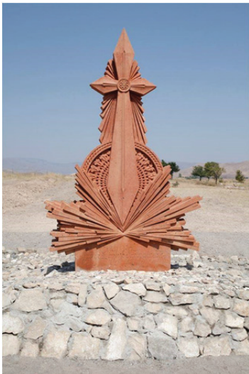
Fig. 4 Sword-cross in the defense zone of Artsakh, photo by V. Hambardzumyan.

Through these details, the masters tried to give a victorious-defensive image to the composition and thereby connect it to the theme of the liberation war. The most unique manifestation, which is fundamentally related to the liberation struggle of Artsakh, is a unique and new phenomenon in the khachkar culture: "sword-crosses" (or "border crosses", fig. 4). The basis of the perception of the cross as the most victorious weapon and symbol of victory comes first of all from the redemptive crucifixion of Christ, the victory over death, the rite of Baptism, immersing the cross in water to kill or bind the dragon, death and sin, the scene of the destruction of hell, the visions of Gregory the Illuminator and Constantine the Great, finally, the similarity of the cross with the sword 15 . Khachkar inscriptions also describe the cross as an unfading weapon that defeats enemies and is infused and anointed with divine blood 16 .