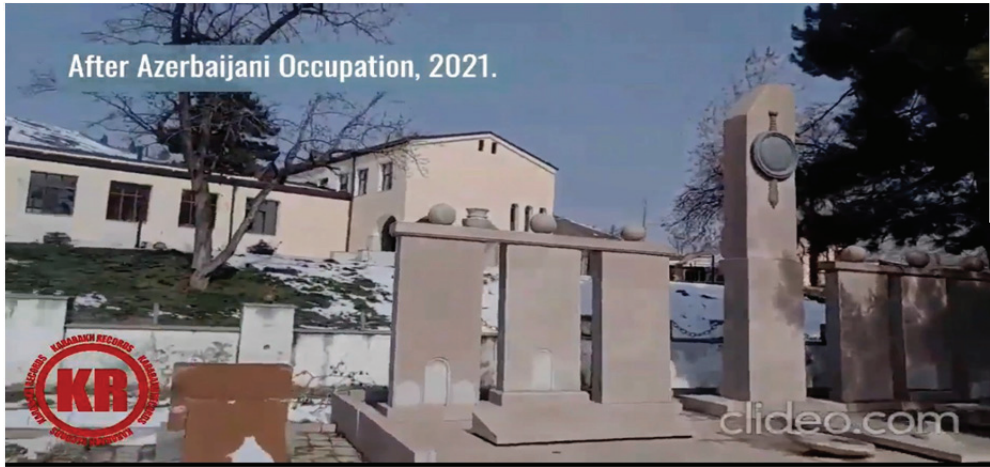
Figura 8 The destruction of the khachkar of Ukhtadzor village.

Next, we see the destruction of the khachkar placed in the courtyard of the Ghazanchetsots church in Shushi.