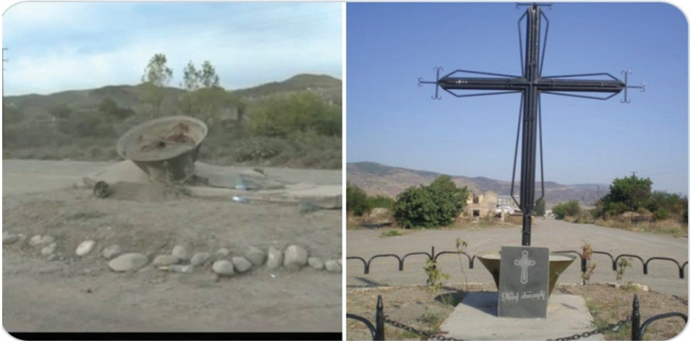
Figura 9 The fall of the metal cross of the city of Vorotan.

toppled a metal cross 24 (fig. 9), the cross from the dome of St. Harutyun Church in Hadrut region was removed 25 , the cross of Spitak Khach church in Vank village of Hadrut region 26 , as well as the cross of Mekhakavan Zoravor St. Astsvatsatsin or St. Mariam Astsvatsatsin church, which was removed before the church was completely destroyed 27 .