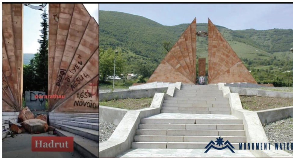
Fig. 7 The destruction of the monument dedicated to the victims of Artsakh war.

Next case of vandalism is the monument dedicated to the victims of Artsakh war. A video appears on the Internet, where Azerbaijani militants opened fire in the direction of khachkar. And already on June 23, 2021, a user named “ Karabakhskii Vestnik ” (“Карабахский Вестник”, “Karabakh Bulletin”) posted on the Telegram, where it is clearly seen that the khachkar is completely broken, only the base remains standing, and the entire monument is desecrated 22 (fig. 7).