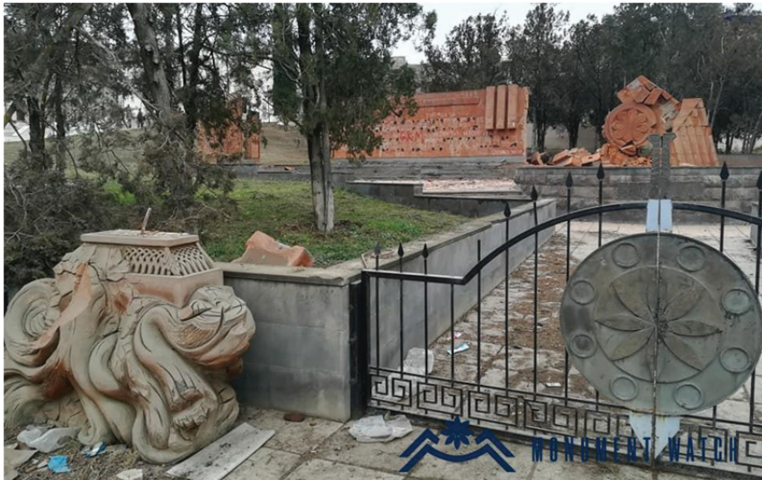
Fig. 6 The destruction of the "Revived Talish" monument, photo by http://monumentwatch.org/ .

On December 3, 2020, photos are published on Facebook, in which we see that after the 44-day war, the Azerbaijanis destroyed the "Revived Talish" monument of the Talish village of the Martakert region, the khachkars placed on both sides of the entrance are again the works of Varazdat Hambardzumyan 21 (fig. 6).