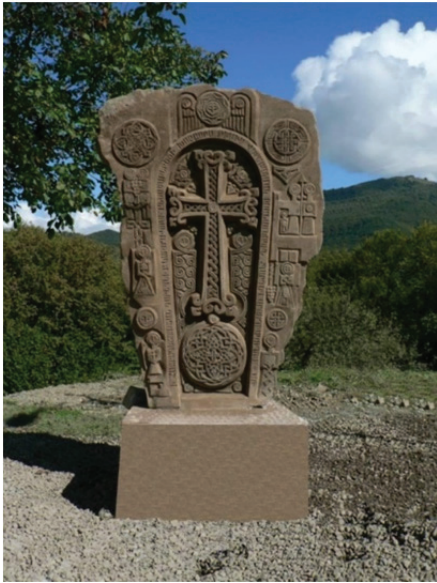
Fig. 2 Khachkar, work of R. Askaryan, by R. Askaryan.

had their own distinct place- the interior of the composition. It is not always possible to find a mutual connection among these characters, which gives a special drama to Askarian's art (fig. 2). It is interesting to study the modern khachkar culture of Artsakh from the point of view of the Artsakh liberation war, because as we have already mentioned, a significant part of them is dedicated to the first Artsakh war. In some cases, they are repetitions of classic examples of khachkars, and if there is no inscription, it will be difficult to find a connection with war, defense or victory.