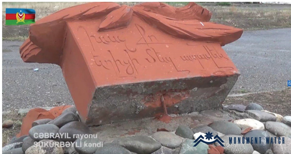
Fig. 5 The destruction of the khachkar, Jrakan (Jabrayil), photo by http://monumentwatch.org/ .

Still during the war, in the video published by the Ministry of Defense of Azerbaijan on October 7, 2020, it is clearly seen that in the village of Shykyurbeili of the Jrakan (Jabrayil) region, the Christian monument made of tuff in a form of crosses bearing an Armenian inscription “Your cross will be our support” by Varazdat Hambarzumyan, has been demolished 18 . In the video, it can be seen that the khachkar is almost completely broken, only the part of the inscription remained half standing (fig. 5).