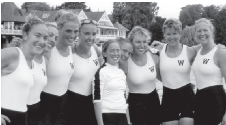
2000 Women's Henley Prize Winners

Other appearances: 1958, 1973, 1984, 1995, 1997, 2013