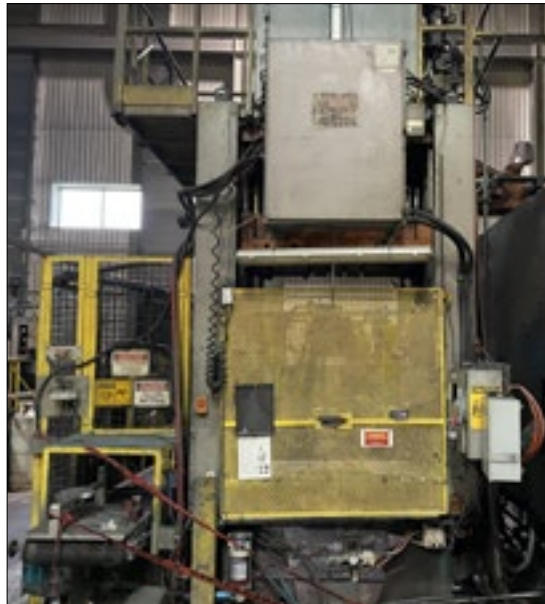
50 Ton Trim Press