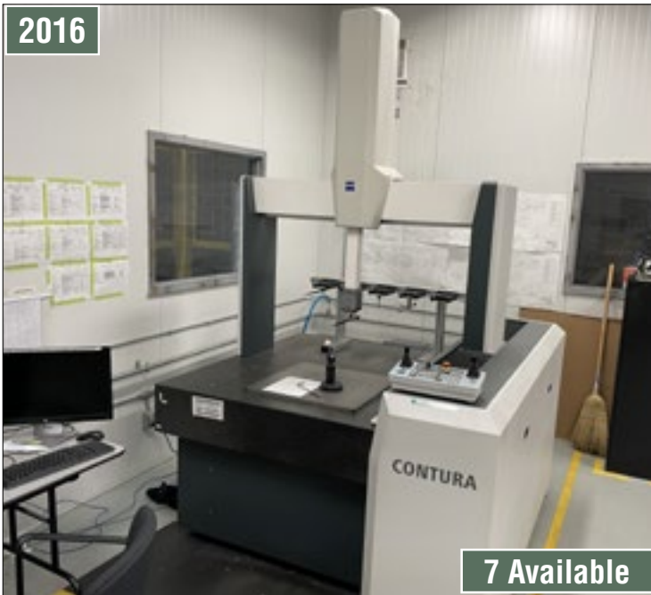
View of Zeiss CMM's, New As 2016