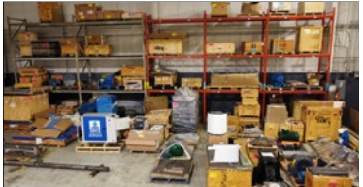
View of spare parts