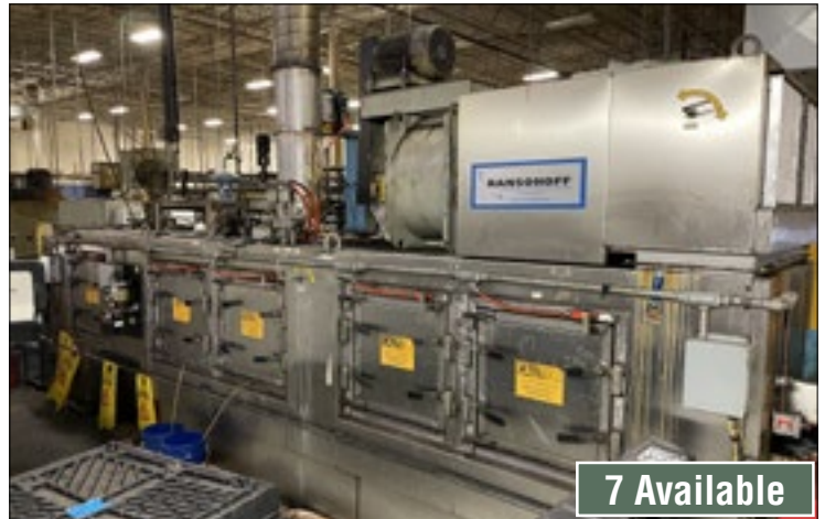
Ransohoff Pass Through Washer