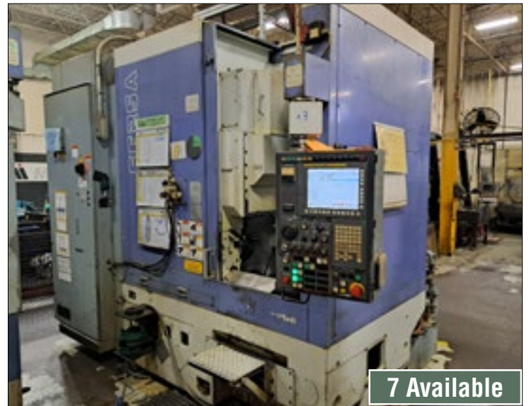
Mitsubishi SE 25 A CNC Gear Shaping Machines