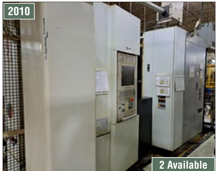
Mori Seiki NH 5000

Visit our websites to see videos of machines operating! hilcobid.com | diecastmachinery.com | workingmancapital.com