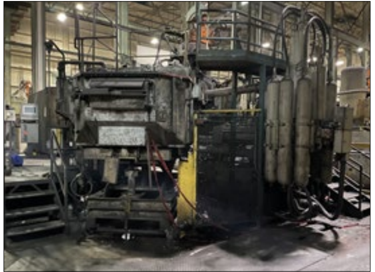
Striko Westoffen Dosing Furnace