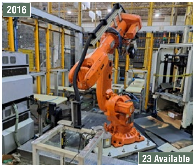
ABB 6 Axis Robots, New As 2016