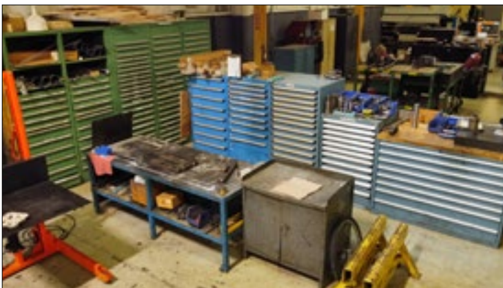
View of assorted cabinets and contents