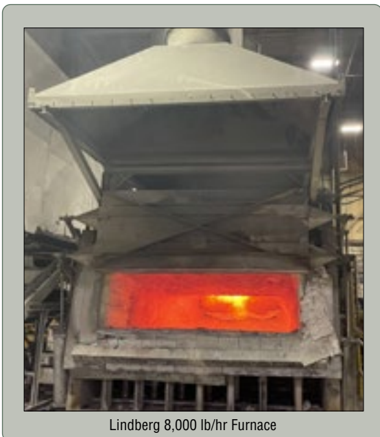
Lindberg 8,000 lb/hr Furnace