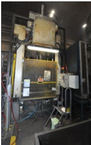
50 Ton Trim Press