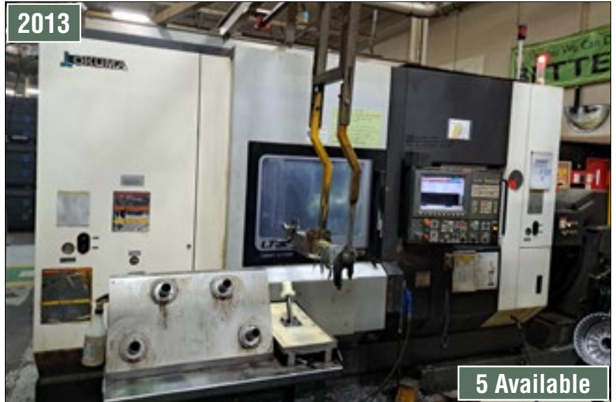
2013 Okuma LT 3000 EX