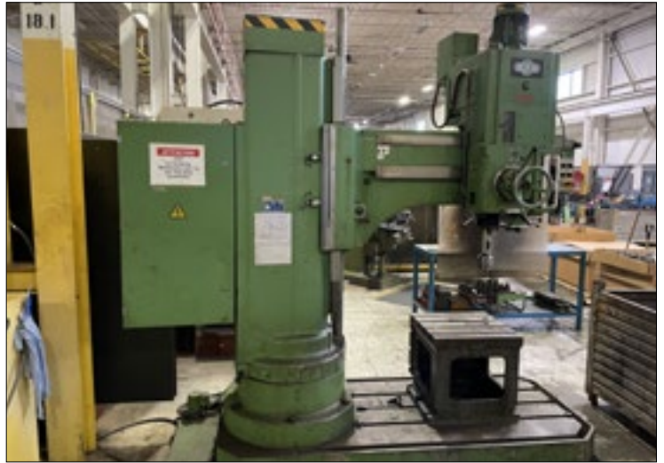
MAS V050 HD Radial Drill