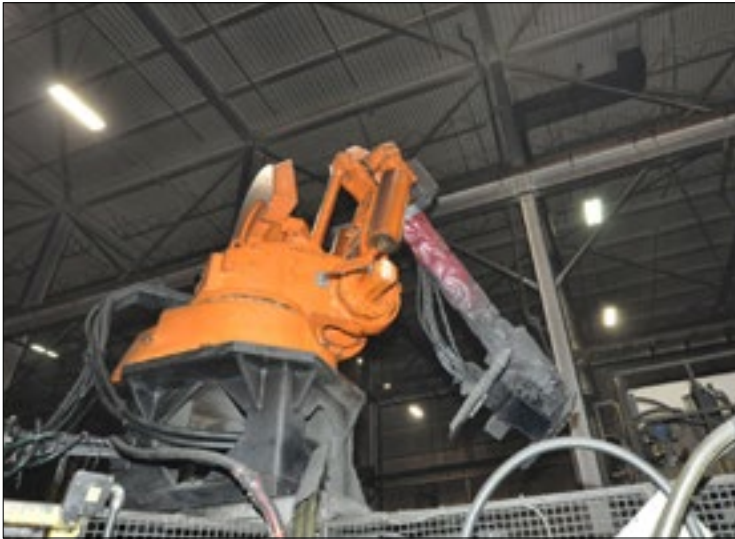
ABB RB 6400S Robot Die Spray System