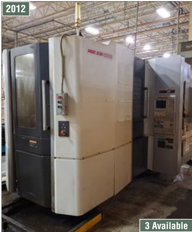
Mori Seiki NHX 5000