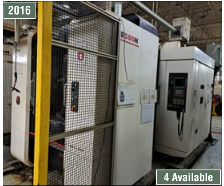
Enshu GE 580H