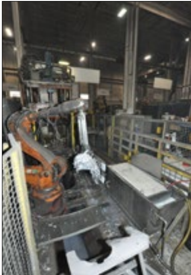
ABB IRB Six Axis Robot Parts Extractor