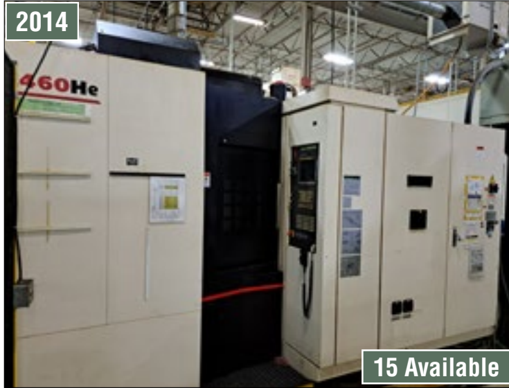
Enshu GE 460H