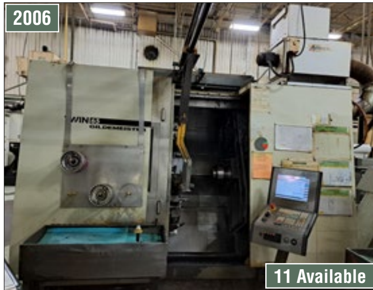
DMG Twin 65