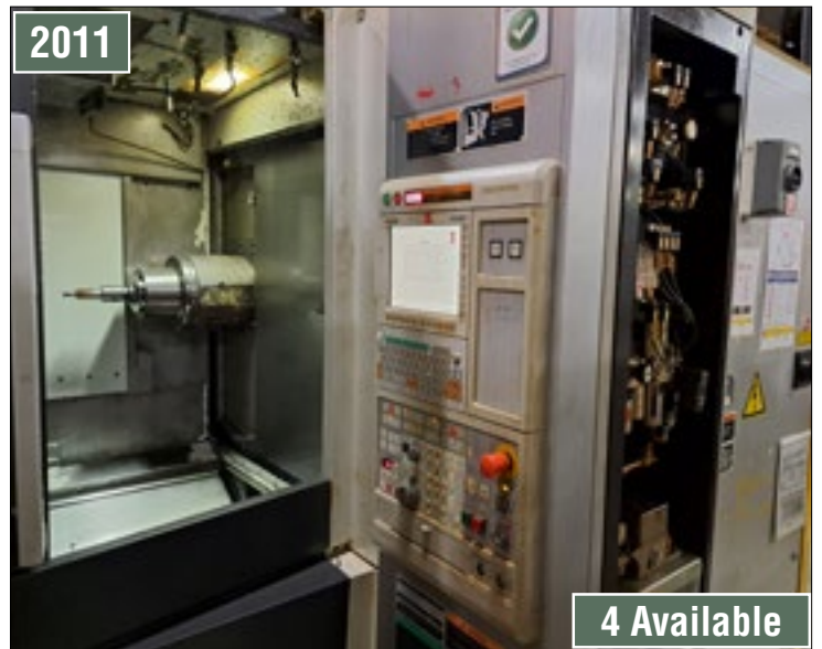
Mori Seiki NHX 4000