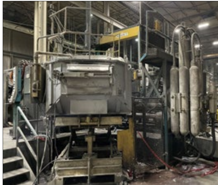
Striko Westoffen W1700S ProDos Electric Heated Aluminum Dosing Furnace