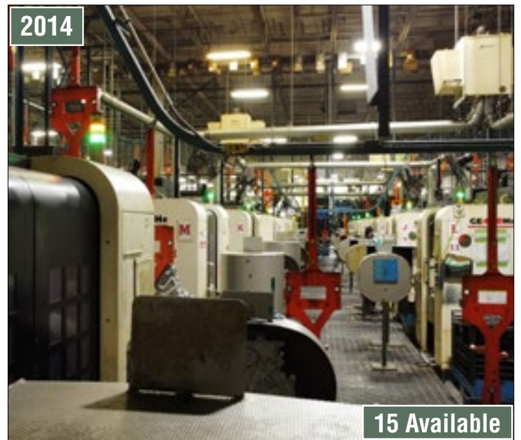
2014 Enshu GE 460H Horizontal CNC Machining Centers