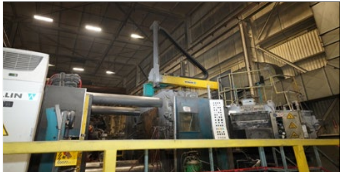
2,200 Ton Complete Buhler Die Casting Cells