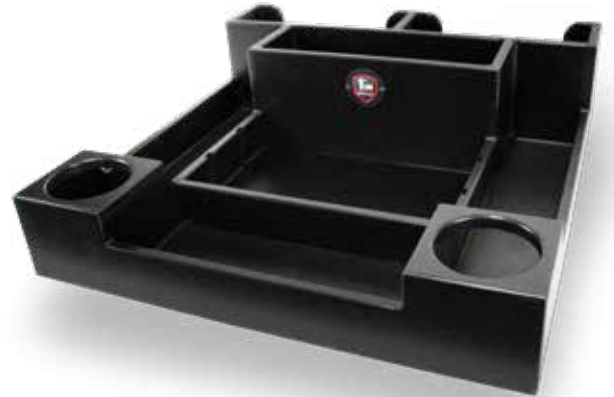
DOG HOUSE ORGANIZER / DHO-1

Products in our line: Dog House Organizer, Glove Holders, Motorola Impress 2 Holder, License Plate Brackets, Hydra Ram Mounts and more!