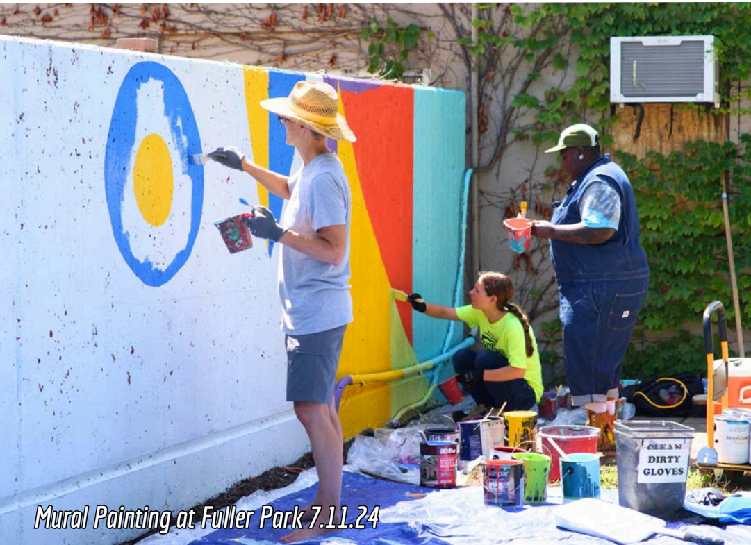
Mural Painting at Fuller Park 7.11.24