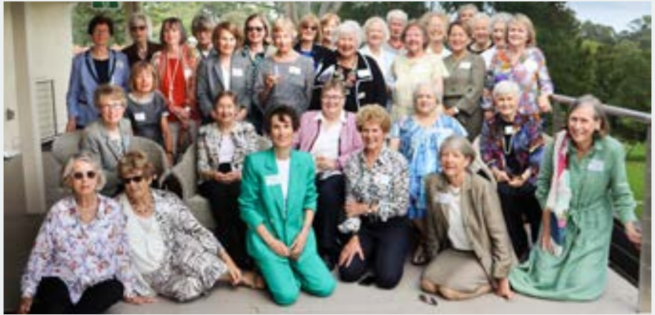
1960 Leavers' 60 Year Reunion

Both events were subsidised by the AOGU.