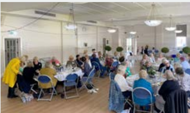
1962 Leavers' 60 Year Reunion