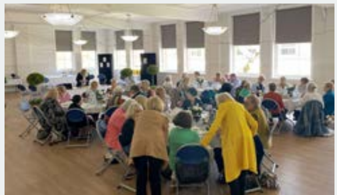
1962 Leavers' 60 Year Reunion