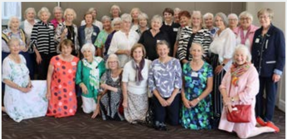
1961 Leavers' 60 Year Reunion