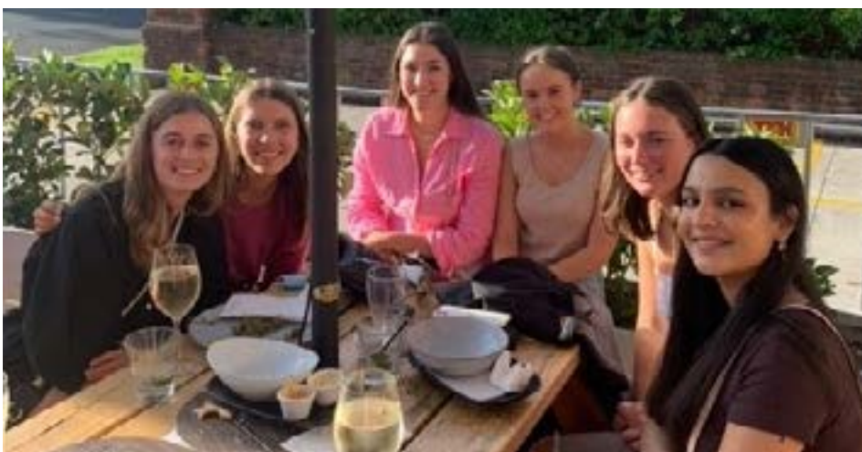
The 2020 Leavers enjoyed a sunny afternoon catching-up