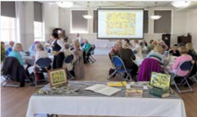
1962 Leavers' 60 Year Reunion