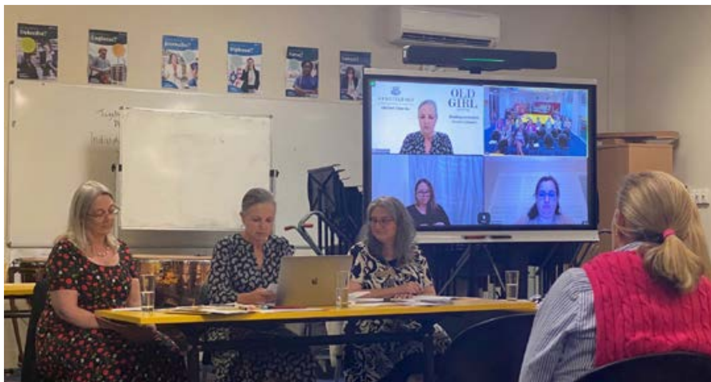
The 2022 AGM was in full swing as both an in-person and Zoom event, meaning that attendees from regional NSW, Tasmania and even those in Sydney stuck at work or not feeling 100% could attend.