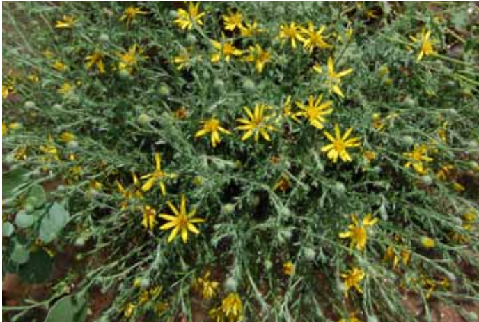
Slender Goldenweed, Xanthisma gracile