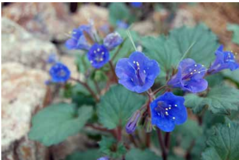
Desert Bluebells, Phacelia campanularia