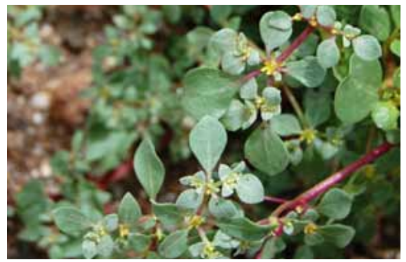
Woolly Honeysweet, Tidestromia lanuginosa