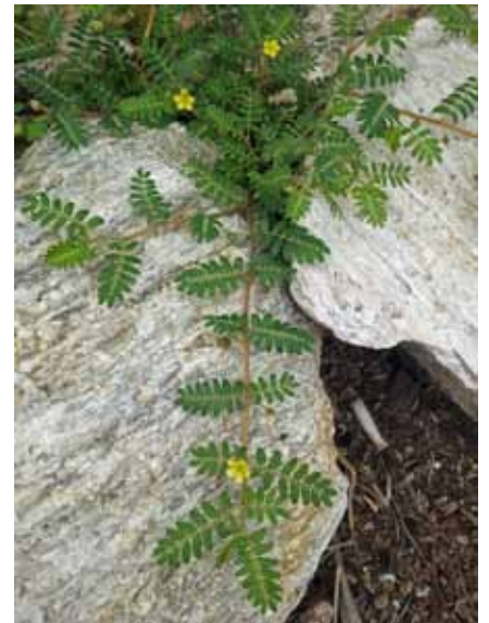
Goat head, Tribulus terrestris (Note: This is native but is a nuisance in human use areas. Be proactive and pull these before seeds form. They are sharp!)