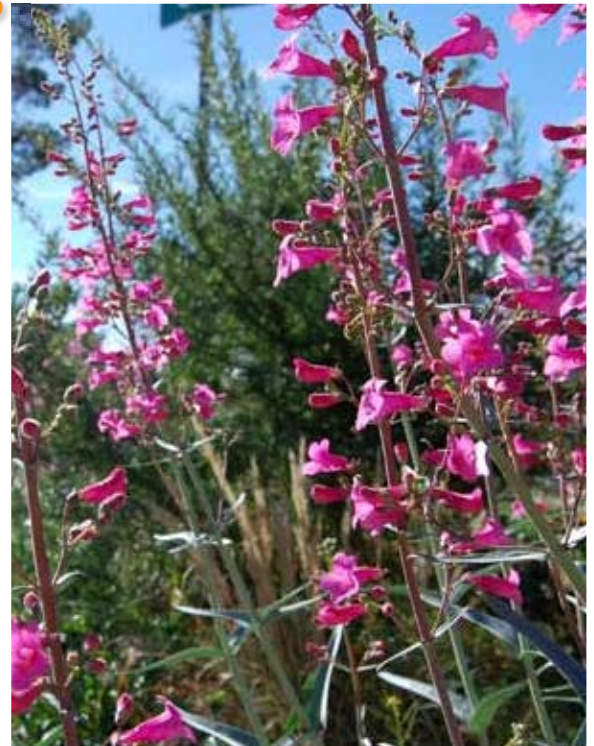
Parry Penstemon, Penstemon parryi