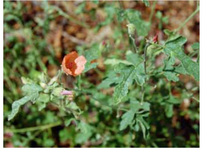
Globe Mallow, Sphaeralcea emoryi