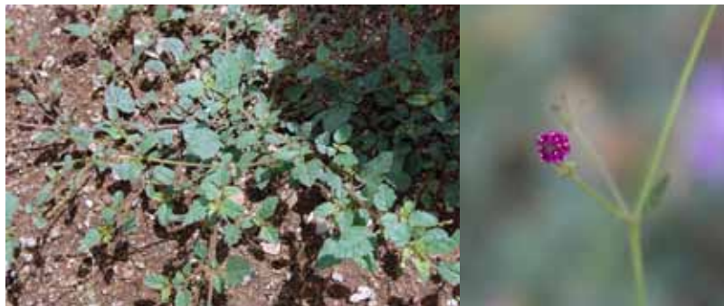
Scarlet Spiderling, Boerhavia coccinea