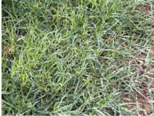
Bermuda grass, Cynodon dactylon (Note: Tricky to remove. You will need to be diligent to remove Bermuda grass manually. Dig out full root system—up to 1.5 ft deep.)