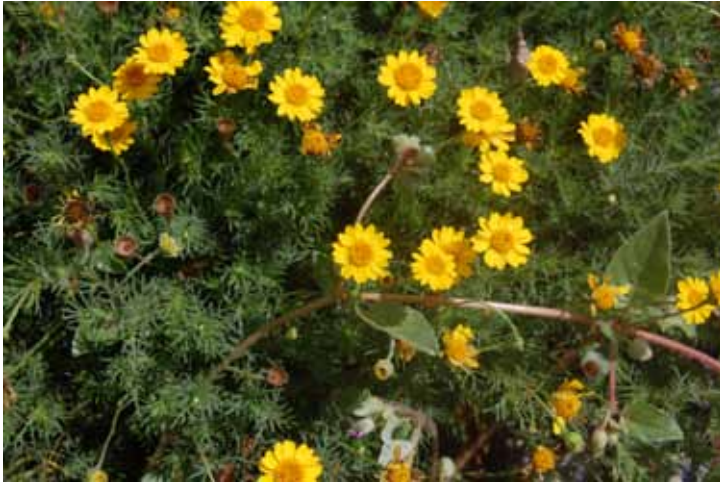
Dogweed, Thymophylla pentachaeta