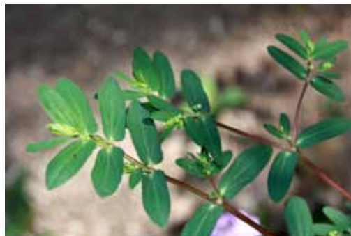
Hyssop leaf Broomspurge, Euphorbia hyssopifolia