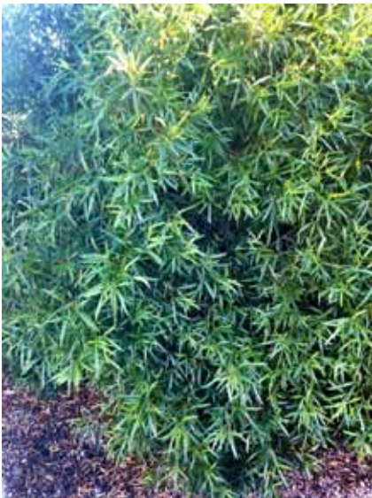
African Sumac, Rhus lancea (Note: This tree spreads prolifically.)