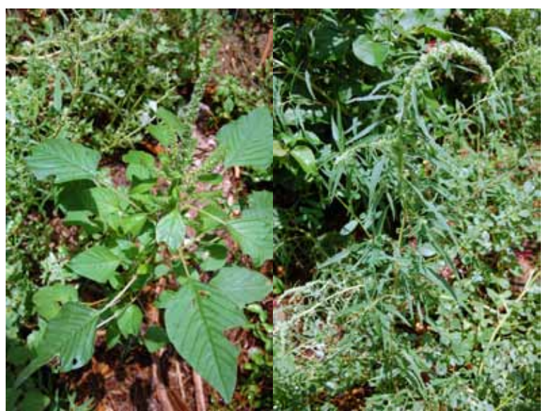
Amaranth or Pigsweed, Amaranthus palmeri (Note: leaves and seeds edible)