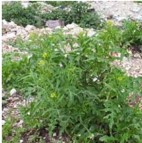
London Rocket, Sisymbrium irio (a mustard)