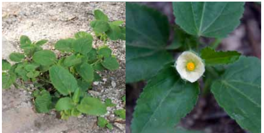
Bladdermallow, Herissantia crispata