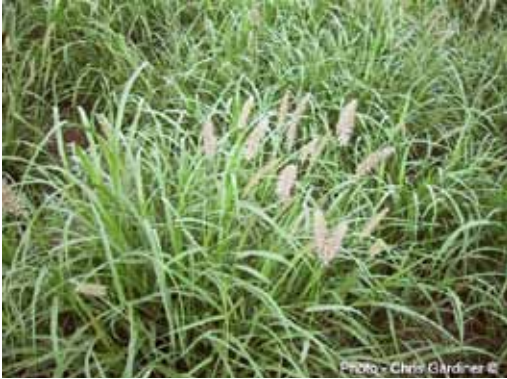
Buffel grass, Cenchrus ciliaris (Note: This plant is a fire hazard. Make sure you carefully identify buffel grass. Don't make the mistake of removing native bunch grasses, which look similar to buffel grass, and are often used in rain gardens. Learn more at buffelgrass.org .)

It's best to remove the whole plant and remove them before they seed to reduce spreading.