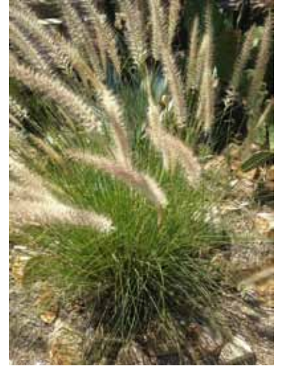
Fountain Grass, Pennisetum setaceum