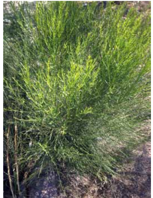
Desert Broom, Baccharis sarothroides