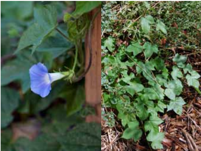
Ivyleaf Morning Glory, Ipomoea hederacea (Note: this vine grows aggressively with extra rain, so you may need to trim it back or remove from plants)

Special thanks to Monsoon Squad members, lylea Olson and Jill Lorenzini, for helping develop this guide through contributing photos and sharing their plant expertise.