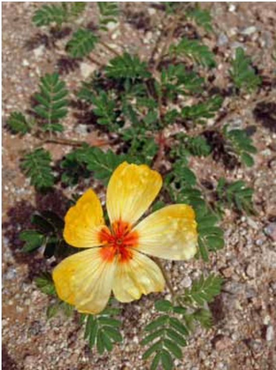
Arizona Caltrop, Kallstroemia grandiflora (Note: looks similar to goats head, so ID carefully)