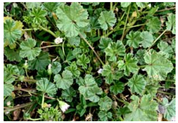
Common Mallow, Malva neglecta