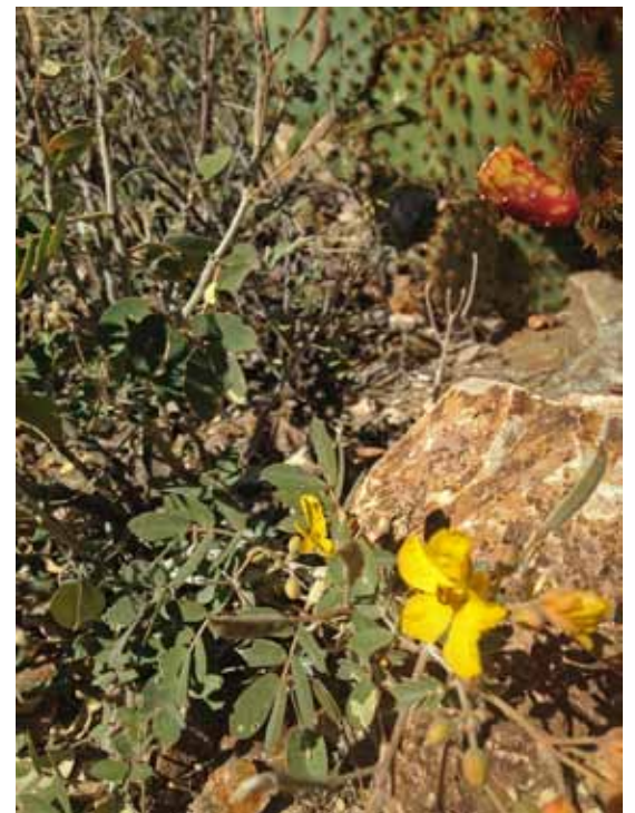
Desert Senna, Senna covesii