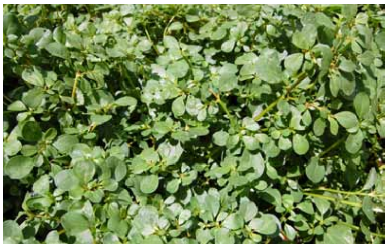
Purslane or Verdologoas, Trianthema portulacastrum (Note: This plant is edible and great for salads, smoothies, and stir-fry.)