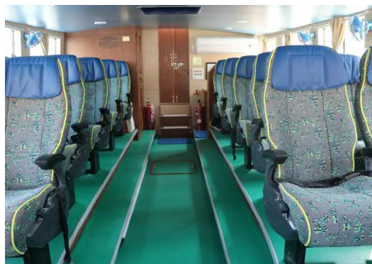
Luxury AC Cabin