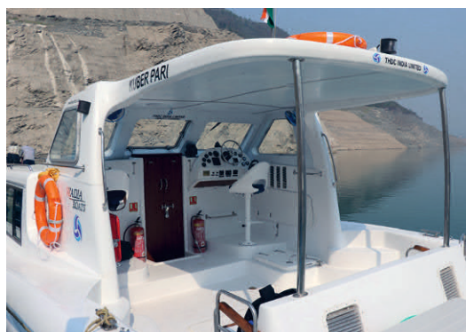
Exterior Aft Seating Space