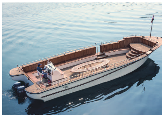
Customized Interior Arrangement