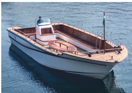
Center Console Open Boat