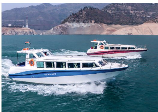
Ideal for Fast Ferry