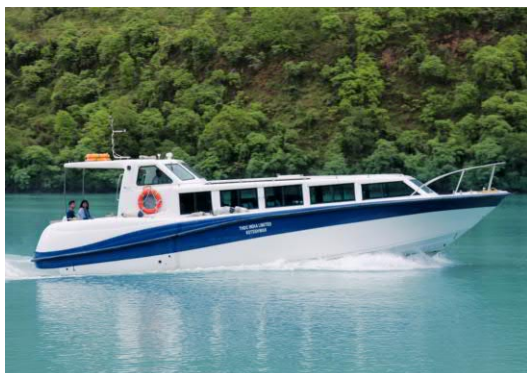
Speed With Safety

A. H. Wadia Boat Builders excels in crafting proven passenger boats, meticulously tailored for ferry and pleasure applications. Whether in FRP or Steel, Aluminum construction, each vessel is uniquely customized to deliver optimal performance, safety, and comfort. Wadia's commitment to quality ensures unparalleled operational economy for government, ports, and private ventures.