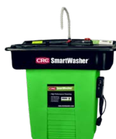
SW-28 SuperSink Parts Washer