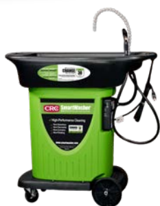
SW-23 Mobile Parts/Brake Washer