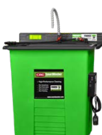
SW-25 Signature Parts Washer