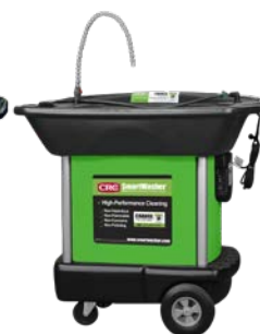
SW-37 Mobile Heavyweight Parts Washer