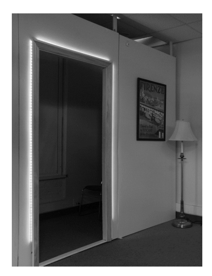
Figure 2. Amber LED lights to outline the bathroom door.

There are times when it may be appropriate to limit access to unsafe items. What needs to be secured, and when and how, can be very individualized, and care should be taken not to assume that because someone has a diagnosis of dementia they are immediately incapable of using