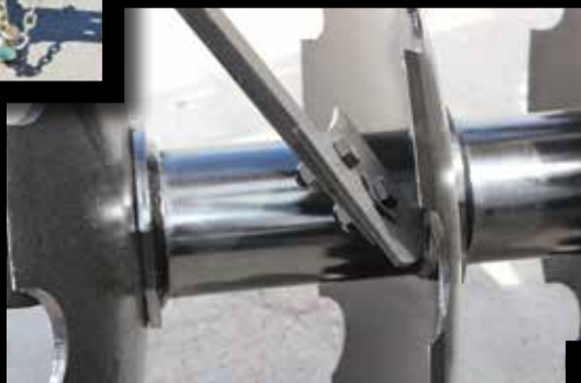
Above: Steel bearing spacer will not break or dent. The replaceable 3/16" x 6 1/2" x 8" high-carbon steel scrapers free blades of soil buildup.