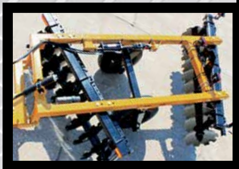
Above: Adjustable gang angle (17 to 23 degrees) on front and rear gangs to adapt to any soil condition.