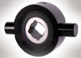
Maintenance-Free Gang Bearings