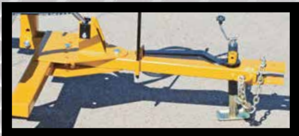
Above: Five tongue settings enable left and right offset positions.

PRODUCT PERFORMANCE GUARANTEE—Repair, Replace, or Refund: AMCO Guarantees Performance. The best tillage tools deserve the best guarantee. The AMCO guarantee is simple. If, during the first 30 days, your AMCO equipment doesn't perform as promised, and if we don't make it perform in a reasonable amount of time, we'll repair it, replace it, or buy it back.