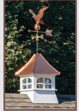
21" Window Cupola with Eagle Weather Vane