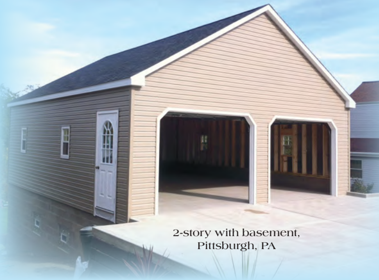
2-story with basement, Pittsburgh, PA