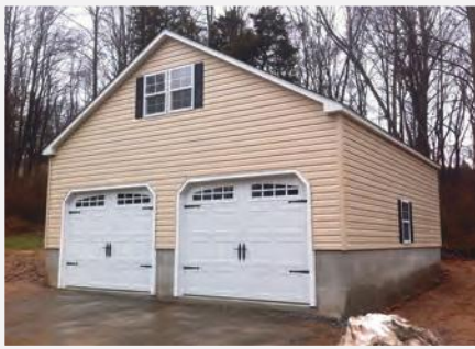
24'x24' with partial cement block wall