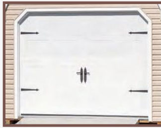
Solid Homestead Door