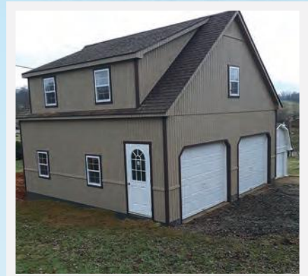
2-story with shed dormers in Virginia