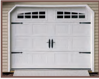
Homestead Door with Sommerton Windows Heavier than a standard garage door