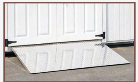
4'8" Aluminum Ramp