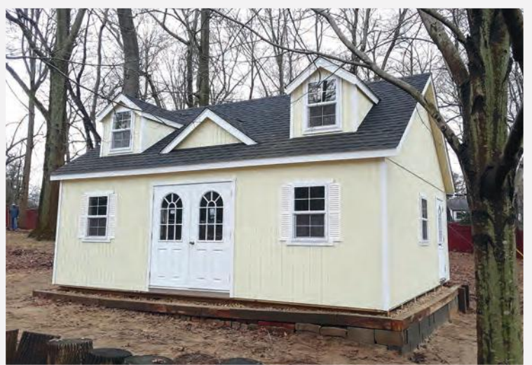
20'x24' with A-frame dormers Glen Cove, NY