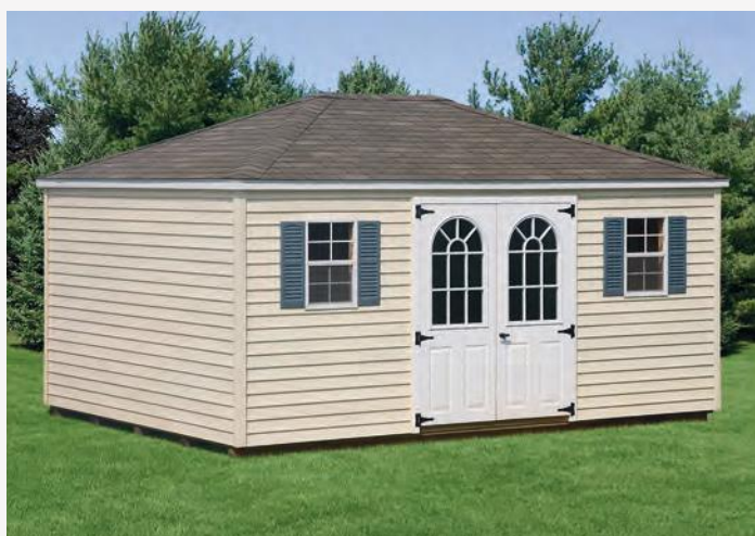
Shown in cream vinyl with white trim, weathered gray roof, optional 5' wide 11-lite fiberglass doors and 2 additional 18"x27" windows with blue shutters.