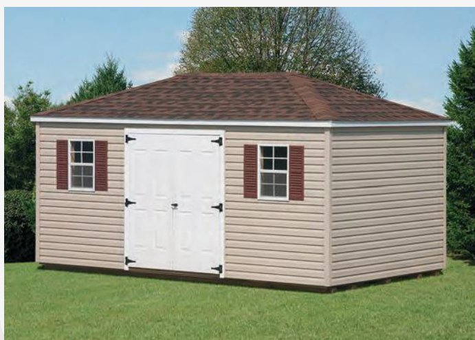
Shown in tan vinyl siding with white trim, brown architectural roof, optional 5' wide fiberglass doors, and 2 additional 18"x27" windows with red shutters.