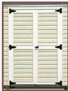
4 1/2' Wide Vinyl Sided Double Doors