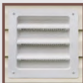
8"x8" Vinyl Siding Gable Vent