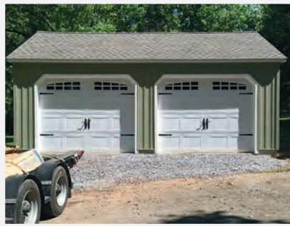
24'x24' custom olive board & batten siding