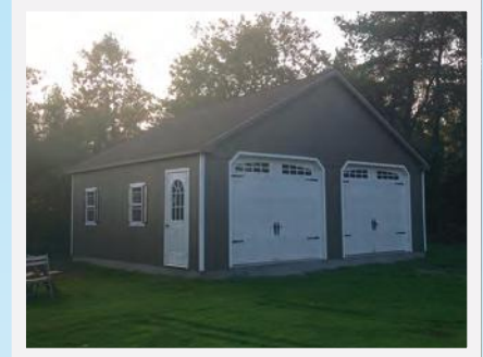
28'x36' 1-story - Glen Falls, NY