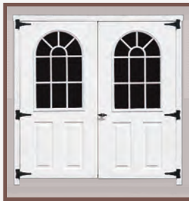
5' Wide Fiberglass Double Doors with 11-Lite Arched Windows