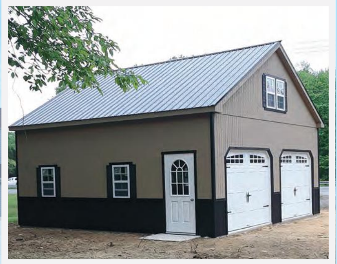
24'x24' 2-story in NE MD