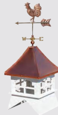
21" Window Cupola with Rooster Weather Vane