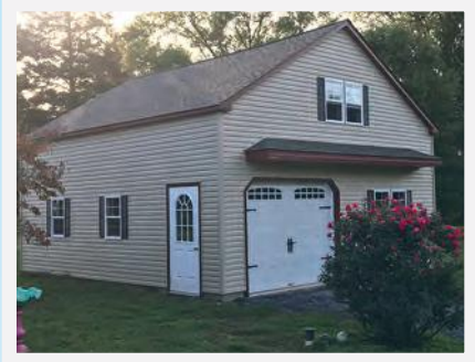
12' wall 2-story with pent roof