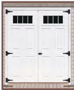
5' Wide Fiberglass Double Door with Transom Windows