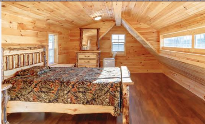
Finished tongue and groove garage upstairs interior