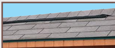
Ridge Vent Assures maximum life for your shingles by letting the heat escape