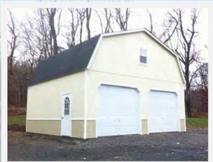
2-story gambrel roof