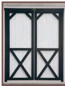
4 1/2' Wide Wooden Shed Doors with Vinyl Trim