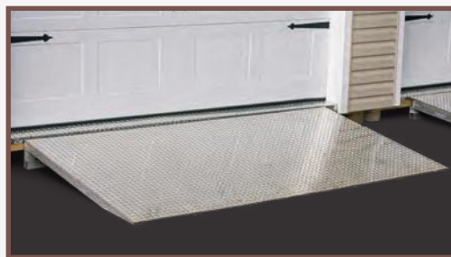
8' Diamond Plate Aluminum Ramp