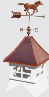
21" Window Cupola with Stallion Weather Vane