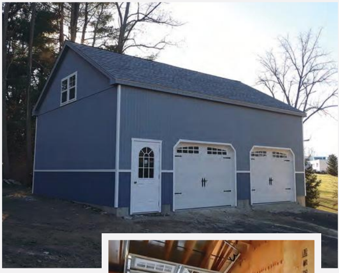
24'x30' with car-lift area in 1 bay & 16'x24' room upstairs, 12' side walls