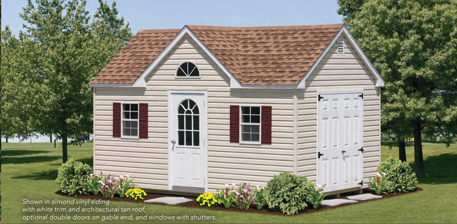
Shown in almond vinyl siding with white trim and architectural tan roof, optional double doors on gable end, and windows with shutters.