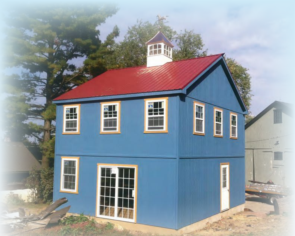
20'x24' 2-story with 16' walls - Lancaster, PA