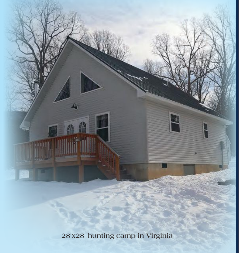
28'x28' hunting camp in Virginia