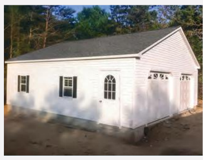
1-story - Mashpee, MA