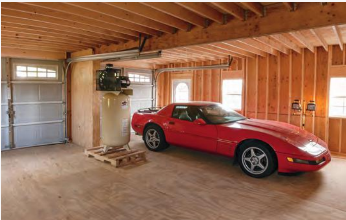
A 24'x24' 2-story garage in use

A built-on-site 2-story garage gives you endless opportunities with a spacious upstairs room up to 28'x48'. Check with local codes for a concrete foundation, or ask us for help in the permit process. We have step-by-step instructions.