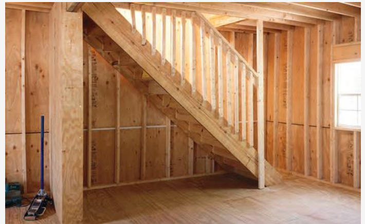
2-stories feature a full staircase with railings