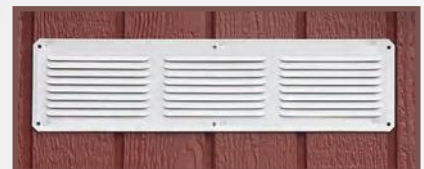
4"x16" Duratemp Siding Gable Vent