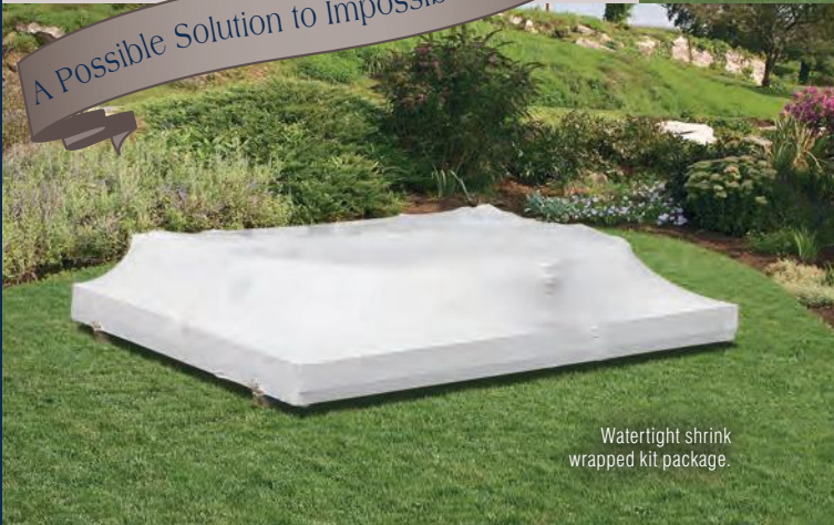
Watertight shrink wrapped kit package.

A Possible Solution to Impossible Access!