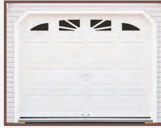
Door with Sunburst Window