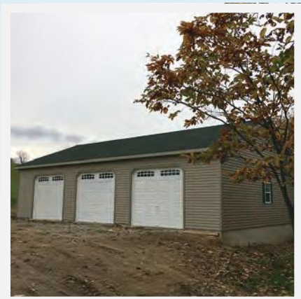
28'x48' with 3, 9' garage doors on the eave wall