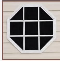
18" Octagon Window