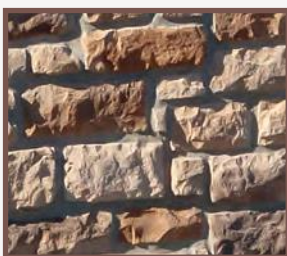
Real Manufactured Stone