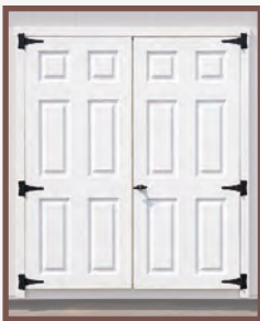
5' Wide Raised Panel Fiberglass Double Doors