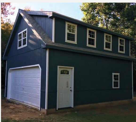
20'x24' 1-16' door and 1 shed dormer with upstairs Moorestown, NJ