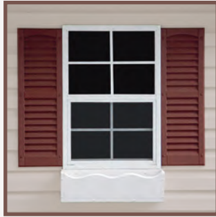
18"x27" or 24"x36" Slider Window with Screens