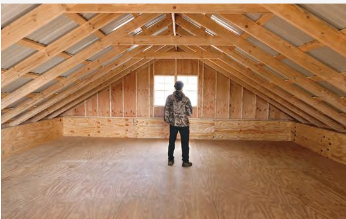
Wide open space on second floor