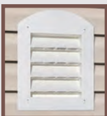
New England Vent