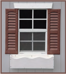
14"x21" Slider Window with Screens