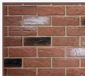
Vinyl Brick Front Available on any building