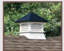
18" Shed Cupola