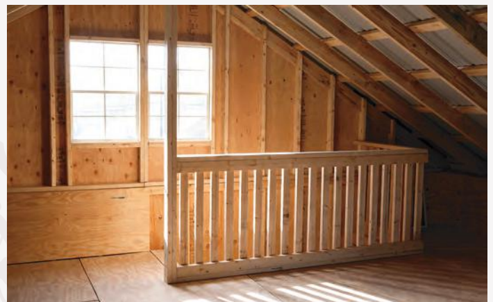
2 nd floor railings around stairwell