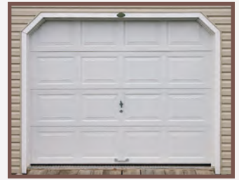
Standard Solid Overhead Door