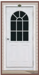
11-Lite Steel House Door Standard on all garages