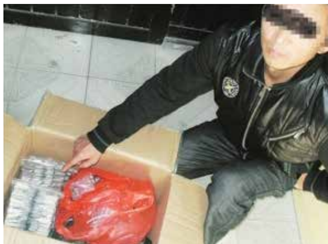
Criminal suspect identifies the poison darts.

On Nov.15, 2013, special investigation team policemen rushed into this den, finding that the house was a hive of activity, pools were all over the yard, on the pools there piled up dogs whose hairs had been all pluck out, a hair removal machine was running, the ground was stained with blood, and the smell was nauseating.