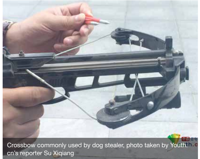
Crossbow commonly used by dog stealer