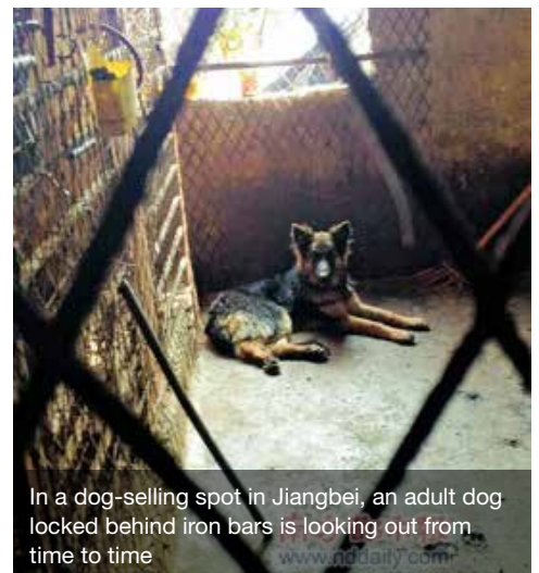
In a dog-selling spot in Jiangbei, an adult dog locked behind iron bars is looking out from time to time

That day, 4 men riding two motorcycles came to Hanchang Flowers& Trees Garden, Weibu Village, Qiuchang Town, Huiyang District, and one man shot a dog with a dart. When the owner found this, the man shot a dart at the owner and robbed him of the shot dog to his face – the whole process lasted less than 3min.