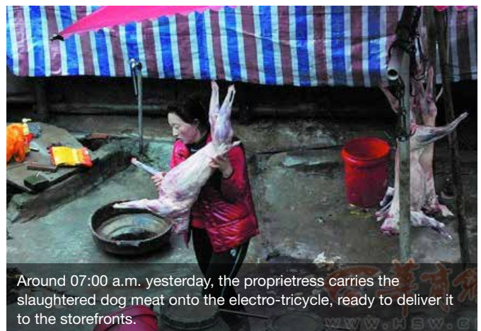
Around 07:00 a.m. yesterday, the proprietress carries the slaughtered dog meat onto the electro-tricycle, ready to deliver it to the storefronts.

20 minutes later, posing as a consumer, the reporter entered the shop. "How much is the mutton?" asked the reporter. "16 yuan," the dog-slaughtering proprietress said, "the sheep was slaughtered in the morning, very fresh." "Why is the sheep so little?" asked the reporter, pointing at the dog meat on the counter. The proprietress explained, "This is local sheep, small, and easy to sell." In the end, the reporter bought "mutton" at the price of 14 yuan /500g.