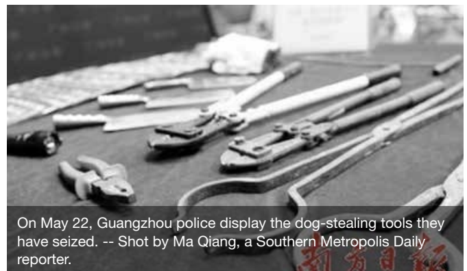
On May 22, Guangzhou police display the dog-stealing tools they have seized.