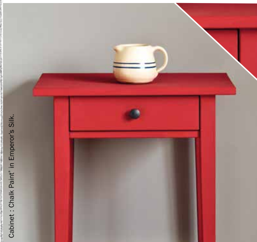
Cabinet : Chalk Paint® in Emperor's Silk.

Tip To remove excess coloured wax, use a little Clear Chalk Paint® Wax on a lint-free cloth and rub away.