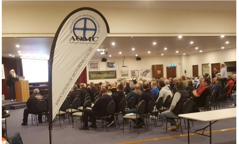
Above: The audience at the seminar

BOI offer advice and servicing, conversions, evaluations and restoration work. They are agents for Weber carburettors.