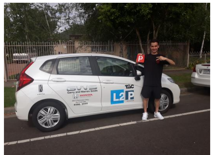
Right: One of the many successful L2P graduates, proudly displaying his P plates.