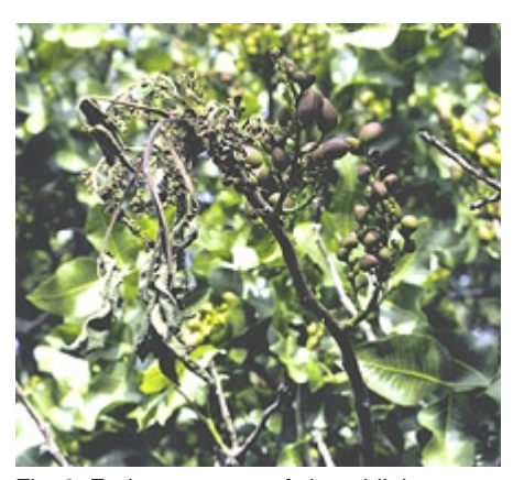
Fig. 2. Early symptoms of shoot blight caused by Botryosphaeria dothidea .

Under California climatic conditions pistachio, which is a dioecious plant, typically breaks dormancy in early April. When buds are infected by B. dothidea , they either will not emerge (total blight) or emerge but the resulting flower or shoot eventually dies. Symptoms appear as dark lesions, usually at the base of shoots, rachises, and mid ribs of leaves. Shoots originating from heavily infested or partially killed buds expand to a short length, become black, and die (Fig. 2). In mid-May, leaves on infected shoots wither in 3 to 5 days, and later on brown blighted shoots and leaves become distinct among the healthy dark green foliage (Fig. 3). Infected flower buds lead to blighted inflorescences (Fig. 4). Rachis infections occur at the base or at branching points. Infected tissues turn black, and the rachis collapses. Depending upon the location of the lesion, these infections also can lead to the collapse of the clusters, with fruit adhering to them.