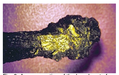
Fig. 9. A cross section of the basal part of a rachis showing characteristic pycnidia of B. dothidea .

Primary and secondary latent infections of leaf blades appear next as small, angular or round, black lesions. Some of these infections enlarge during the summer and become irregular to round brown lesions, up to 25 mm or larger in diameter, with chlorotic margins (Fig. 10). The lesions and halos often coalesce creating blotches of various shapes that ultimately dry to tan. Pycnidia of the fungus may develop in the center of the lesions by mid-August and during September and October.