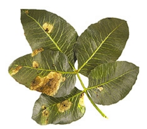
Fig. 10. Lesion caused by B. dothidea on leaves of pistachio.

Primary and secondary latent infections of leaf blades appear next as small, angular or round, black lesions. Some of these infections enlarge during the summer and become irregular to round brown lesions, up to 25 mm or larger in diameter, with chlorotic margins (Fig. 10). The lesions and halos often coalesce creating blotches of various shapes that ultimately dry to tan. Pycnidia of the fungus may develop in the center of the lesions by mid-August and during September and October.