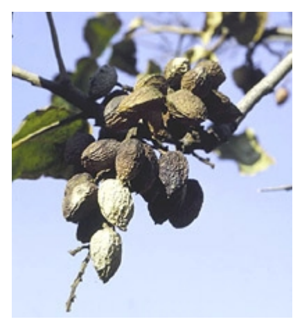
Fig. 11. Blighted pistachio cluster with characteristic nuts of silver color infected by B. dothidea .

Infections on current season shoots develop into cankers. Such cankers have a sunken appearance, develop around the invasion point and can range from 1 to 10 cm in length (Fig. 12). These cankers usually do not enlarge in subsequent years. Botryosphaeria dothidea sporadically causes cankers that are up to 30 cm in length, covered with dark exudate on trunks or extending into a main tree scaffold. The infection is limited to the bark and does not kill branches or entire trees. Some cankers are associated with pruning wounds where the pathogen can produce pycnidia in the proximity of the cut surface.