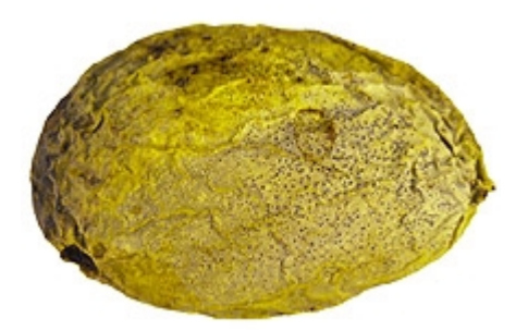
Fig. 8. Pistachio fruit infected by B. dothidea and covered with pycnidia of the fungus (note the peppery appearance).