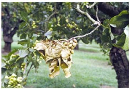
Fig. 3. Shoot blight at a later stage, distinct because of the brown discoloration among the green canopy caused by B. dothidea .