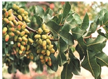
Pistachio is a dioecious plant with fruit drupes born in taxianthies called panicles (clusters).

Department of Plant Pathology University of California, Davis Kearney Agricultural Center 9240 South Riverbend Ave. Parlier, CA 93648