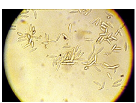
Fig. 14. Pycnidiospores of B. dothidea.

Panicle and shoot blight is caused by Botryosphaeria dothidea (Moug.:Fr.) Ces. & De Not. (synonym B. ribis Gross. & Duggar). The anamorph was initially reported on avocados (5) and almonds (3) as Dothiorella sp., but now it is generally accepted that it is a species of Fusicoccum (22). It produces black, asymmetrical pycnidia that are solitary or arranged in groups of 5 to 8 or more, each with an apical ostiole through which the conidia extrude in a gelatinous matrix. Conidia are hyaline, nonseptate, fusiform, and measure 15\text{-}29 \times 5\text{-}8 \text{ }\mu\text{m} (Fig. 14). Isolates of B. dothidea from pistachio grow well and fast on regular and acidified potato-dextrose agar at 20 - 36^{\circ}\text{C} (optimum 27 - 30^{\circ}\text{C} ). Initially, colonies are white, later changing to mouse gray, then almost black (Fig. 15). Many isolates do not produce pycnidia in culture, and some produce reddish pigments. Only the pycnidial stage has been found on pistachio.