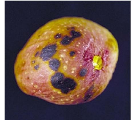
Fig. 7. Developing infection by B. dothidea through a lenticel in a mature pistachio fruit.