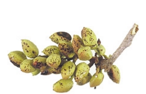
Fig. 6. Fruit infections by B. dothidea associated with lenticels.