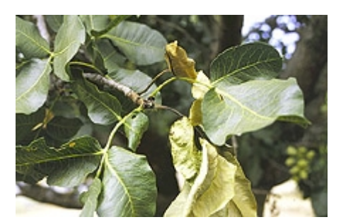
Fig. 5. Mid rib and leaf stem infections by B. dothidea resulting in defoliation.