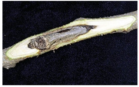
Fig. 12. Sunken canker in a 2 year old shoot of pistachio caused by B. dothidea .

Infections on current season shoots develop into cankers. Such cankers have a sunken appearance, develop around the invasion point and can range from 1 to 10 cm in length (Fig. 12). These cankers usually do not enlarge in subsequent years. Botryosphaeria dothidea sporadically causes cankers that are up to 30 cm in length, covered with dark exudate on trunks or extending into a main tree scaffold. The infection is limited to the bark and does not kill branches or entire trees. Some cankers are associated with pruning wounds where the pathogen can produce pycnidia in the proximity of the cut surface.