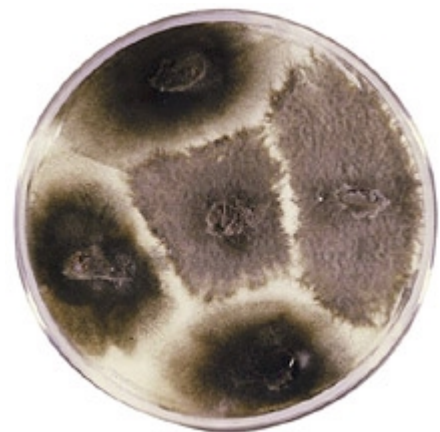
Fig. 15. A Petri plate with two 7-day-old colonies of B. dothidea as contrasted to three colonies of Alternaria alternata isolated from lesions on pistachio leaves.

Identification of the pistachio panicle and shoot blight pathogen as the anamorph of B. dothidea (10) was based on comparisons of morphological and cultural characteristics of several isolates from pistachio with those of B. dothidea isolates that cause band canker of almond in California (3) and with those of isolates of B. dothidea from peach in Georgia (2). However, Smith et al. (22) compared isolates of this pathogen from California pistachio with the type isolates of B. dothidea and B. ribis and found that the pistachio isolates separated as a taxonomic clade between B. dothidea and B. ribis isolates. At the time when Michailides (10) identified the species causing panicle and shoot blight of pistachio, B. dothidea and B. ribis were considered synonymous. Currently, considerable controversy still exists surrounding the taxonomic status of B. dothidea and B. ribis (21). Some authors regard the two species as synonyms, while others treat them as separate taxa (22).