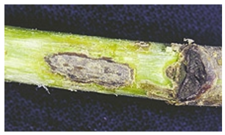
Fig. 18. Lenticel infections by B. dothidea and creation of a small canker on 1-2-year-old shoot of pistachio.

stomata and fruit lenticels. Lenticel infections on 1-year shoots are occasionally observed but they develop only to small (0.5 to 1.0 cm in diameter) lesions, which do not expand any further and do not affect the shoot health (Fig. 18).