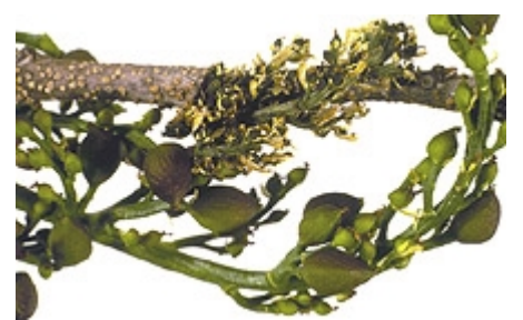
Fig. 4. Blighting of a young panicle caused by Botryosphaeria dothidea .

Early leaflet infections produce somewhat elongated black lesions on the midrib of leaf petioles (Fig. 5). Petiole infections kill individual leaflets, and infected leaves or leaflets drop beginning in July. Most defoliation, however, occurs in late summer and can be severe. Lesions on blades do not usually result in defoliation. When shoot infection occurs and leaves wilt and die, the pathogen can invade the older leaves of the shoot, leading to the development of pycnidia, usually at the basal flattened portion of the petiole. Leaf stem and mid rib infections are very common and usually are the first symptoms to appear during an epidemic of panicle and shoot blight in an orchard.