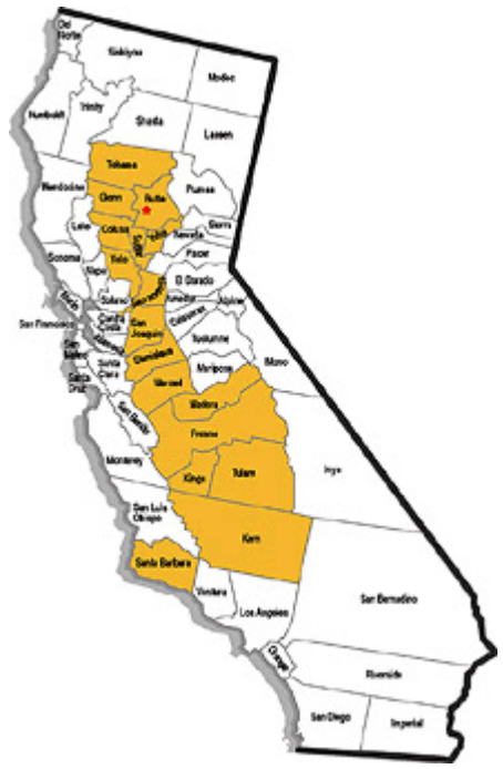
Fig. 1. California map showing areas where pistachios are grown. (*) Asterisk shows the orchards where panicle and shoot blight caused by Botryosphaeria dothidea was discovered first in 1984.

Panicle and shoot blight was first discovered in a commercial orchard in the town of Durham, (Butte Co.) in the northern Sacramento Valley (Fig. 1), in the summer of 1984. Systematic research on the disease started in 1985, along with research on another major problem, epicarp lesion. Researchers working on epicarp lesion first discovered panicle and shoot blight in a 20-acre orchard, presumably the first commercial pistachio orchard established in California, about 16 miles south from the Tree Improvement Center at Chico (TICC) where pistachio was first introduced in California. Between 1985 and 1988 the disease was found in various cultivars grown in the TICC. From 1985 to 1990, research on this disease focused mainly on diagnosis, isolation and identification of the pathogen, Koch's postulates, studies on the epidemiology, and the development of cultural and chemical approaches to manage the disease. It was during this period when the devastating consequences of the disease became apparent. In the orchard where the disease was discovered, as well as a few other orchards in Butte and Tehama Counties, yield losses from 40 to 100% were not uncommon (10).