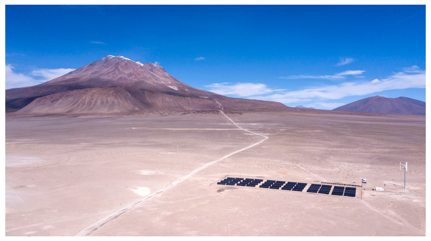
Ollagüe, Chile - CIF@10 View of the solar panels from above. China is making a strong push into renewables (wind, solar, and hydro) in Latin America.

in the context of BRI or BRF. This ample "gray area" of BRI possibilities deserves attention and a case-by-case analysis. Constructive and project-based collaboration with China and other international partners may take place without the BRI label. Alternatively, the BRI denomination alone does not automatically exclude or mitigate potential project risks, warranting careful due diligence and enforcement.