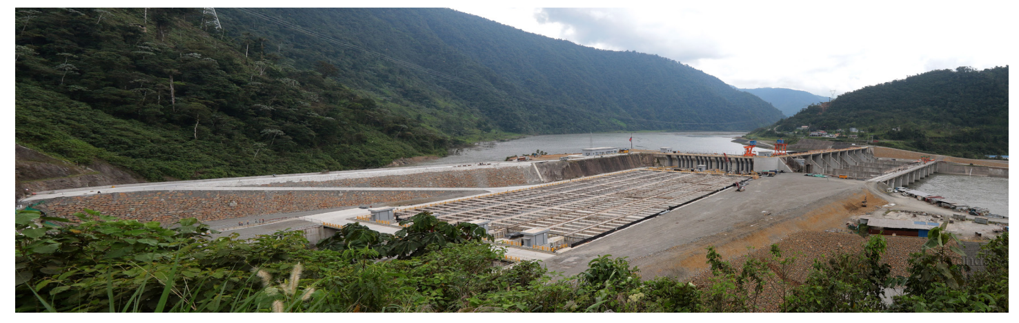
Coca Codo Sinclair - Ecuador's Coca Codo Sinclair dam has raised cost and quality concerns about Chinese-funded projects in Latin America.