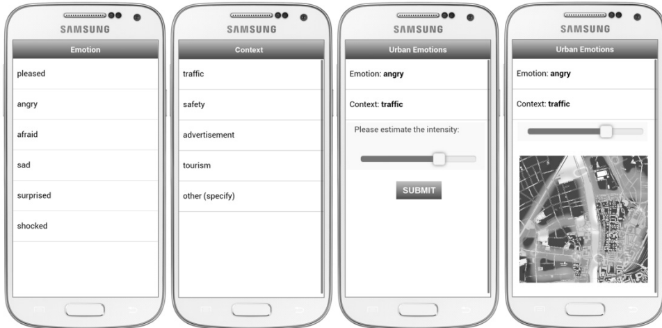
Fig. 2: User Interface of the “People as Sensors” Smartphone App

The guidance through the user interaction dialogue consists of five steps: