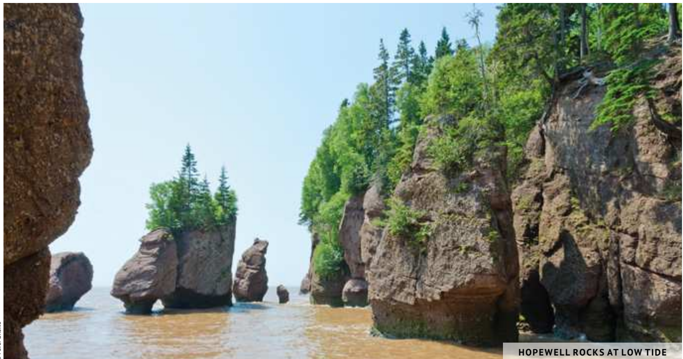
HOPEWELL ROCKS AT LOW TIDE