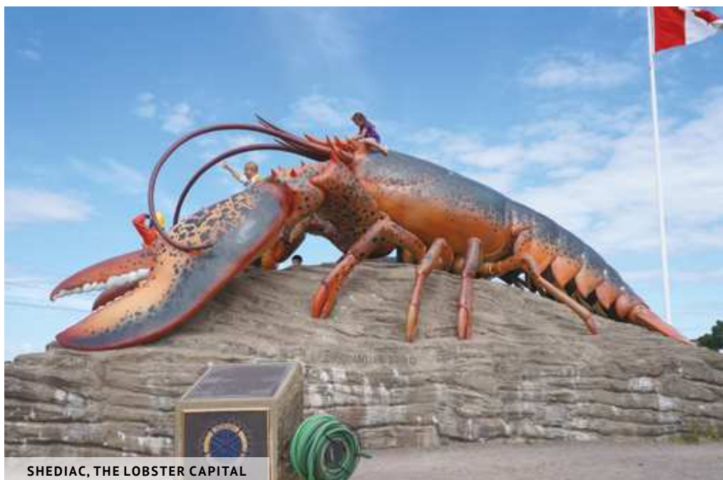
SHEDIAC, THE LOBSTER CAPITAL

and sample the excellent lobster or seafood! Shediac also boasts beautiful beaches where the water is a balmy 24 degrees .