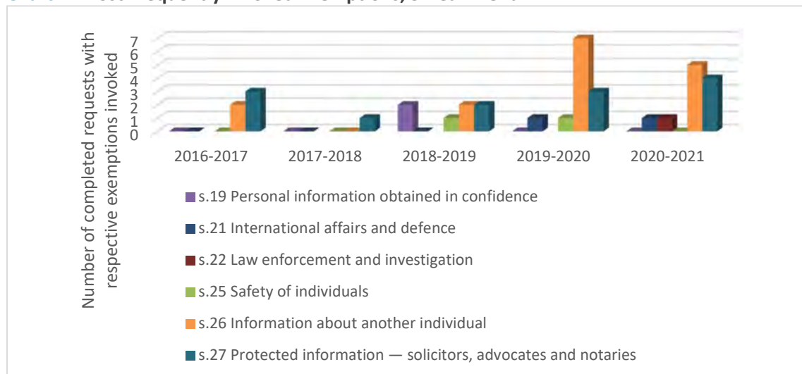
Chart 2: Most Frequently Invoked Exemptions, 5-Year Trend

The exemption provisions invoked during this reporting period include section 26 (information about other individuals) and section 27 (personal information that is subject to solicitor-client privilege).