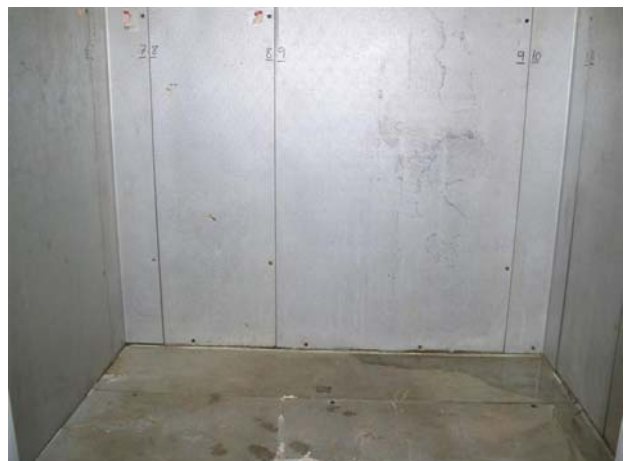
9'8" x 15'5" x 7'7" H Combination Walk-In Cooler/ Walk-In Freezer