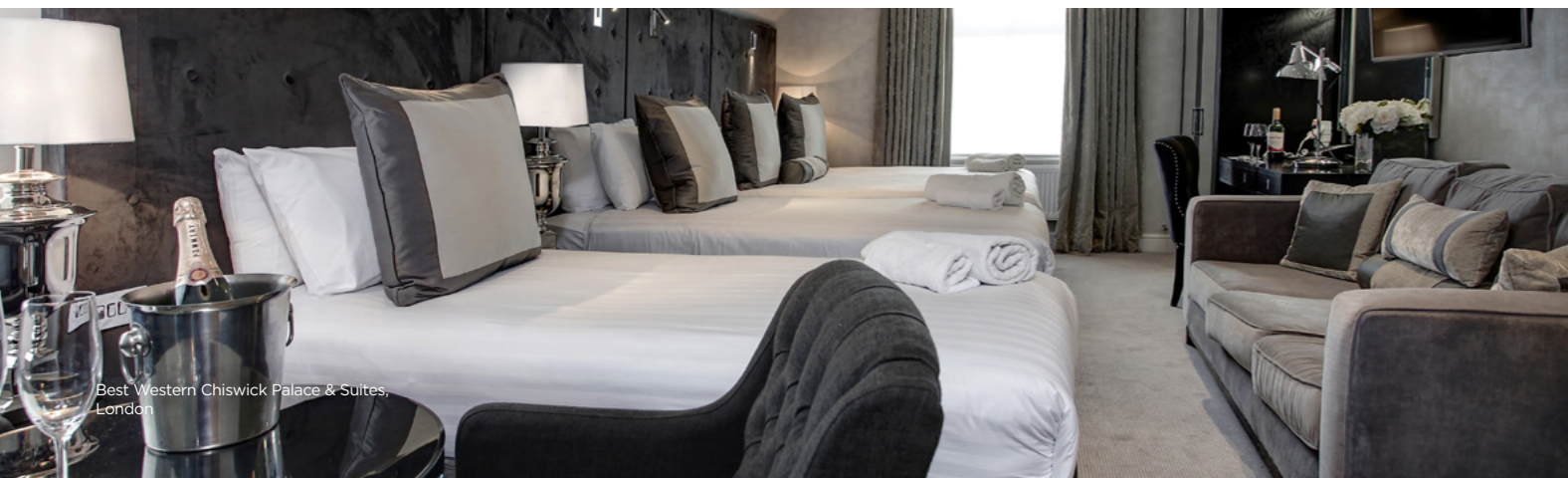
Best Western Chiswick Palace & Suites, London