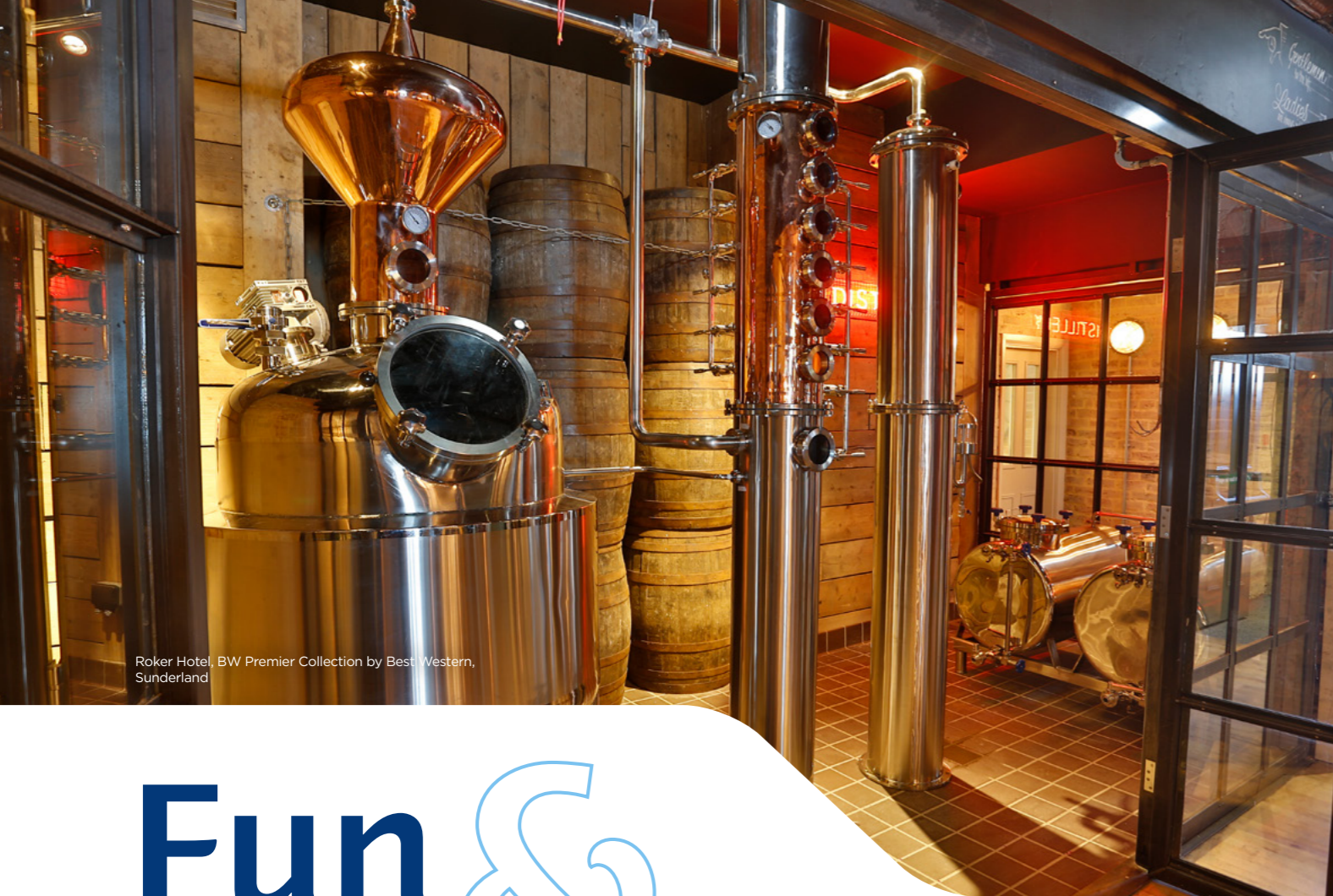
Roker Hotel, BW Premier Collection by Best Western, Sunderland