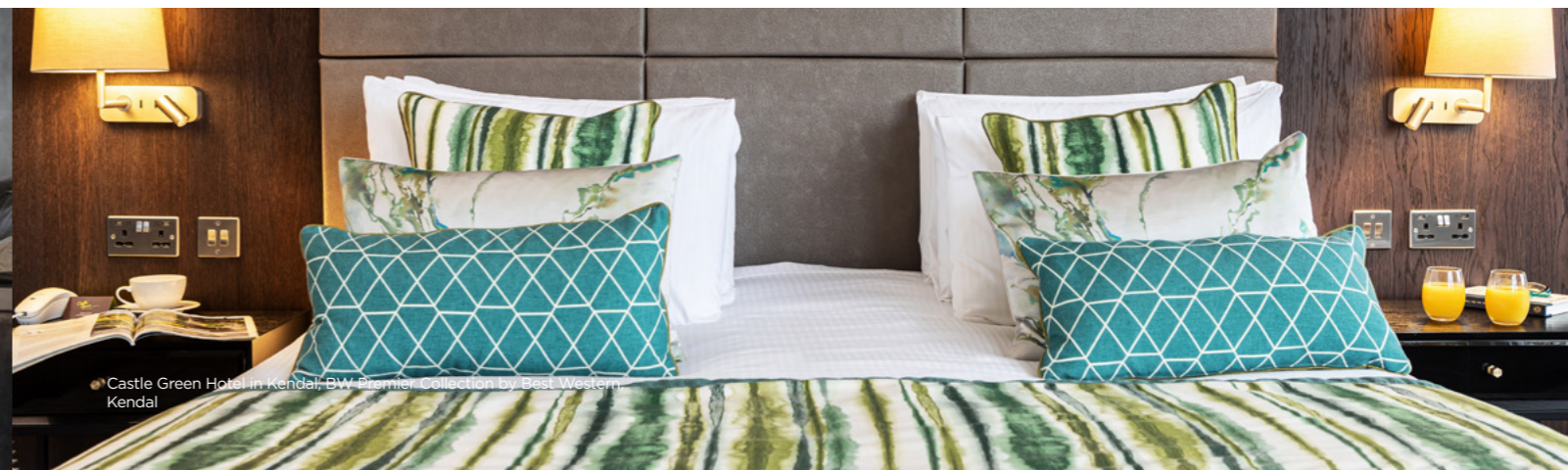
Castle Green Hotel in Kendal, BW Premier Collection by Best Western, Kendal