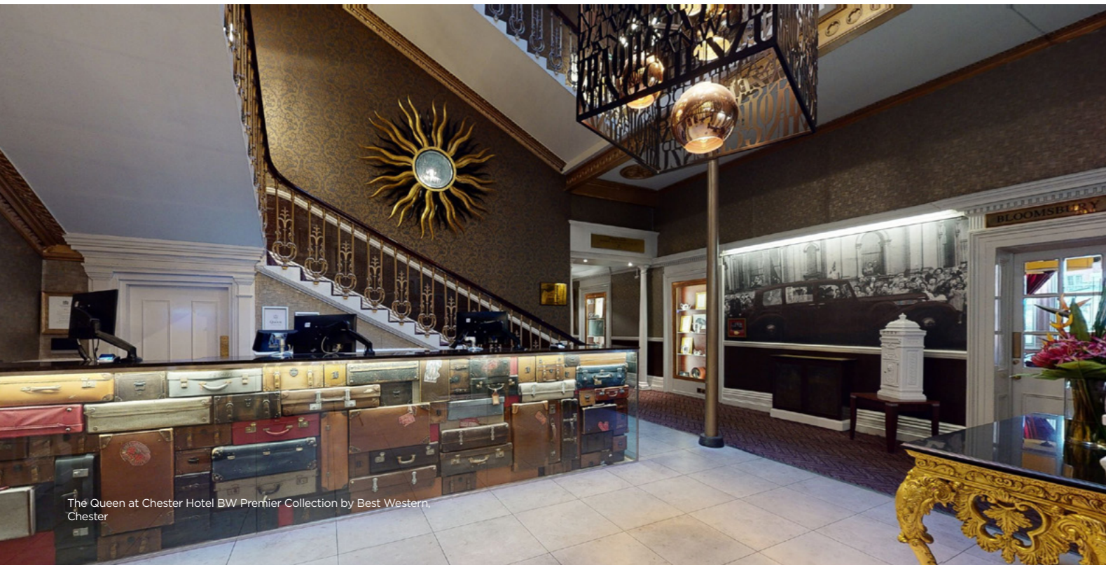
The Queen at Chester Hotel BW Premier Collection by Best Western, Chester