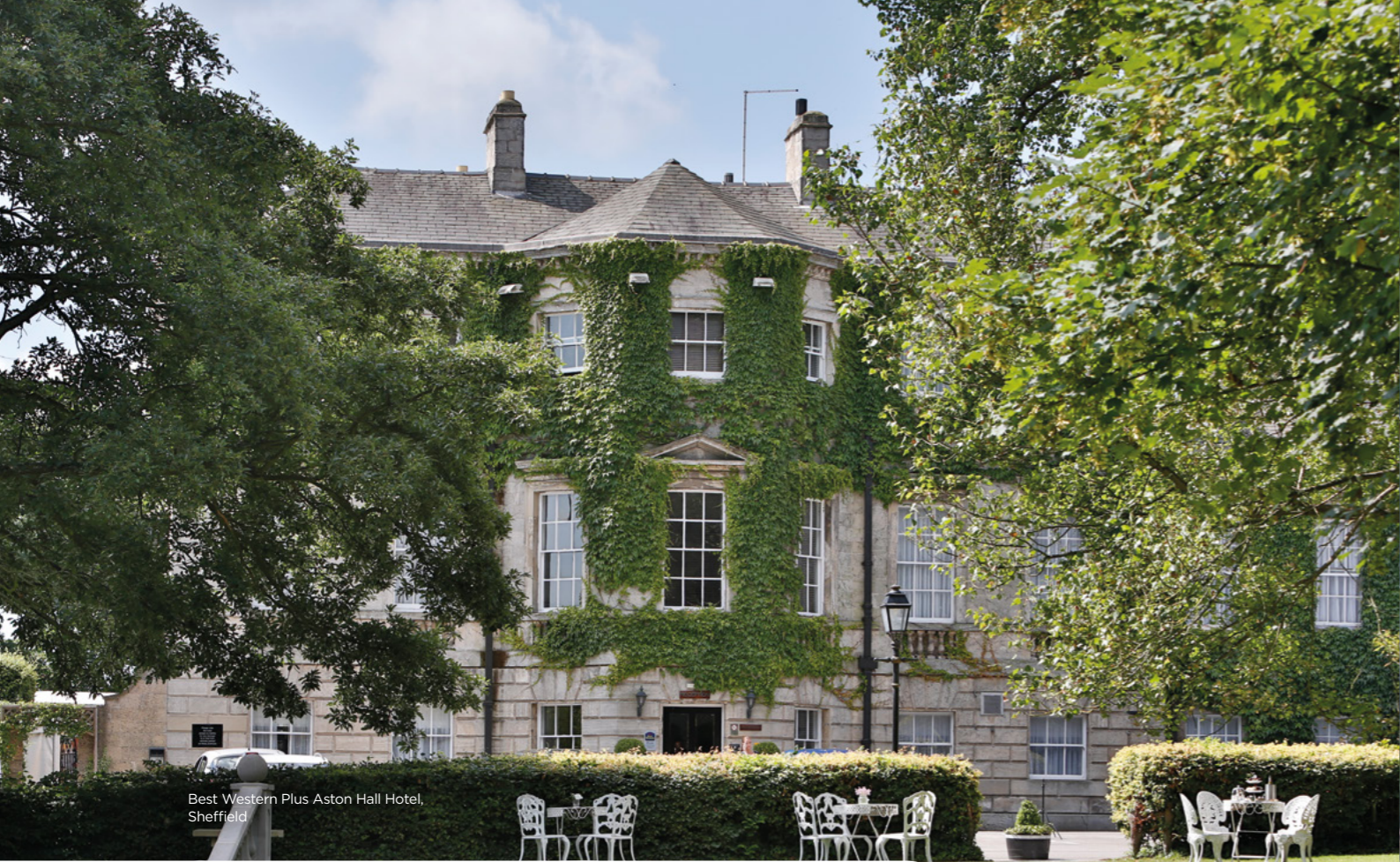
Best Western Plus Aston Hall Hotel, Sheffield