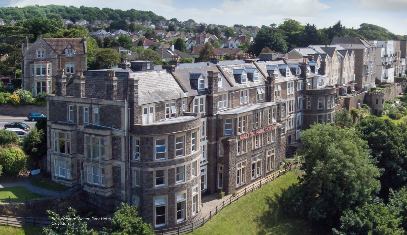
Best Western Walton Park Hotel, Clevedon

Get to know our collections, and find the right hotels for your needs: