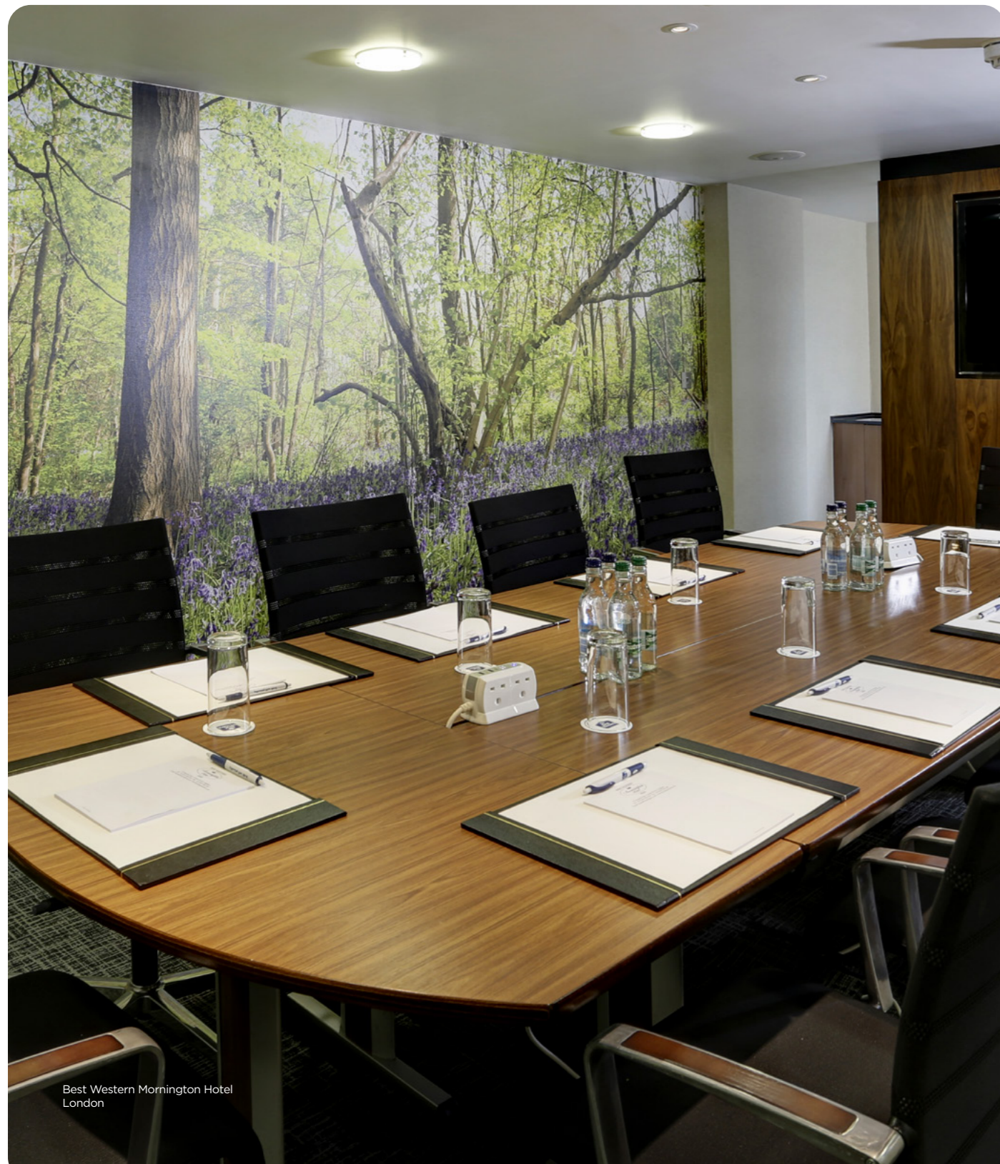
Best Western Mornington Hotel London