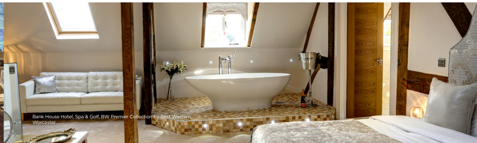
Bank House Hotel, Spa & Golf, BW Premier Collection by Best Western, Worcester