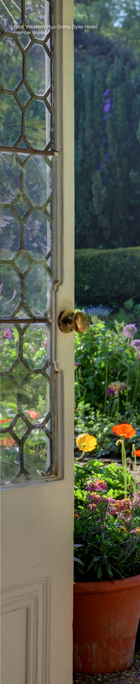
Best Western Plus Grims Dyke Hotel, Harrow Weald