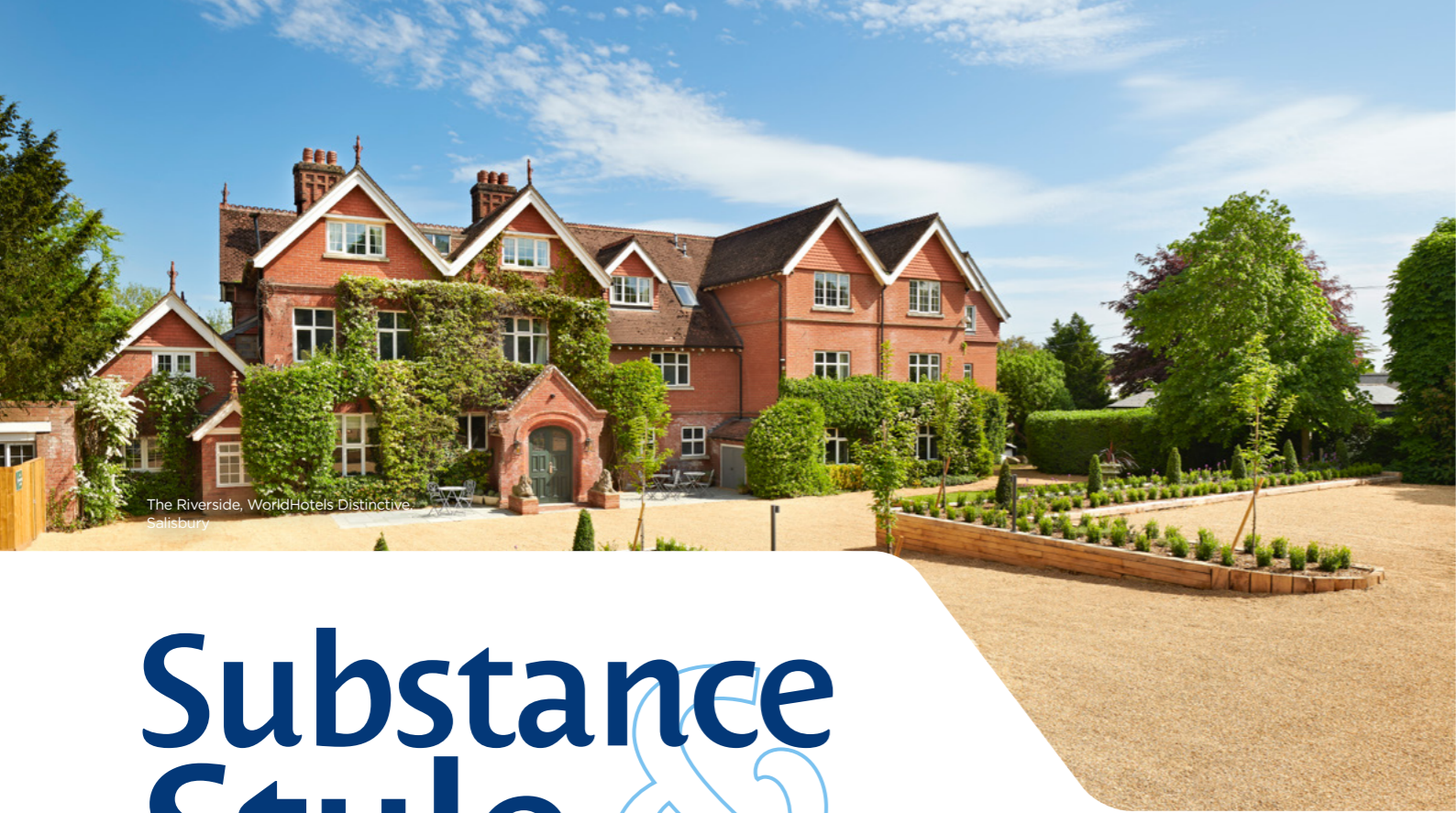
The Riverside, WorldHotels Distinctive, Salisbury