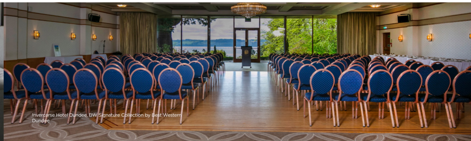
Invercarse Hotel Dundee, BW Signature Collection by Best Western Dundee