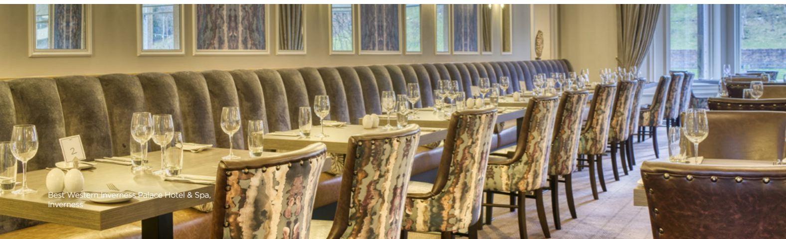
Best Western Inverness Palace Hotel & Spa, Inverness