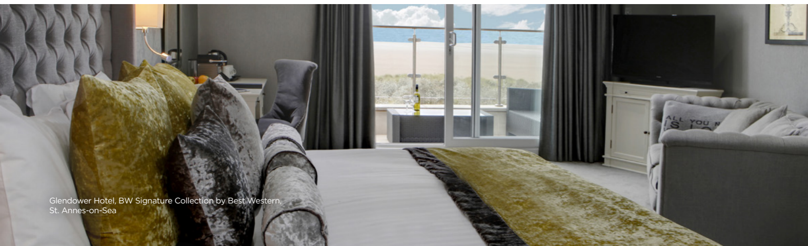
Glendower Hotel, BW Signature Collection by Best Western, St. Annes-on-Sea