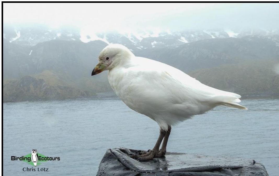
Snowy Sheathbill enjoying the South Georgia scenery from the ship deck

It snowed lightly most of the day, but nevertheless we managed to see some of the peaks and glaciers of South Georgia as we sailed towards Salisbury Plain, the site of a massive (60,000 strong!) King Penguin colony. We arrived at this site around 10:15 a.m. and did a walk to the penguin colony, experiencing highly territorial fur seals (see photos earlier in this report) en route. South Georgia Pipits , the world's most southerly-breeding passerine, proved easy to see around the penguin colony.