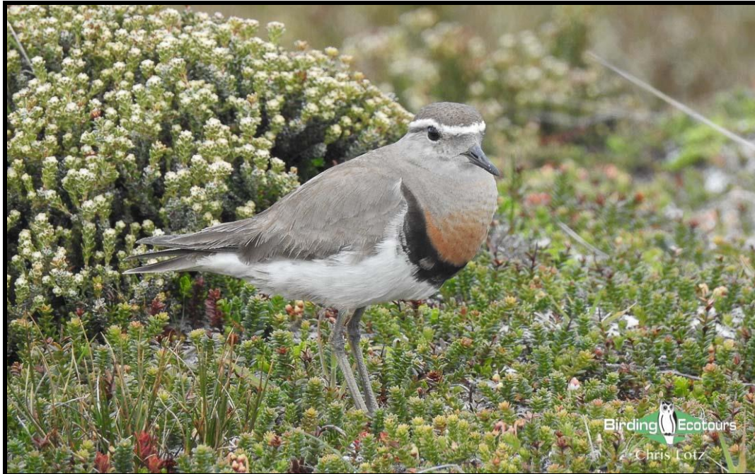
Rufous-chested Plover, near Stanley, Falkland Islands