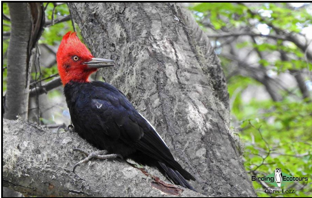
Male Magellanic Woodpecker, Tierra del Fuego National Park

At 4 p.m. we boarded our small ship, the Plancius , and started our sea adventure. Birding was exciting as we added species such as Magellanic Penguin , Black-browed Albatross , White-