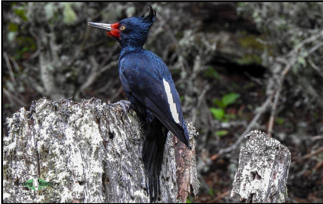
Female Magellanic Woodpecker, Tierra del Fuego National Park