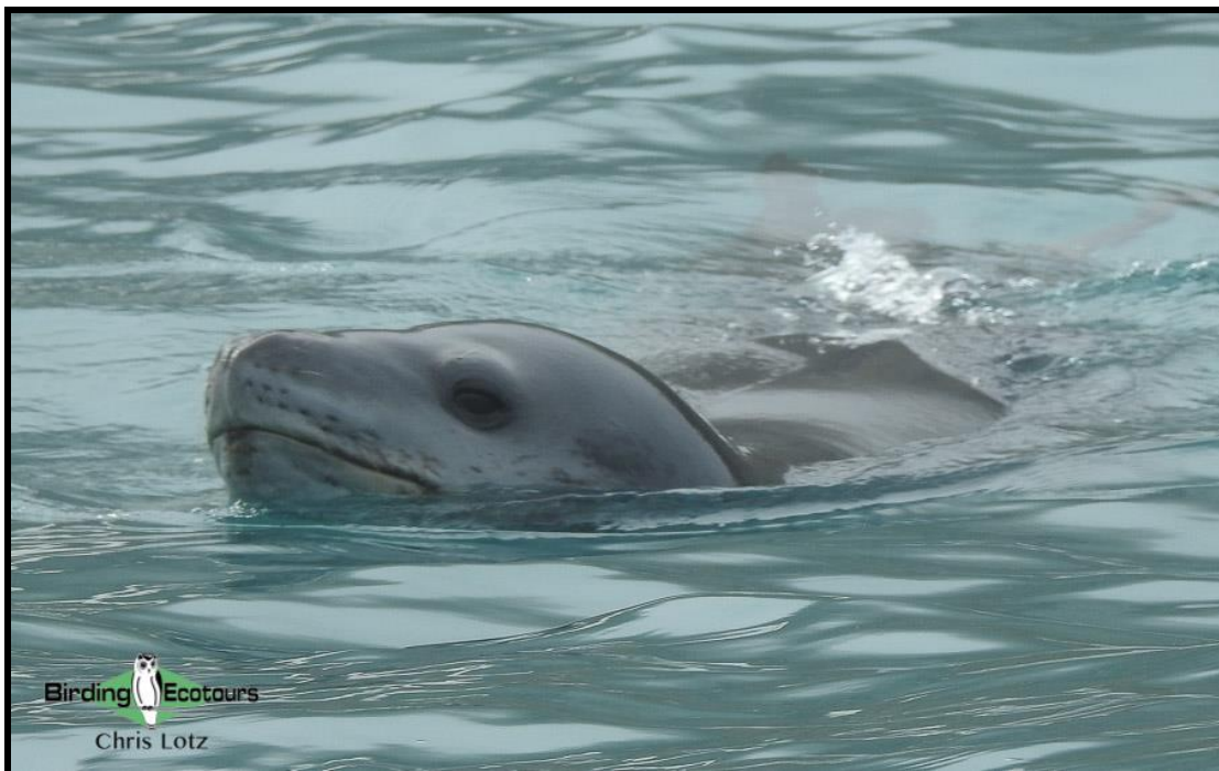
The friendly Leopard Seal that hung around our Zodiacs.

We found ourselves at the beautiful Elephant Island, part of the South Shetland Islands group, just north of the Antarctic Peninsula. We managed to get a view of Point Wild, where Shackleton landed on this island after he got stuck in the ice and his boat sank. We then continued to Cape Lookout, a spectacular place. Here we did a Zodiac cruise in the early afternoon. It turned out to be spectacular, not only with scenery, but also because a Leopard Seal hung around the boat for a while, and we also saw Chinstrap Penguins and Macaroni Penguins on the rocks. The Leopard Seal seemed very inquisitive and followed us wherever we went, even coming back to the ship with us (but luckily not boarding). Antarctic Shags were new for the trip. There were also various other interesting birds, such as thousands of Cape Petrels (many of them settled on the water), Snowy Sheathbills , etc., etc.