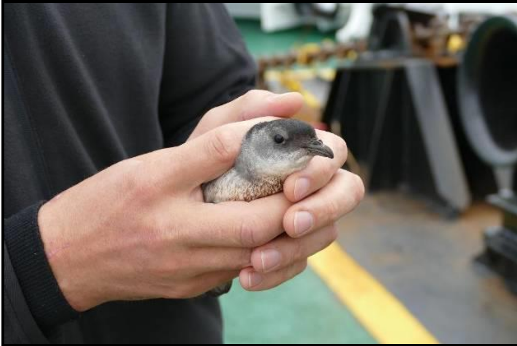
The South Georgia Diving Petrel that was found on deck

South Georgia Diving Petrel on the deck early this morning – seabirds often do find their way onto ships; usually attracted to lights.