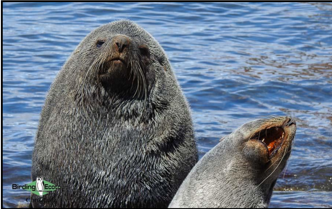
A friendly pair of Antarctic Fur Seals from later in the trip (South Georgia).

useless when not in the water and they have to slide and wiggle along like reptiles. We also saw South American Fur Seals . Peale's Dolphin was a real mammalian highlight seen from the ship later.