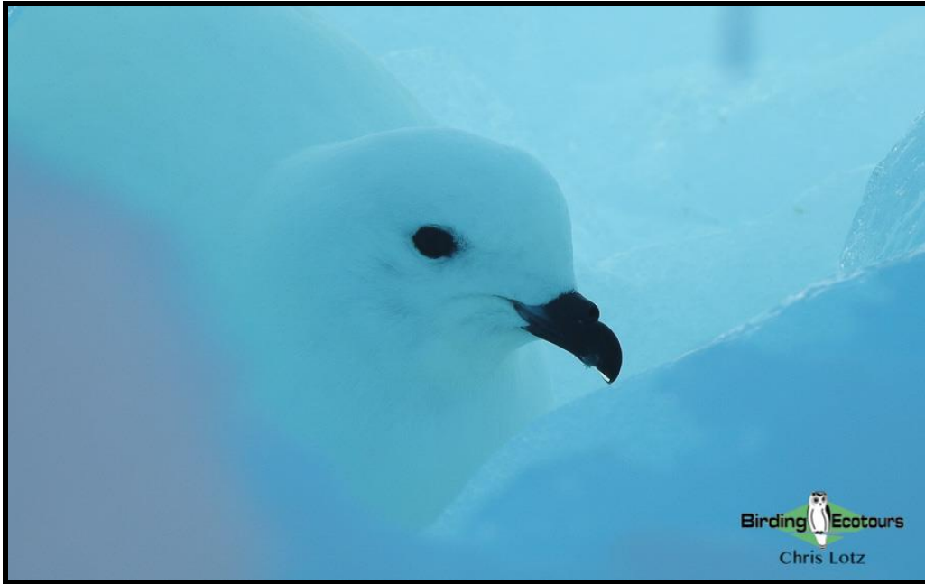
Snow Petrel roosting in the ice

In the mid-afternoon we did a Zodiac cruise among the sea ice! At the start of this cruise, we saw a small, young Leopard Seal . We alighted on the ice a couple of times and were treated to a Snow Petrel roosting in a hole in the ice! An Adelie Penguin also joined us on the ice at one point. Just before we re-boarded the ship we saw a South Polar Skua . All in all, a spectacular afternoon! The weather really “played ball” today.