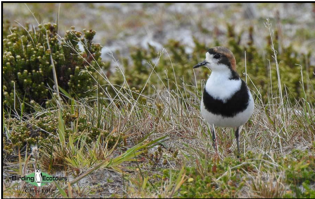
Two-banded Plover near Stanley, Falkland Islands