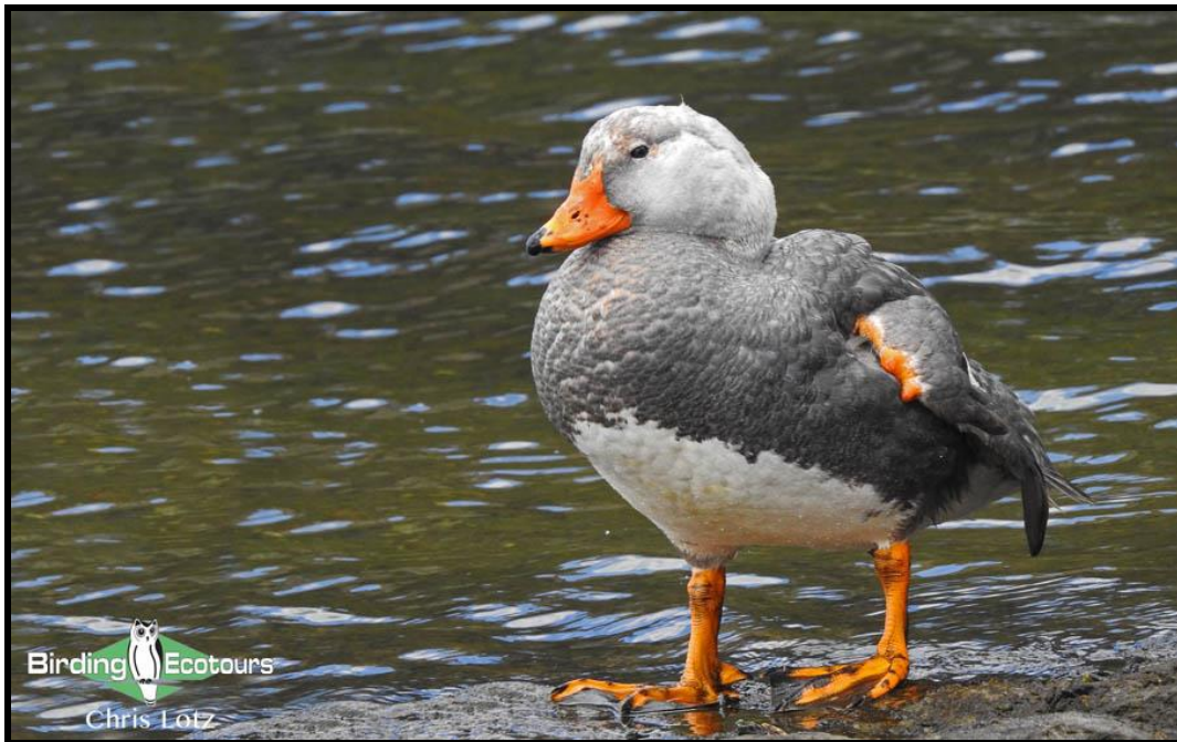
Fuegian Steamer Duck, Tierra del Fuego National Park

We also found Austral Parakeet , Chilean Swallow , Magellanic Woodpecker (both males and females giving stupendous views; a couple of them flew noisily over my head), Dark-bellied Cinclodes feeding along a beach, Buff-winged Cinclodes , White-throated Treerunner , Thorn-tailed Rayadito , Chilean (White-crested) Elaenia , Austral Negrito , Tufted Tit-Tyrant , House Wren , Austral Thrush , Correndera Pipit , spectacularly crimson-fronted Long-tailed Meadowlark , Patagonian Sierra Finch , Black-chinned Siskin , Rufous-collared Sparrow (which extends literally from the northern to the southern extremities of South America) and, dare I mention it, House Sparrow .