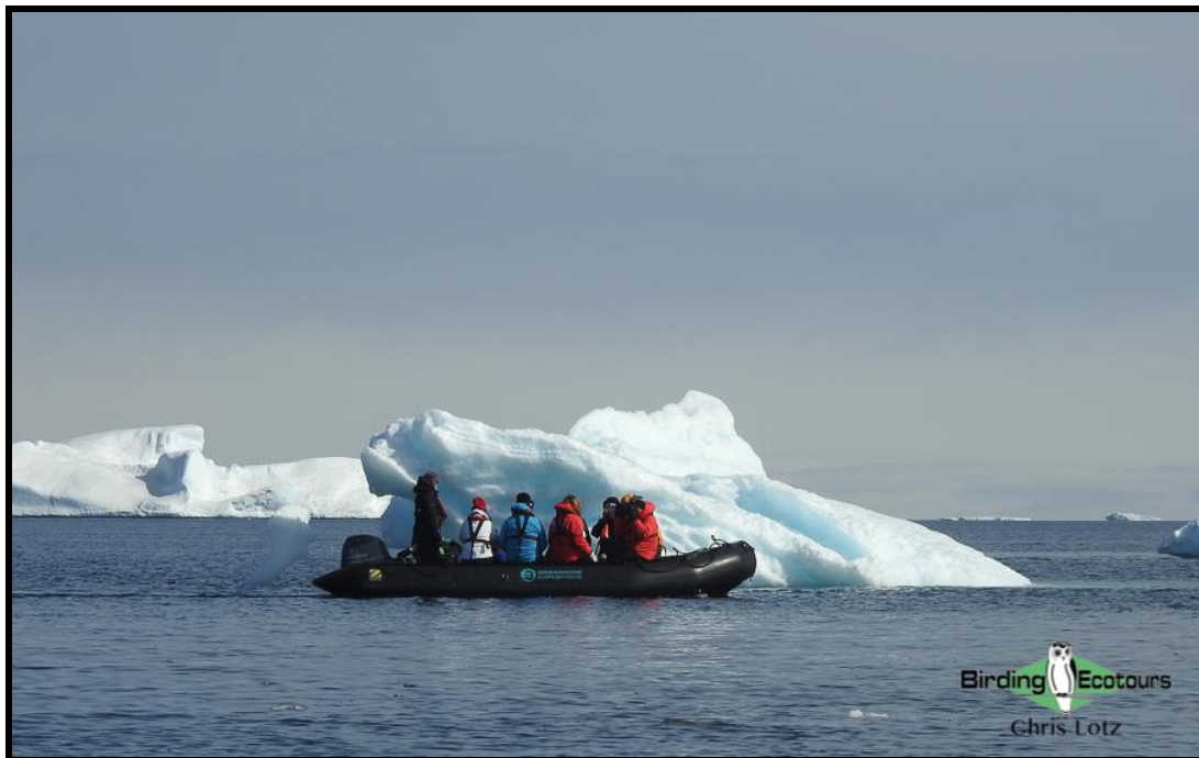
Zodiac near Brown Bluff

After breakfast we landed at the impressive Brown Bluff, where we enjoyed a colony of a new Penguin species for the trip, Adelie (and there were also breeding Gentoo Penguins and a lone Chinstrap Penguin around). A few Snow Petrels were also clearly breeding up on the cliffs, as were hundreds of Cape Petrels . We got some amazingly close views of Wilson's Storm Petrels as they touched their feet on the water near the Zodiac on the cruise to the penguin colony, and also as they flew past us over land – they too must have been breeding nearby. Skuas searched for Kelp Gulls (which were also breeding here) to steal food from. We had to wait until the Zodiac returned to the cruise ship before we got good enough views of a pale-morph South Polar Skua to clinch the identification and to get this one onto our list. There were a couple of Antarctic Terns around as well. This was a memorable morning, also including a spectacular walk onto a glacier (affording spectacular views of the area as we gained some height).