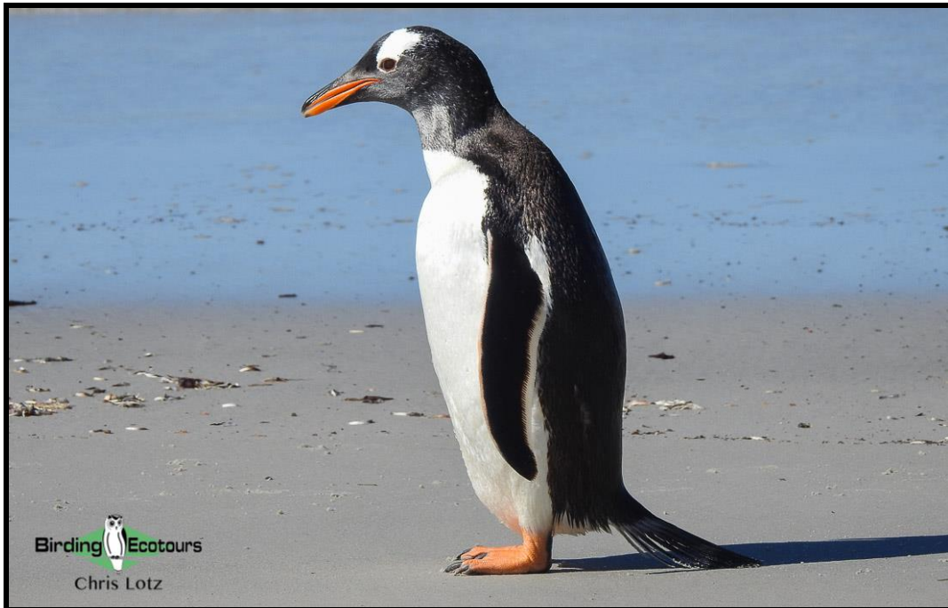
A quizzical-looking Gentoo Penguin on the beach at Saunders Island

Mammal-wise this was also an excellent day. We saw our first Southern Elephant Seals (but we had to wait until later in the trip before finding the giant males of this species). It's comical watching these smaller, young Southern Elephant Seals moving on land, as their flippers are