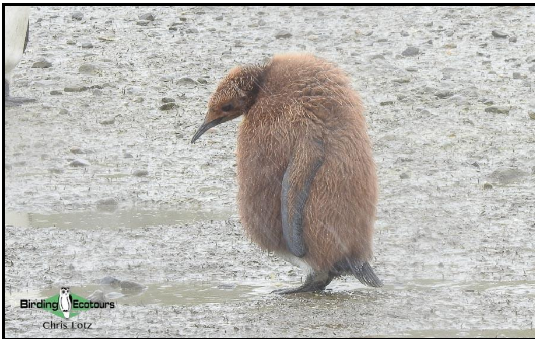
A forlorn-looking King Penguin chick