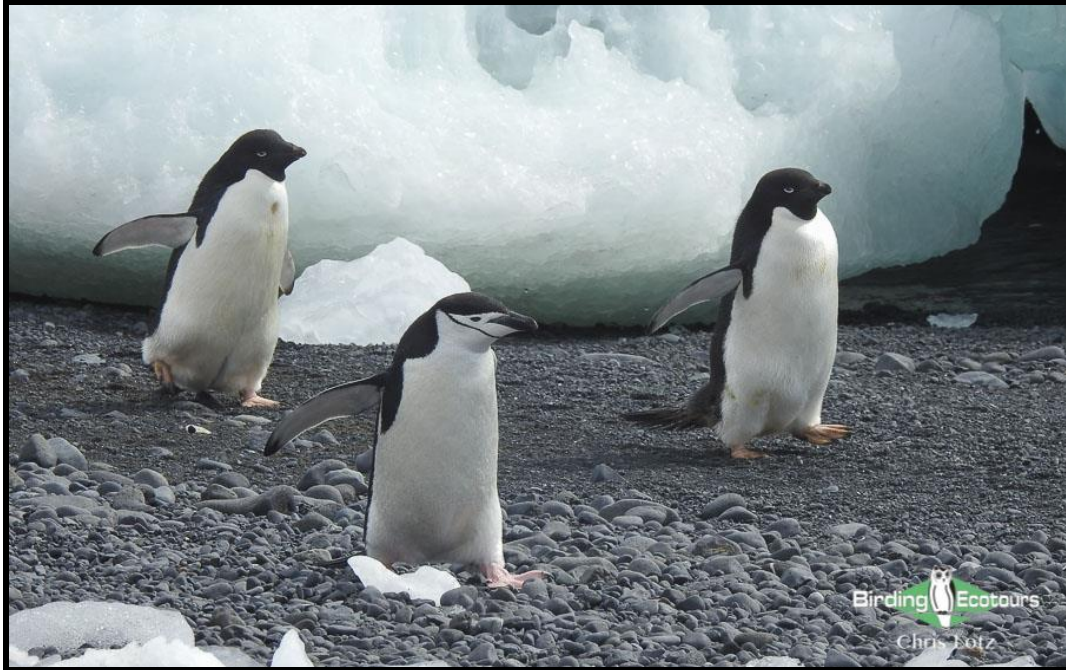
Which do you prefer, Chinstrap or Adelie Penguin?