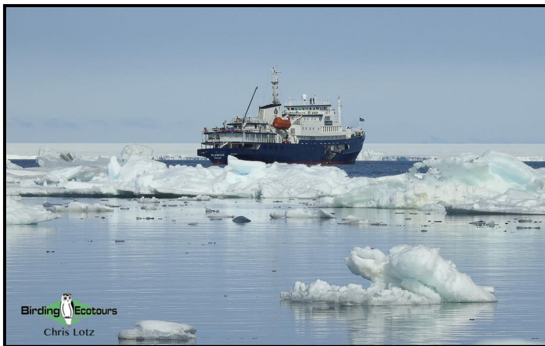
The Plancius in Antarctica