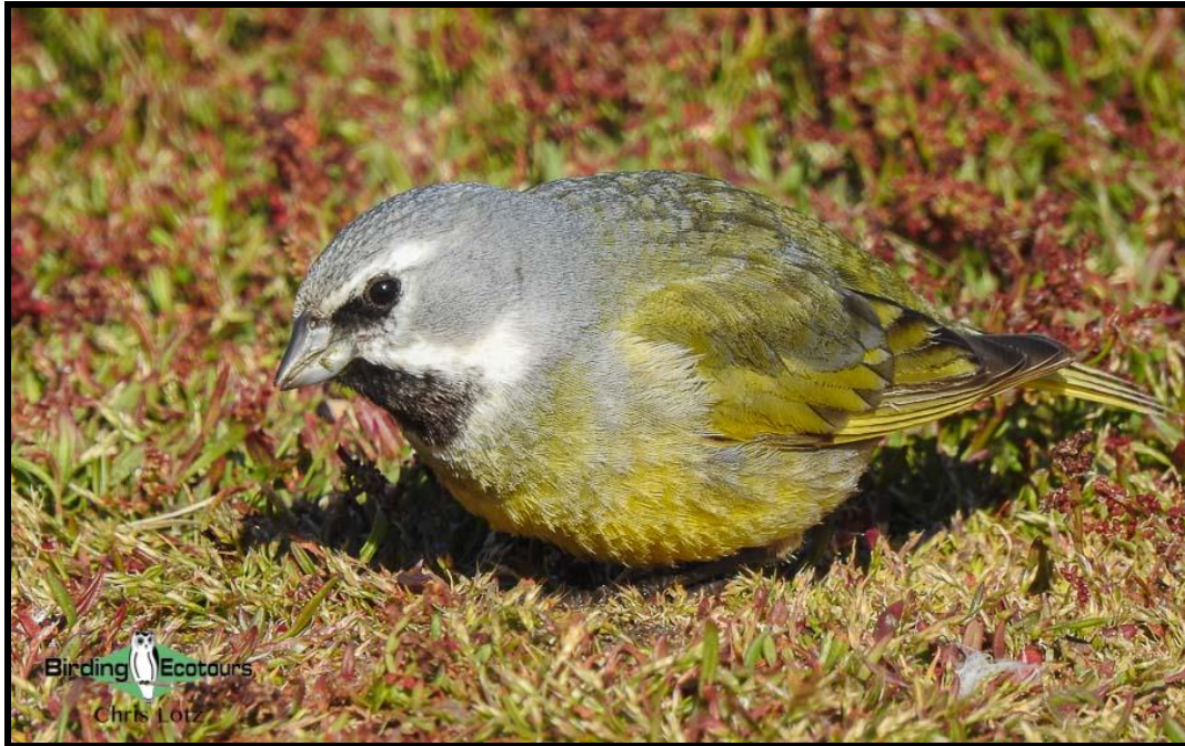
White-bridled Finch, Carcass Island, Argentina