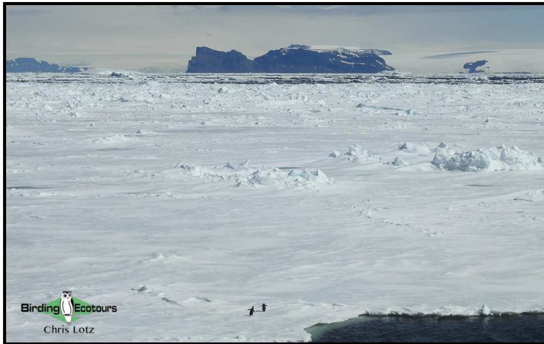
Entering the Weddell Sea

cruised past a Crabeater Seal and a huge Leopard Seal , both lying on sea ice. Snow Petrels flew around, and Adelie Penguins stood on the ice.