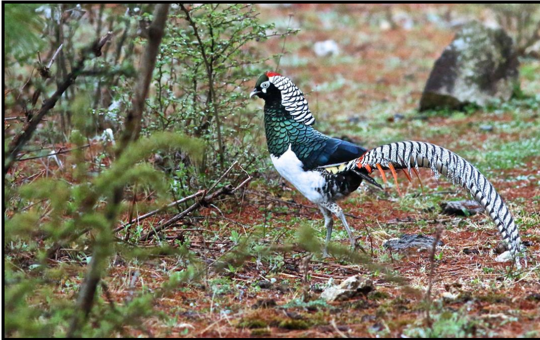
There are many stunning gamebirds possible on this Sichuan tour, one of the best must be Lady Amherst's Pheasant.

We will spend the full day birding at, and around the excellent Labahe Nature Reserve , where we will look for plenty more exciting birds like Temminck's Tragopan , Lady Amherst's Pheasant , Specked Wood Pigeon , Himalayan Swiftlet , Salim Ali's Swift , Bearded Vulture , Himalayan Vulture , Eurasian Three-toed Woodpecker (and eight other species), Long-tailed Minivet , Spotted Nutcracker , Fire-capped Tit , Pere David's Tit , Chinese Cupwing , Pygmy Cupwing , Asian House Martin , Collared Finchbill , Black Bulbul , Sichuan Leaf Warbler , and Large-billed Leaf Warbler .