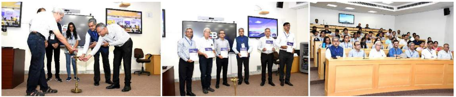
YEB 2022 Inaugural Ceremony