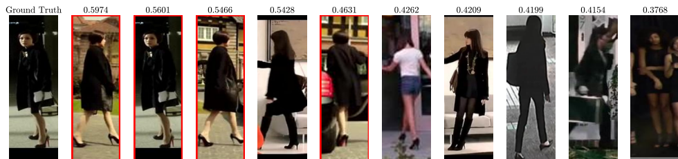
(c) The woman is wearing a high-level black coat and tall black high heels on her feet.