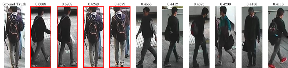
(a) He is wearing grey pants , a dark long sleeved sweater , and a light collared shirt underneath . He is carrying a black backpack on two shoulders .