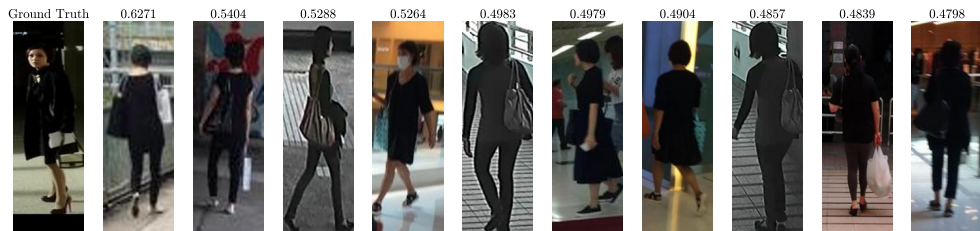
(b) The woman with dark hair has all black clothes and shoes with a white handbag .