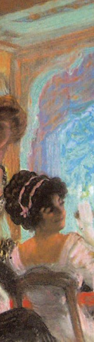
In the Box , 1909 by Boris Kustodiev