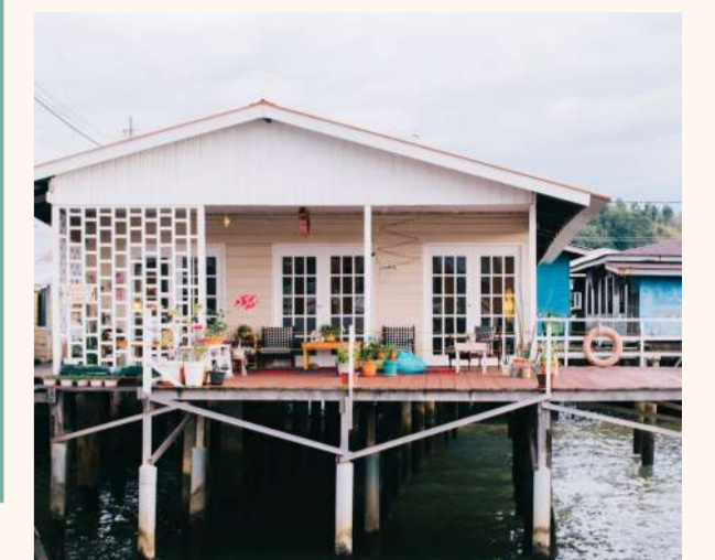
Kunyit 7 Lodge

IG: @kunyit7lodge_bn FB: Kunyit 7 Lodge Tel: 673-8713714