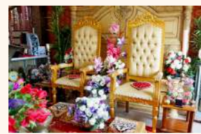
Rumah Ketua Kampong Lurong Sikuna

#2, B1, Skim Perintis, Jabatan Lela Menchanai, Kampong Lurong Sikuna (673-8816873/ 673-2201194)