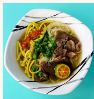
Soto at Restoran Terapung