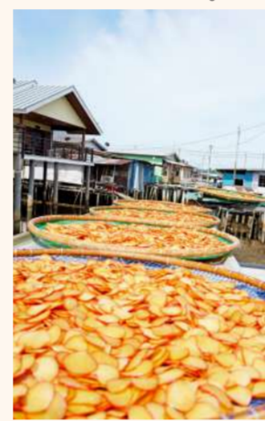
Prawn Crackers Maker