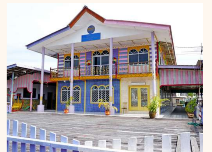
Colourful House (House Jabal Rahmah)