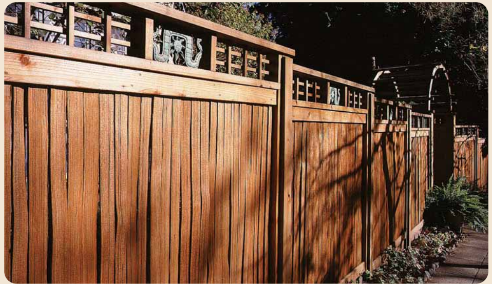
Redwood products store carbon long-term in beautiful decks, fences and other outdoor projects.

Furthermore, much of the energy used to power sawmills and produce finished redwood lumber is clean biomass energy. Bark, wood chips, scraps and sawdust from mill operations are used to generate energy on-site. Some redwood mills even generate excess electricity for California's power grid. ■