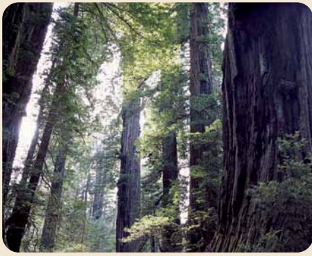
Managed redwood forests remove millions of tons of carbon from the atmosphere every year.