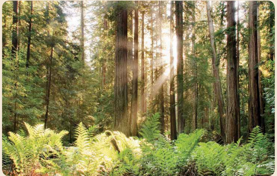
Private redwood forestland in Northern California.

A full 80 percent of California's managed redwood forests are certified as sustainable