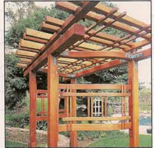
The curved sides of this arbor required ten separate laminations. Jones finds it easy to create curves using a urea-resin based glue and 3/16th redwood laminations.

Discover the creative potential of redwood. Send for the free booklet Redwood Decks, Fences and Garden Structures .