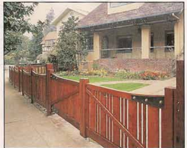
A penetrating oil finish with an ultraviolet light stabilizer preserves the richness of redwood that Jones finds so appealing. Iron hinges were forged by a local blacksmith and painted to prevent ferrous stains.