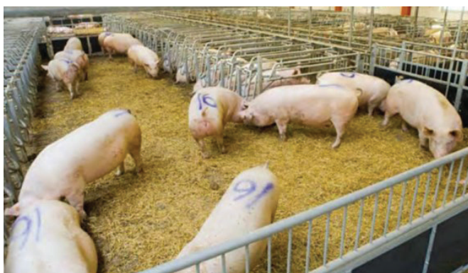
Figure 2. L-shaped pen layout in an FAS system.

No matter how many sows are housed in a pen, every sow must have access to one feeding space. Overloading the pen and forcing sows to share feeding