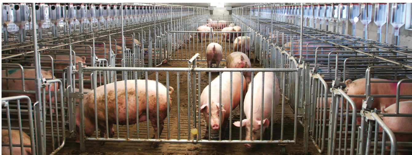
Figure 1. I-shaped pen layout in an FAS system.