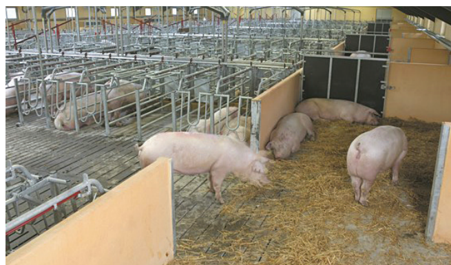
Figure 3. T-shaped pen layout in an FAS system.