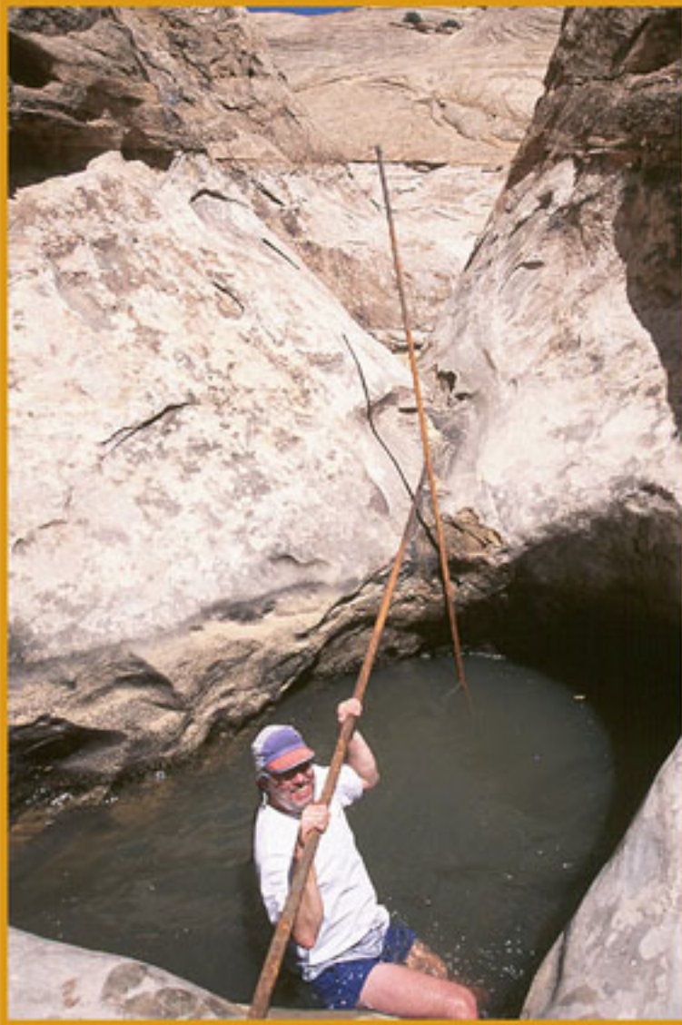
First Pothole, Knotted Rope Canyon

For the Directissima , follow the slickrock ramp down to the sandy bottom of the canyon, which quickly closes into a tight canyon. The first potholes can be bypassed by climbing up slickrock to the left, then dropping back into the canyon 100 feet further down.