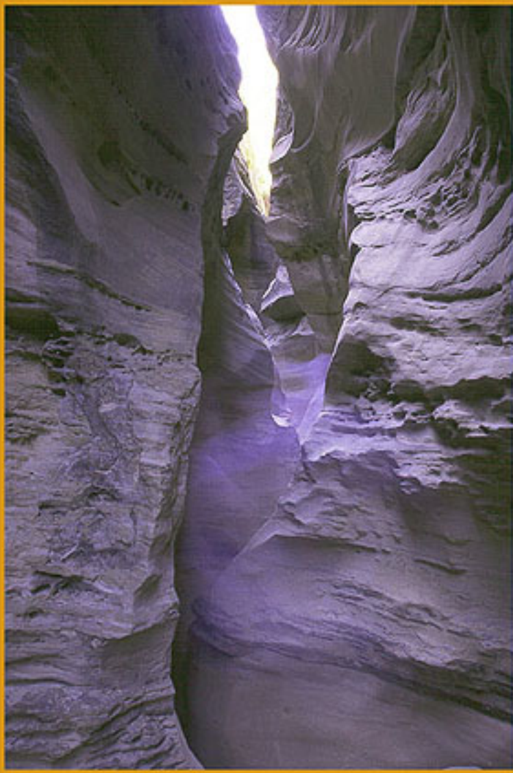
Narrows in Little Wild Horse Canyon

Descend Bell Canyon. There are a few minor obstacles, but nothing too strenuous. Bell is about half as long as Little Wild Horse. You pop out back at the intersection. Return to the car.