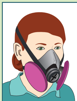
EHMR with an exhalation valve filter