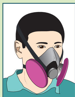
EHMR with an exhalation valve