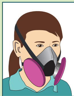
EHMR with no exhalation valve