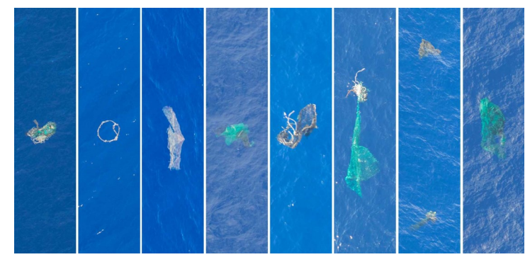
A selection of large objects observed in the Great Pacific Garbage Patch during the Aerial Expedition