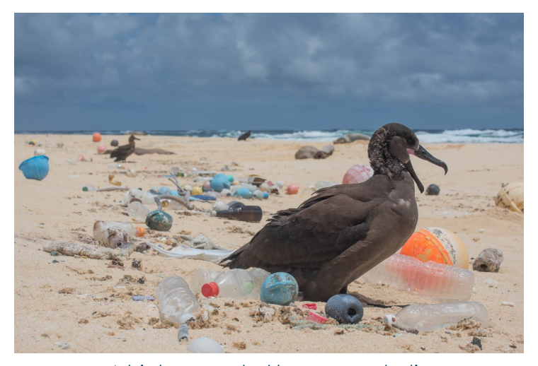
A bird surrounded by ocean plastic on the Northwestern Hawaiian Islands