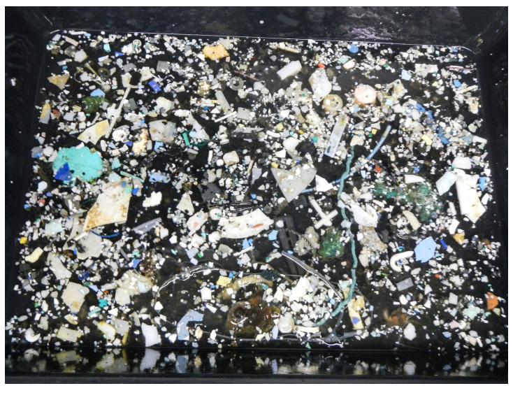
Plastic samples collected during The Ocean Cleanup's Mega Expedition, 2015