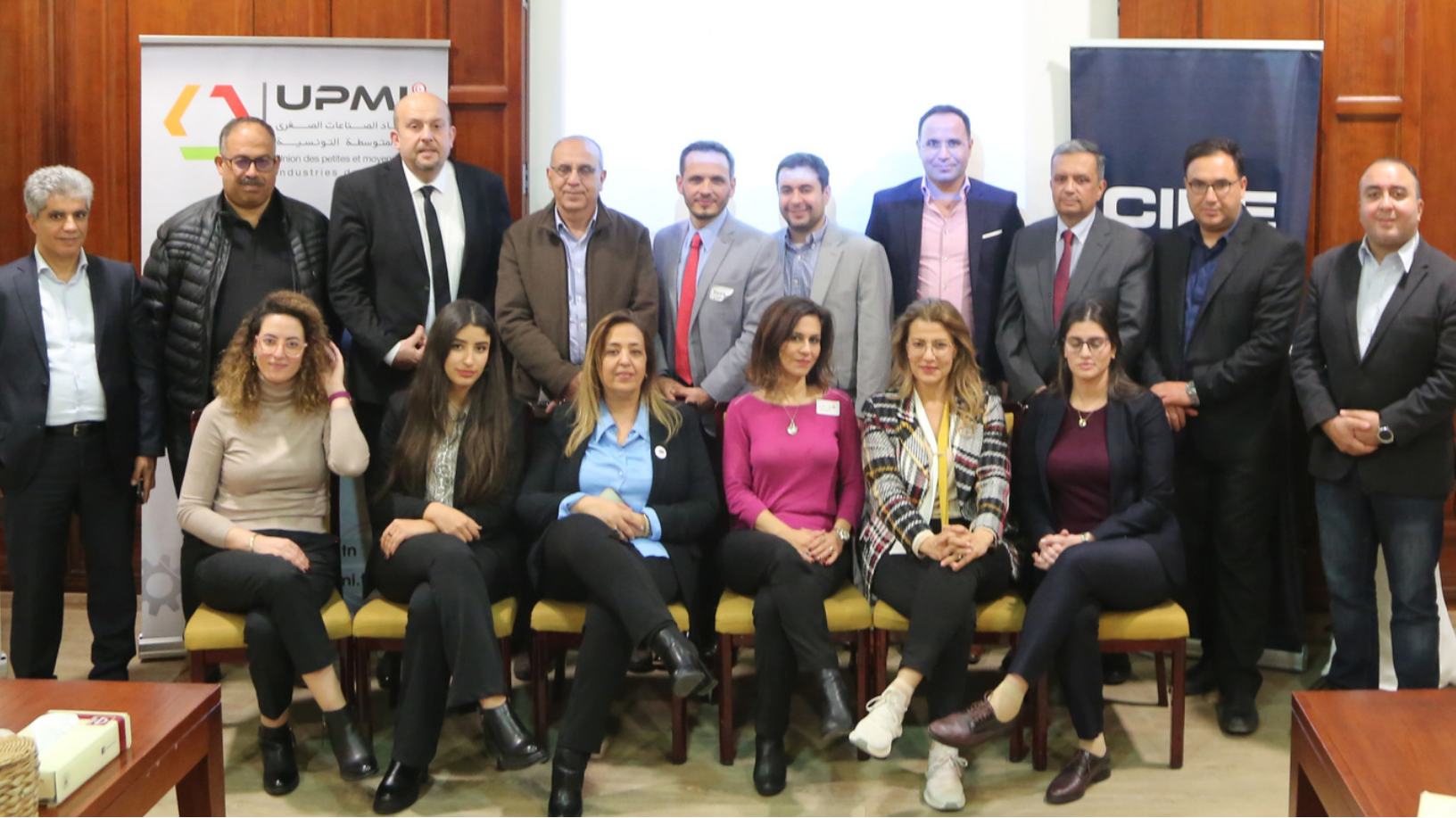
Knowledge HUBS Partner Roundtable in Sfax, Tunisia

To culminate the project and reach the cross-country learning objectives, PPL worked with CIPE MENA and the Tunisia Field Office to organize an exchange with four partner organizations on how the private sector can respond to citizens' expectations and rebuild trust in key institutions, which included a discussion of the HUBS surveys CIPE conducted in Bolivia, Ukraine, and Tunisia on the public perception of political and economic reform. These partners, who received small grants through the Knowledge HUBS project, then hosted a public event showcasing their work, including new communication tools that they will use to change minds on the role of the private sector in Tunisia's economy.