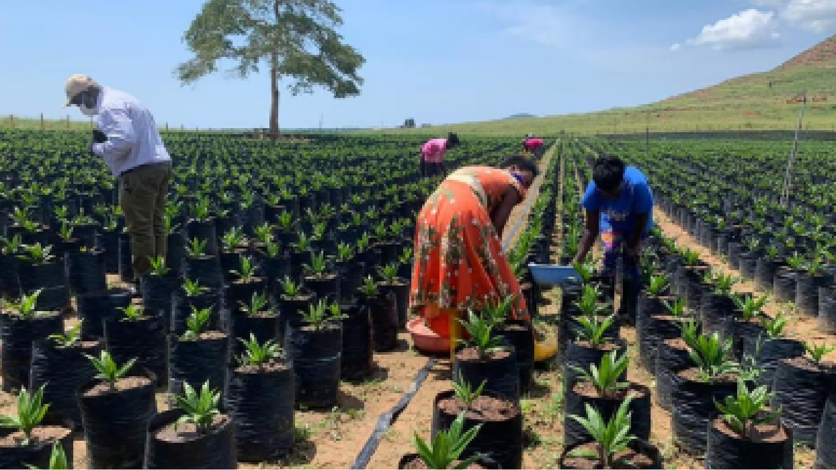
Small holder farmers in Buvuma District, Uganda.