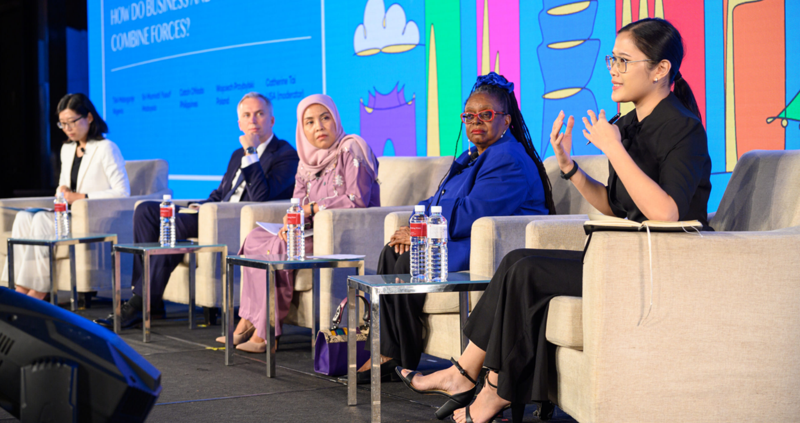
CIPE Delegation at the Global Assembly of the World Movement for Democracy.