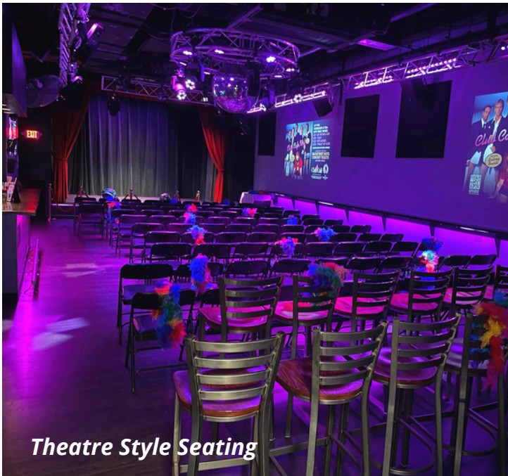
Theatre Style Seating