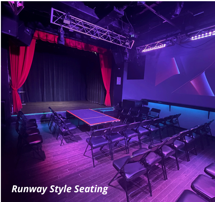
Runway Style Seating