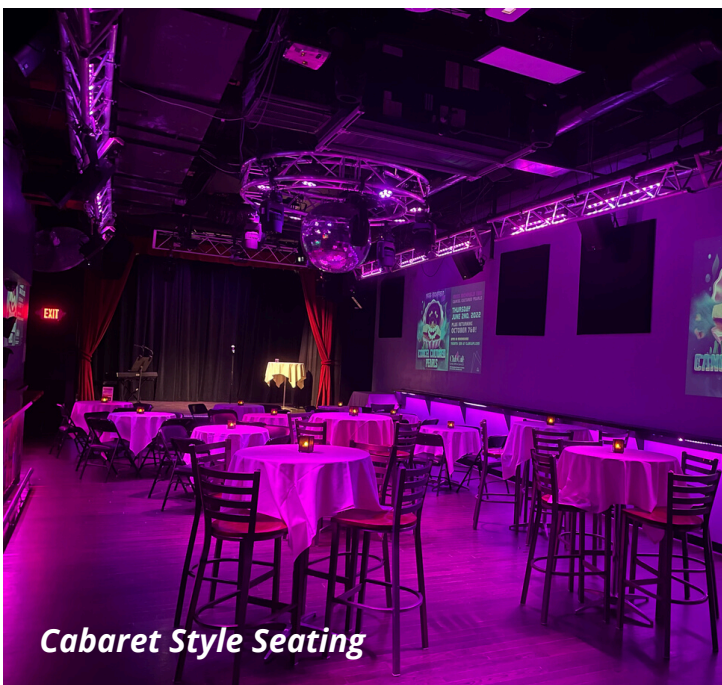
Cabaret Style Seating