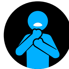
Shortness of Breath