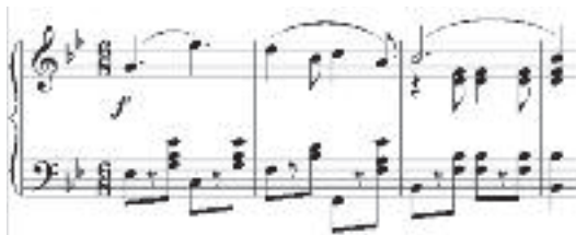
Figure 17: Cadential approach via traditional subdominant preparation ( Liberty Bell , Piano version, trio, mm. 29–32)

Sousa's cadential dominants are almost always preceded by I 6/4, which is approached in turn by a chord ranging from a ii or IV construct (see Figure 17) to a chromatic, or "scientific," chord like a diminished or half-diminished seventh, an augmented sixth, or a Phrygian-approached III (see Figure 18). 14 Cadences approached by the barbershop secondary dominant formula so characteristic of ragtime seldom find their way into Sousa's marches (however, an exception can be seen in Figure 19). By such cadential possibilities, Sousa found fresh ways to approach the final two pitches of a melody, even within the harmonic restraints he sets for his marches. (Both functional and colorful chromatic elements are far more prevalent in his songs and descriptive pieces.)