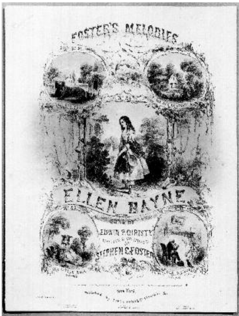
Figure 5. Cover of "Ellen Bayne." (New York: Firth, Pond, & Co., 1854)