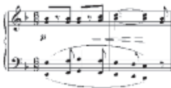
Figure 11: Moving bass overlapping staccato and held notes at half cadence ( Liberty Bell , Piano version, first strain, mm. 3–4)