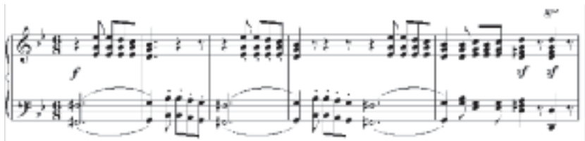
Figure 10: “Battle” exchange ( Liberty Bell , Piano version, trio interlude, mm. 1–7)