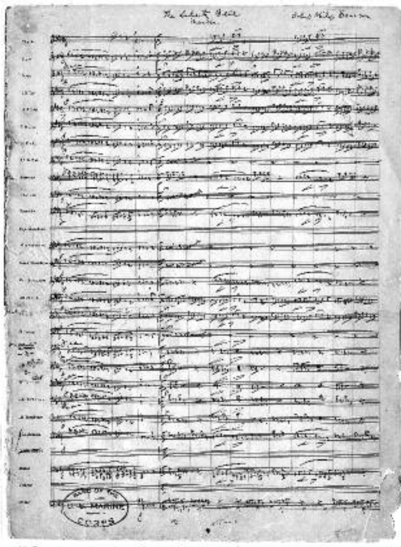
Autograph manuscript, John Philip Sousa, The Liberty Bell March, 1893.