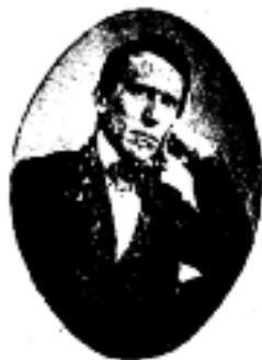
STEPHEN C. FOSTER.