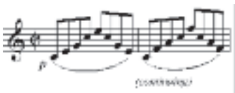
Figure 20: Musical image of rippling water ( Manhattan Beach , 2nd & 3rd B-flat Clarinets, third strain, mm. 1–2)

No consideration of Sousa's marches and their character would be satisfactory without mention of his musical imaging—which ranges from the brash (gunfire in The Rifle Regiment introduction, chimes in the Liberty Bell trio) and the cunning (the rippling of water of Manhattan Beach in Figure 20), to the exotic ( Gladiator , first strain, and Nobles of the Mystic Shrine , first strain—both minor). Signifiers are often confirmed or implied by Sousa's titles, which reflect the national, the military, the regional, the institutional, the commercial, the social, the sporting, and the violent. But considering his roles both as composer and performer, Sousa's most momentous and characteristic gesture is the one that concludes three-quarters of his marches: the triumphal, arm-swinging return from “battle.”