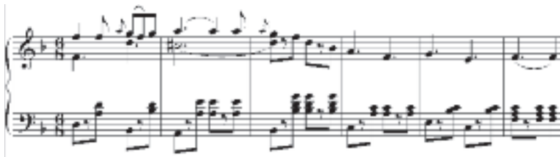
Figure 18: Cadential approach via "scientific" (here Phrygian) harmonic construct ( Liberty Bell , Piano version, second strain, mm. 11–16)