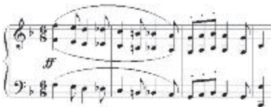
Figure 12: Melody presented in unaccompanied octaves ( Liberty Bell , Piano version, intro, mm. 1-4)

Further, the texture of Sousa's melodies is always clearly defined. At their most spartan, they sound forth in unaccompanied octaves (see Figure 12.). 11 Routinely, Sousa coupled his accompanied treble melodies in octaves, often upper and occasionally lower. After On the Tramp (1879) he eschewed the traditional Italianate melodic intervals of sixths and thirds so characteristic of the earlier quickstep (but see Figure 11 for an exception). 12 (Italian opera itself was concurrently experiencing a parallel trend toward octaves.) And even the laughter effect in the third strain of Belle of Chicago descends in plain octaves rather than thirds. Sousa's upper octave scoring for the higher clarinets can be stratospheric, similar to the clarinet scoring by his most admired predecessor, D. W. Reeves. That intense clarinet timbre is guaranteed to carry outdoors, though such passages were played an octave lower when Sousa the conductor signaled piano dynamics. In addition to the melodic and parallel octaves, Sousa frequently used the decorative octave for its crisp embellishment of a melody or for patter (see Figure 13).