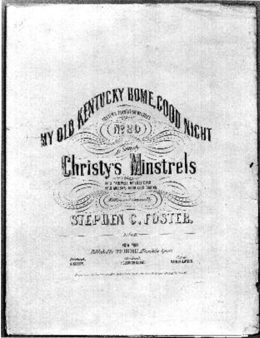
Figure 4. Cover of "My Old Kentucky Home." (New York: Firth, Pond, & Co., 1853)