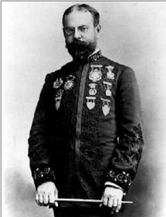
An 1898 photo of Sousa in the uniform of the Sousa Band, the civilian organization he formed after leaving the Marine Band in 1892.