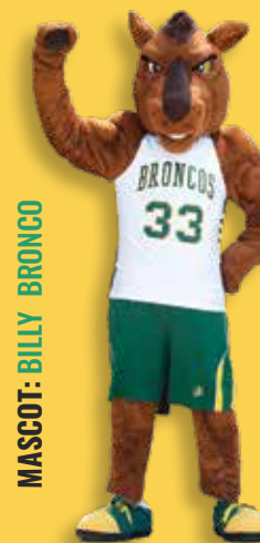
MASCOT: BILLY BRONCO

NCAA DIVISION II ATHLETICS WITH 11 TEAMS