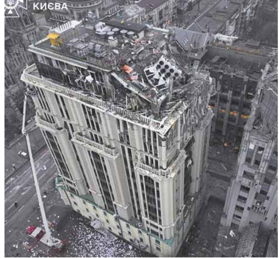
In this photo provided by the Ukrainian Emergency Service, firefighters work on the site of a damaged building after a Russian missile attack in Kyiv, Ukraine on Friday. AP/PTI

A Russian ballistic missile attack on Ukraine's capital Kyiv early Friday killed at least one person and injured nine others, officials said. Moscow claimed it was in response to a Ukrainian strike on Russian soil using American-made weapons. At least three loud blasts were heard in Kyiv shortly before sunrise. Ukraine's air force said it intercepted five Iskander short-range ballistic missiles fired at the city. The attack knocked out heating to 630 residential buildings, 16 medical facilities, and 30 schools and kindergartens, the city administration said, and falling missile debris caused damage and sparked fires in three districts. "We ask citizens to immediately respond to reports of ballistic attack threats, because there is very little time to find shelter," the air force said. During the almost three years since the war began, Russia has regularly bombarded civilian areas of Ukraine, often in an attempt to cripple the power grid and unnerve Ukrainians. Meanwhile Ukraine, struggling to hold back Russia's bigger army on the front line, has attempted to strike Russian infrastructure supporting the country's war effort. The Russian Ministry of Defence said the strike was in response to a Ukrainian missile attack on Russia's Rostov border region two days earlier. That attack used six American-made Army Tactical Missile System, known as ATACMS, missiles and four Storm Shadow air-launched missiles provided by the United Kingdom, it said. That day, Ukraine claimed to