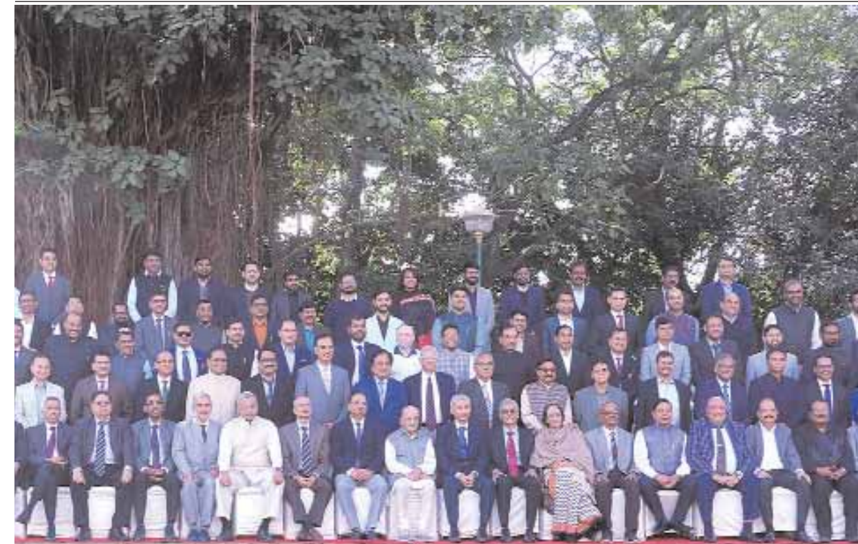
IAS Officers pose for a group photograph during the inaugural ceremony of Civil Service Meet-2024, at RCVP Noronha Academy of Administration in Bhopal on Friday.

that on the first day, children from different divisions of the state will present dances and various programmes based on folk culture. About 10 thousand children from 17 states and 5 Union Territories will participate in Bal Rang on 21 and 22 December. Scout camp, live exhibition focused on Vision-2024, stalls of cuisines of different states have been set up in Bal Rang. The most special thing about Bal Rang is that stalls of states have been set up here to showcase the culture of different states of the state. Archaeological sites, folk culture, festivals, temples, traditional costumes of those states will be showcased in these stalls. In the pandal of Kerala state, the girls of Kasturba School located at Jawahar Chowk, Bhopal have tried to show the culture of that place through models.