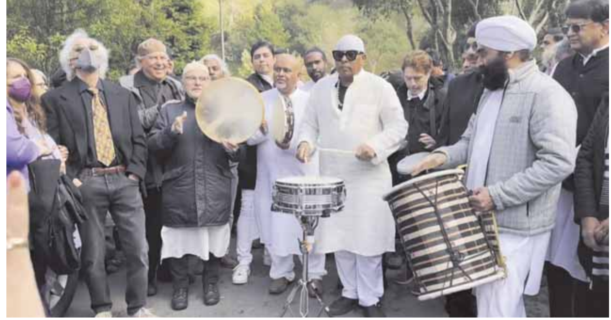
Percussionist A Sivamani performs during the funeral of Tabla maestro Zakir Hussain at Fernwood Cemetery in San Francisco, US, on Thursday.

in on social media as the news of Hussain's demise spread. Prime Minister Narendra Modi called him a true genius who revolutionised the world of Indian classical music. Grammy winner musician Ricky Kej remembered Hussain for his "immense humility, approachable nature". "One of the greatest musicians and personalities India has ever produced. Along with being the best himself, Zakirji was known for...being responsible for the careers of numerous musicians, who are now forces to reckon with themselves. He was a treasure trove of skill and knowledge and always shared and encouraged the entire music community through collaborations and his actions. His legacy will live on forever, and his influence will be felt for generations. He left us too soon," Kej had written on X after his demise.