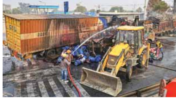
Firefighters at the site of the accident after a truck loaded with a chemical collided with some other vehicles and caught fire on the Jaipur-Ajmer Highway.

At least 11 people were killed and about 35 injured after an LPG tanker collided with a truck on Friday here sparking a massive fireball. It turned a stretch of the Jaipur-Ajmer highway into an inferno and nearly 40 vehicles were gutted. President Droupadi Murmu, Prime Minister Narendra Modi, Home Minister Amit Shah, Rajasthan Governor Haribhau Bagade, Chief Minister Bhajanlal Sharma and his predecessor Ashok Gehlot expressed grief over the loss of lives in the crash.