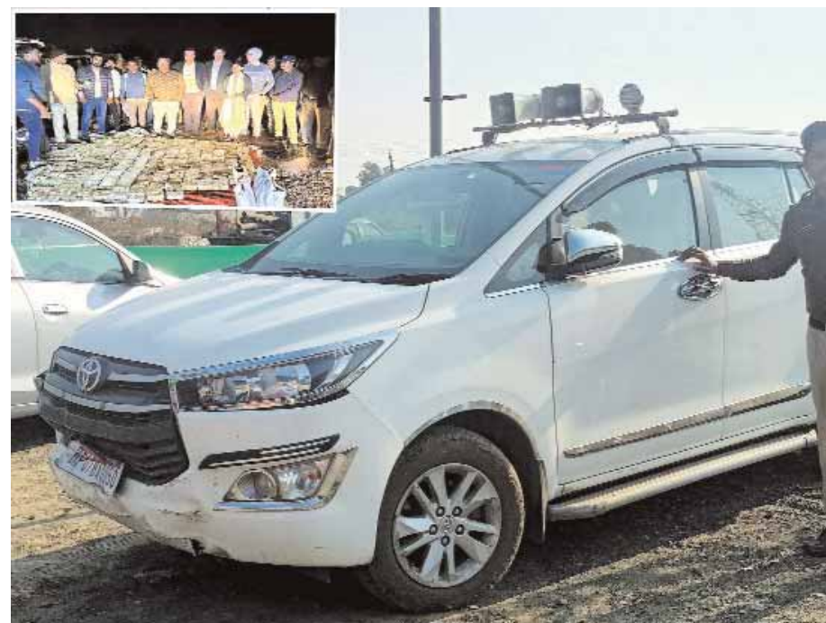
Ratibad Police and IT sleuths seized a car and recovered 52 kg gold and 10 crore rupees cash (seen inset) from Mendora village locality on Thursday night in Bhopal.