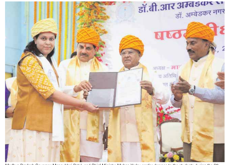
Madhya Pradesh Governor Mangubhai Patel and Chief Minister Mohan Yadav confer degrees to the students during the 6th convocation ceremony of Dr BR Ambedkar Social Science University in Mhow, Madhya Pradesh on Friday.