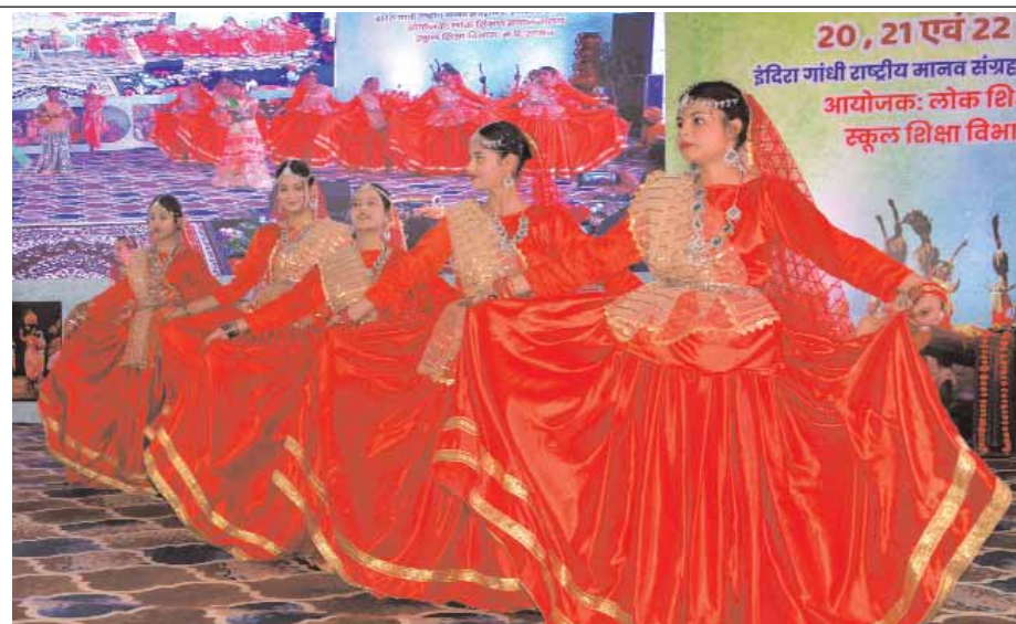
Students perform during three-day National Bhrang Festival-2024, at Indira Gandhi Rashtriya Manav Sangrahalaya in Bhopal on Friday.

and ensure the availability of clean drinking water to the city's citizens. Instructions were also given to complete sewerage-related actions promptly to increase revenue from sewerage charges, resolve sewerage issues quickly, and take action against those who release sewage openly. Action was also to be taken against developers who fail to establish Sewage Treatment Plants (STPs) in their colonies. The Mayor directed that STPs installed in colony campuses be operated efficiently. The Fire Department was instructed to make the best use of available resources and carry out fire-fighting operations with full diligence.