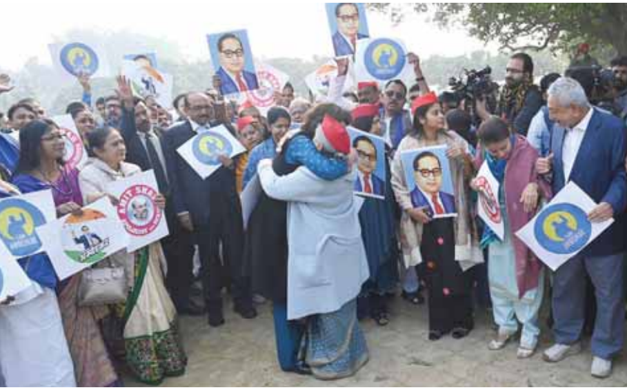
Congress MP Priyanka Gandhi Vadra greets Samajwadi Party MP Jaya Bachchan during INDIA bloc MPs' protest against Home Minister Amit Shah over his remarks related to Dr BR Ambedkar, at Vijay Chowk.

PUBLISHED FROM: DELHI | LUCKNOW | BHOPAL | BHUBANESWAR | RANCHI | RAIPUR | CHANDIGARH | DEHRADUN | HYDERABAD | VIJAYWADA