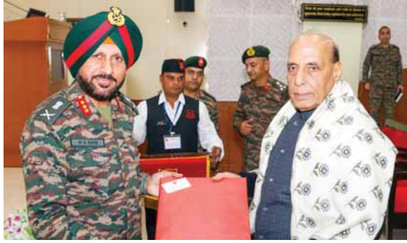
Defence Minister Rajnath Singh during his visit at the Army War College, at Mhow, in Indore district of Madhya Pradesh.

Rajnath said the Modi government is committed to strengthening integration and jointness among the three services. "In the times to come, the armed forces will be able to face challenges together in a better and more efficient way," he added. The defence minister said high-level training is provided to officers of all wings in the Mhow Cantonment. He appealed to