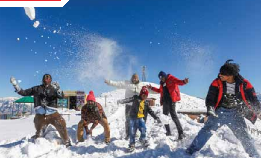
Tourists enjoy after fresh snowfall, at Patnitop hill station in Udhampur