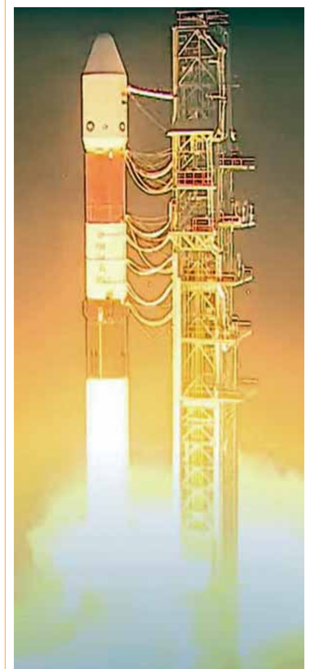
ISRO's PSLV-C60 carrying SpaDeX and its payloads, lifts off from the first launch pad at Satish Dhawan Space Centre, in Sriharikota