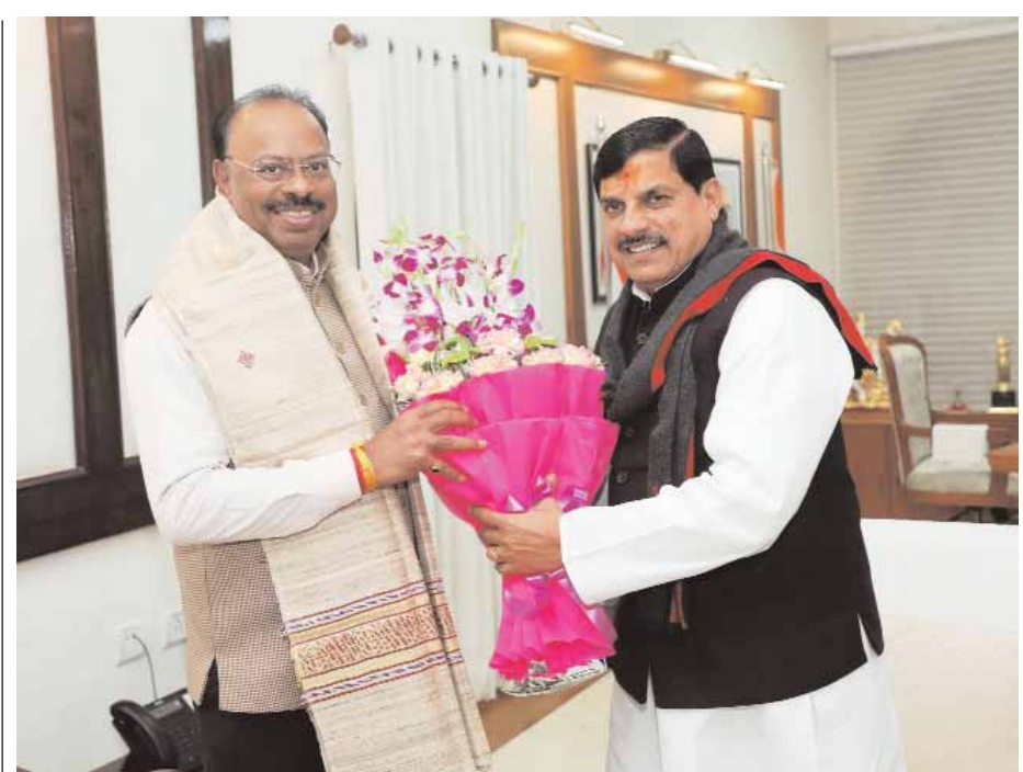
Madhya Pradesh Chief Minister Mohan Yadav with Maharashtra Revenue Minister Chandrashekhar Bawankule during a meeting in Bhopal on Monday.

soon as possible. The remaining work should also be completed expeditiously by removing obstacles in the upgradation work of Sidhi-Singrauli National Highway. Additional Chief Secretary in charge of Rewa division said that under the Redensification Scheme, a new collectorate building will be constructed in the newly formed Maihar and Mauganj districts. Construction of 3C-type residential houses in Mauganj will also be done by PWD (Building Wing). The new collectorate buildings of both districts will be built at a cost of about Rs 43 crore each. Chief Minister Dr. Yadav gave instructions to build new collectorate buildings in both the new districts based on the standard model built in other districts of the state.