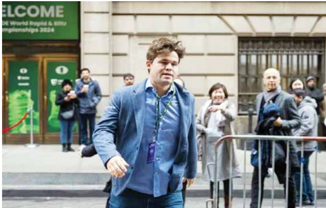
year-old Norwegian grandmaster said. But he added that he loves playing blitz — a fast-paced form of chess — and wanted fans to be able

"I think the situation was badly mishandled on their side," the 34-