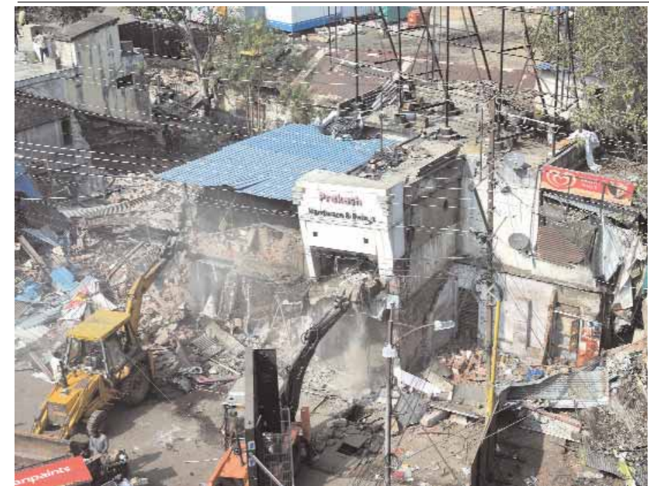
BMC employees demolish encroachment under Bhopal Metro Rail Project, at Alpana trisection in Bhopal on Monday.