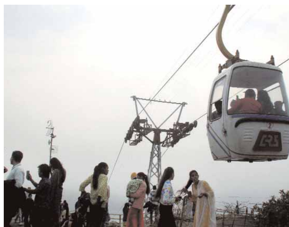
People enjoy cloudy weather on a cold winter day in Bhopal on Monday.

gradually spreading across the entire state. On December 31, foggy conditions are expected in districts such as Gwalior, Bhind, Morena, Datia, Sheopur, Shivpuri, Guna, Ashoknagar, Neemuch, and Mandasaur. A cold wave warning has been issued for Neemuch, Mandasaur, Agar-Malwa, Shajapur, Sheopur, and Morena on January 1 and 2, with temperatures expected to plummet further. The IMD has also urged residents to take precautions during the cold wave, especially in regions under alert, as the harsh conditions could pose health risks to vulnerable populations. The state is bracing for the extended spell of severe winter weather expected to dominate much of January.