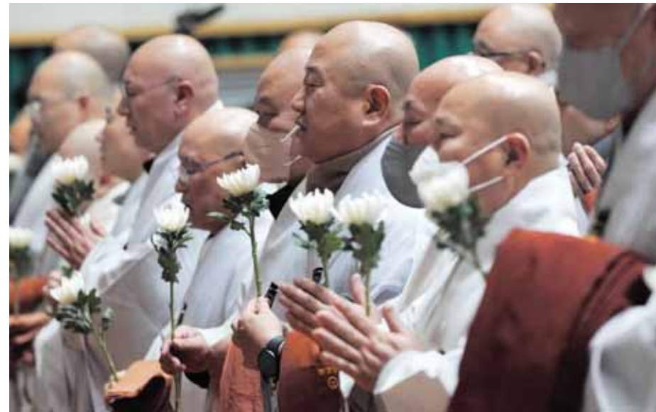
Buddhist monks (above) pray for the victims on a plane which skidded off a runway and burst into flames (left), at a memorial altar at Muan sport park in Muan, South Korea, on Monday.