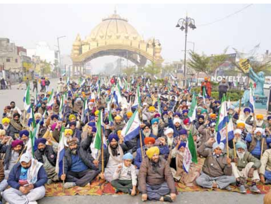
Farmers block a road during the statewide 'bandh' called as part of their ongoing protest at Punjab borders, in Amritsar

PIONEER NEWS SERVICE ■ CHANDIGARH / NEW DELHI